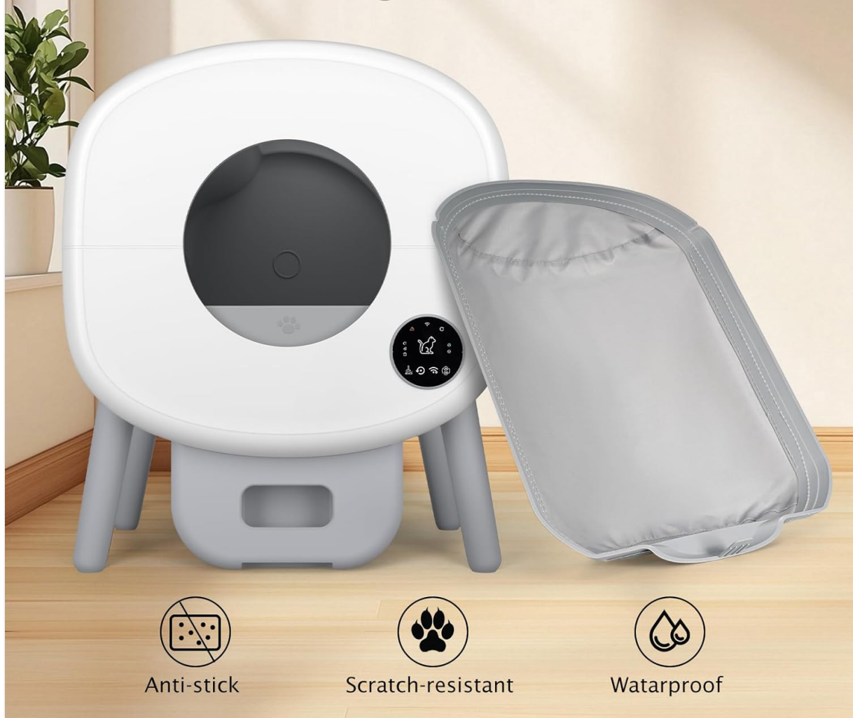
Figure 2.1: The M2 Waterproof Pad positioned alongside the Cumrige Self-Cleaning Litter Box, illustrating its intended use and compatibility.