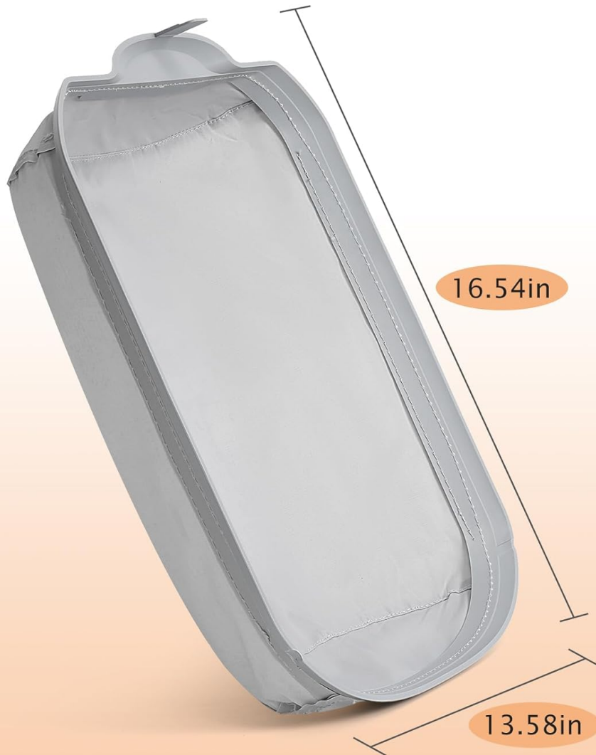
Figure 6.1: Diagram illustrating the key dimensions of the M2 Waterproof Pad.