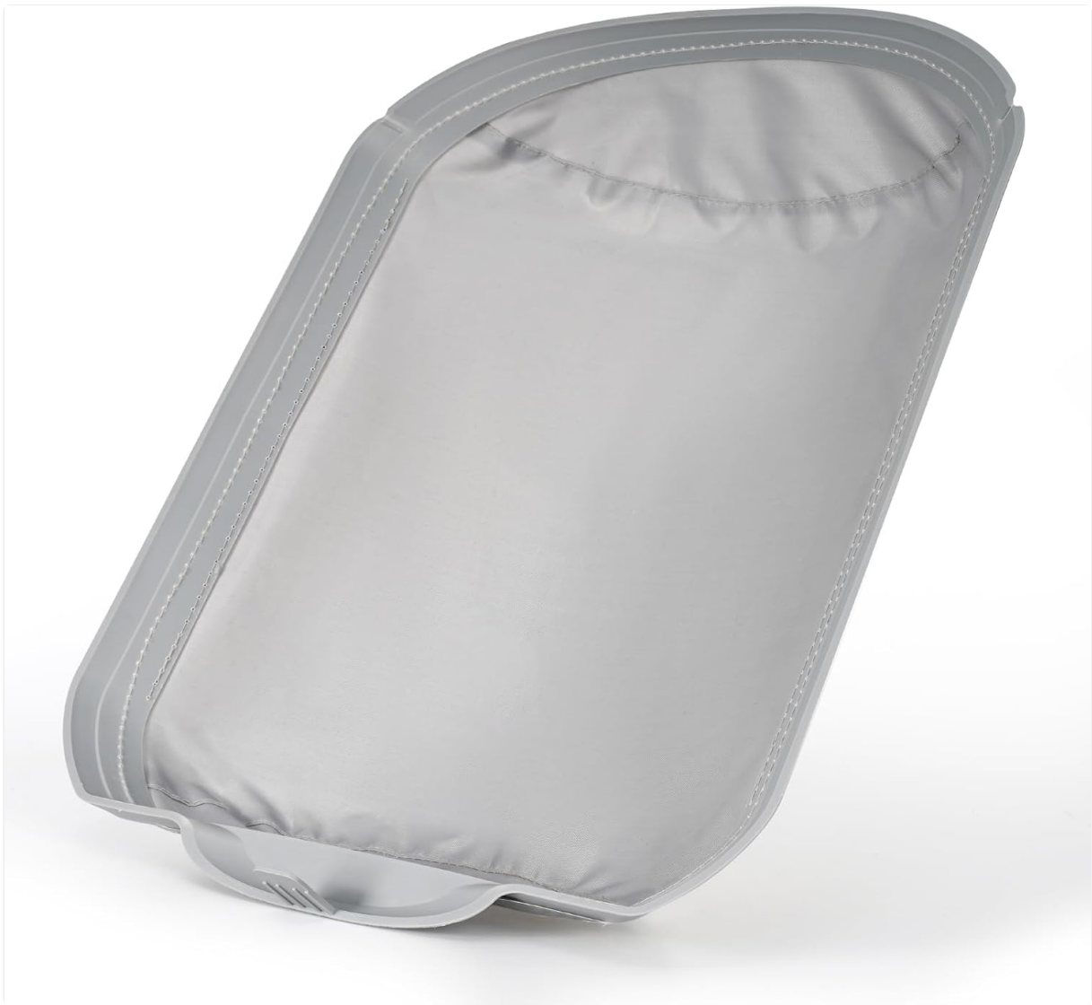
Figure 1.1: The Cumrige M2 Waterproof Pad, designed for optimal fit and protection within compatible self-cleaning litter boxes.