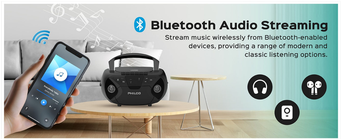
Image 5.3: The Philco Boombox wirelessly connected to a smartphone via Bluetooth for audio streaming.