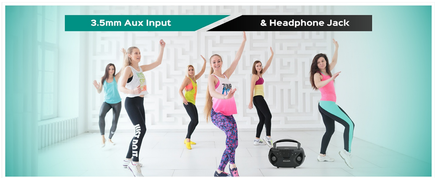
Image 5.4: The AUX input jack on the Philco Boombox, used for connecting external audio sources.