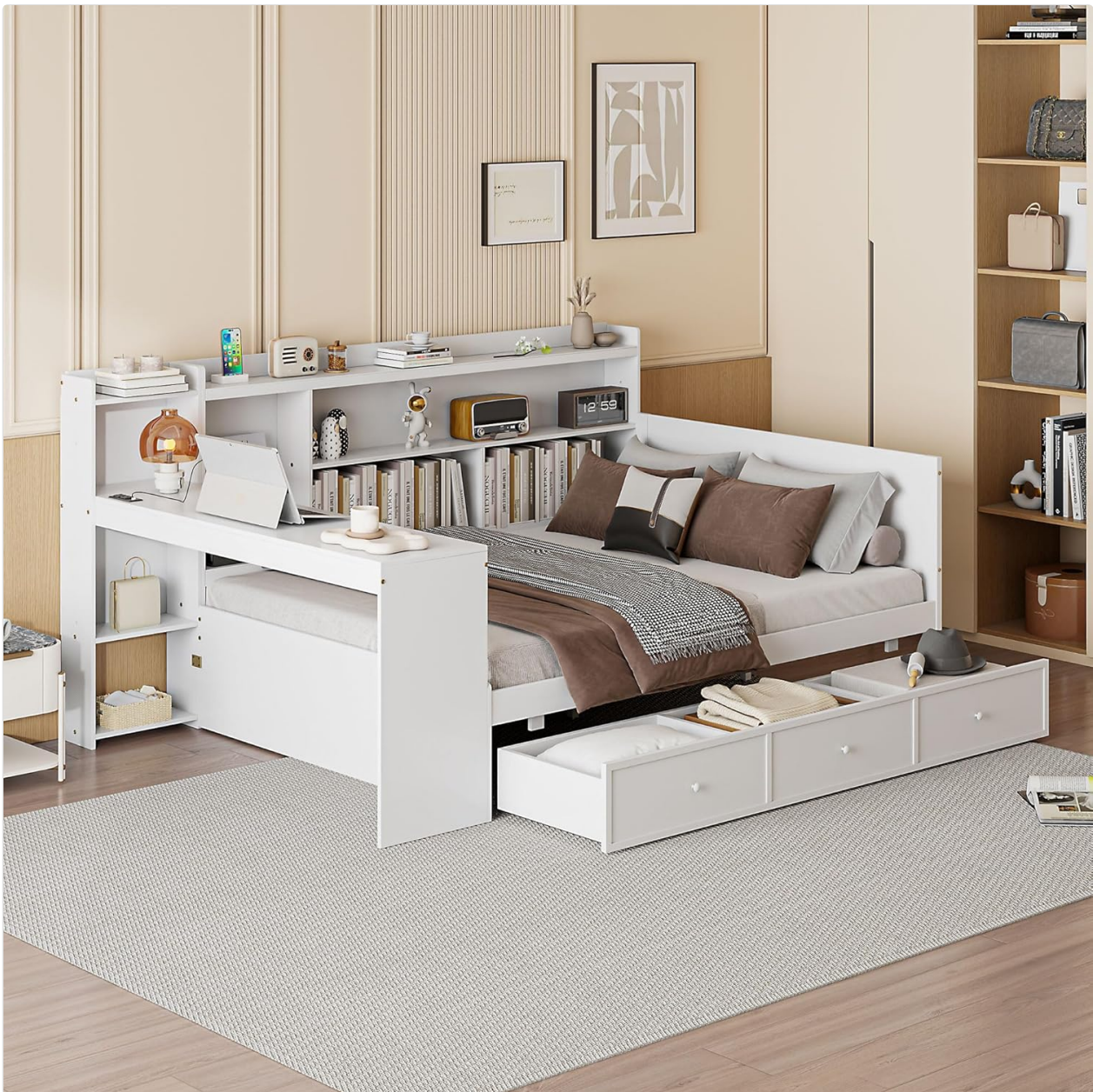
Figure 4.2: The integrated desk in use with a laptop and items on the shelves.