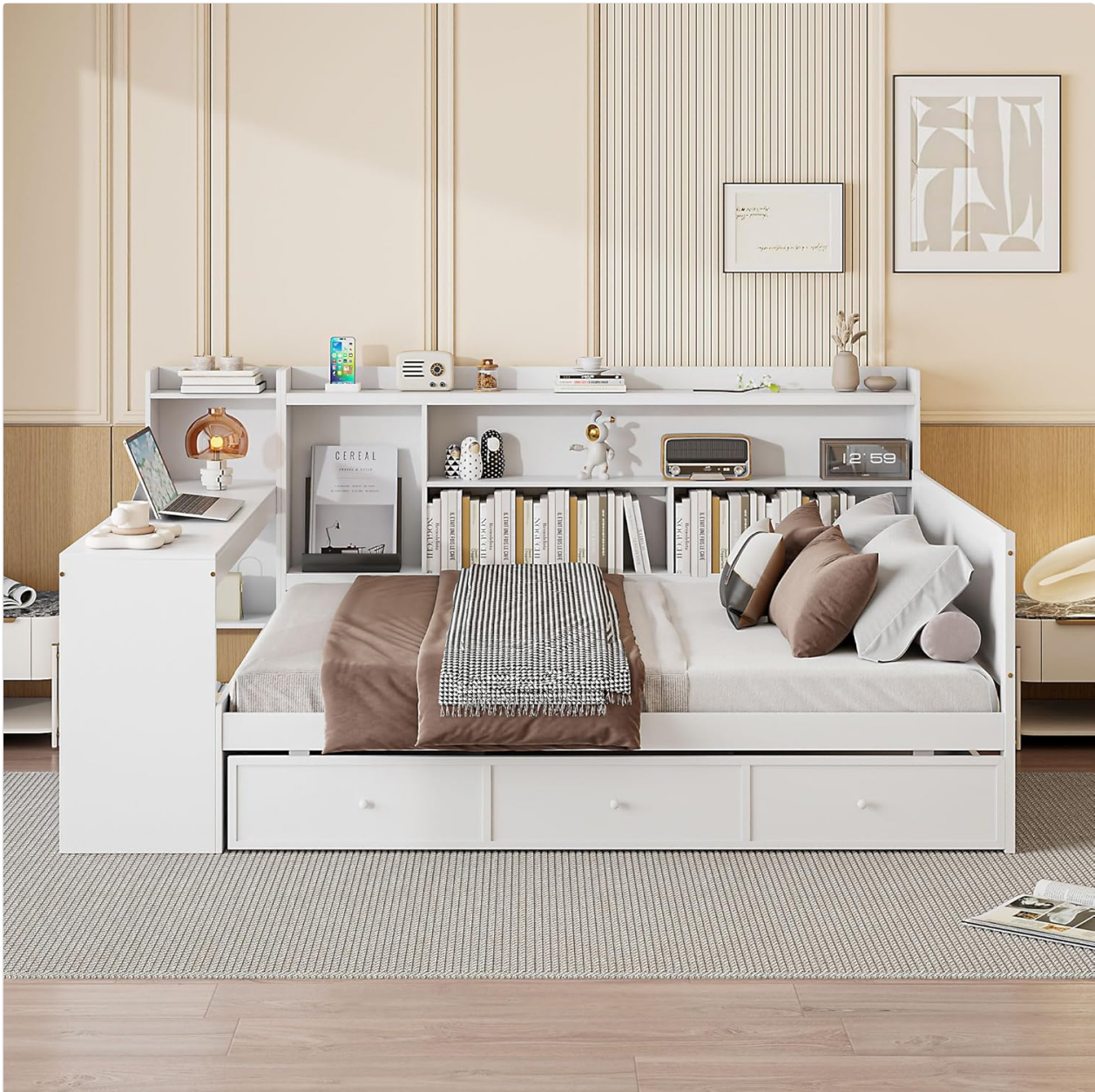
Figure 2.1: Overview of the VilroCaz Full Size Daybed with integrated desk and storage.