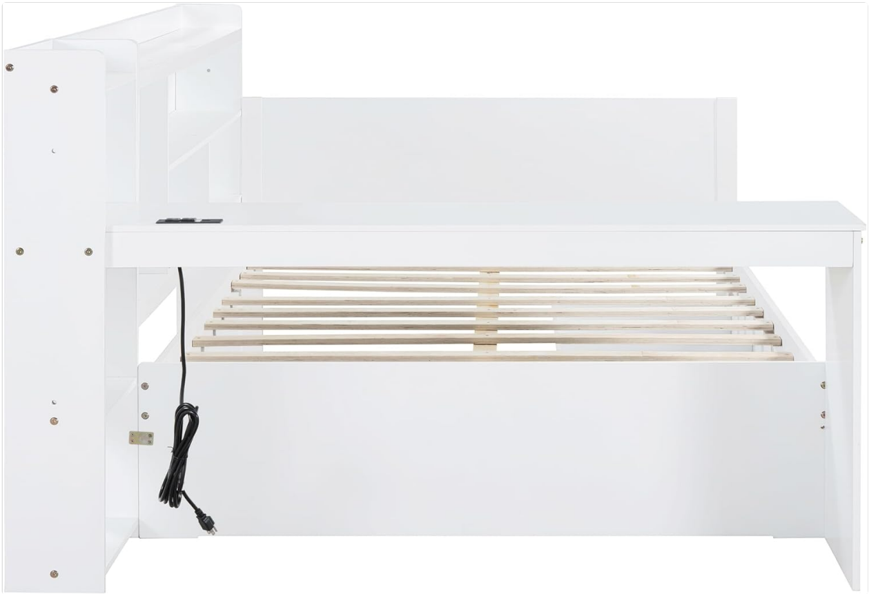
Figure 7.1: Detailed dimensions of the daybed components.