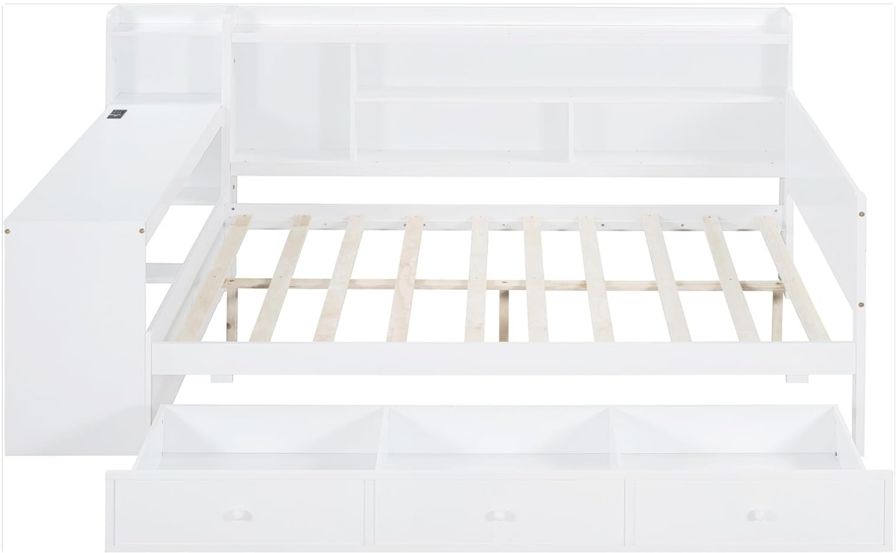
Figure 3.2: Partial assembly showing the bed frame, slats, and drawer compartments.