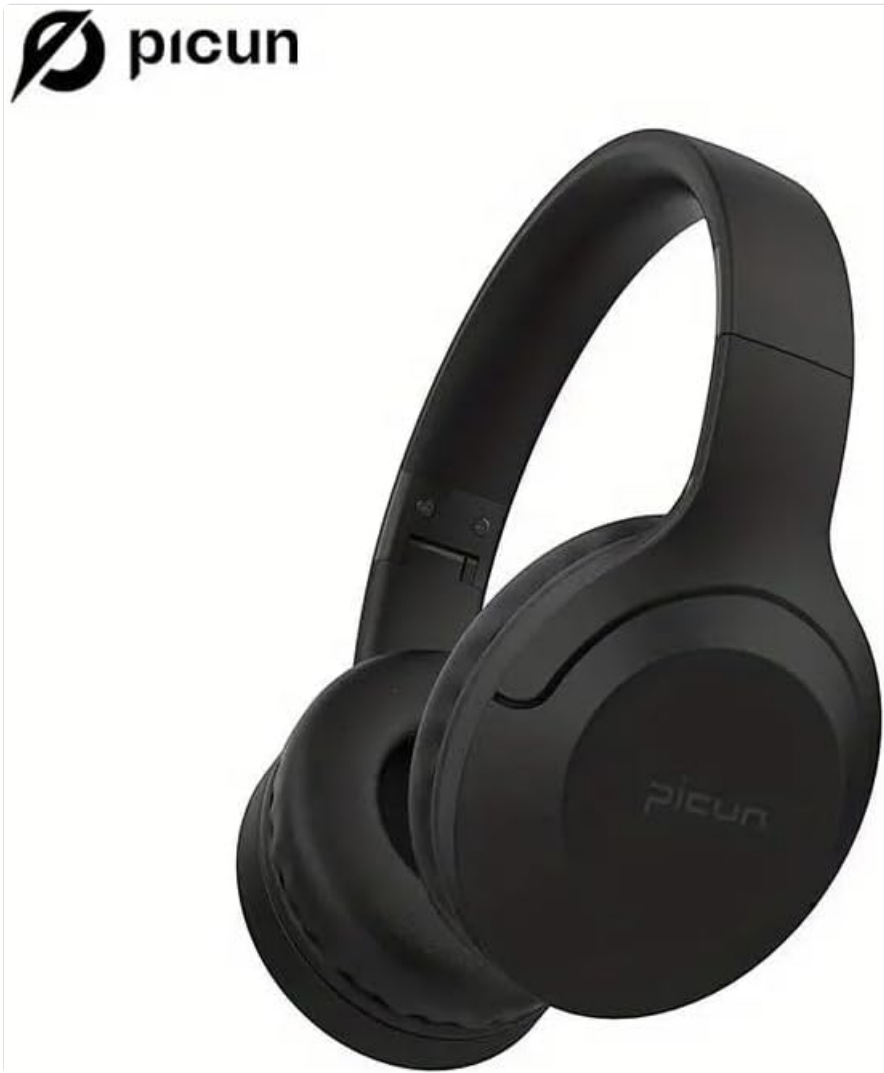
Image: PICUN B-01S Foldable Wireless Headphones (Black model). This image shows the side profile of the headphones, highlighting the earcups and adjustable headband.