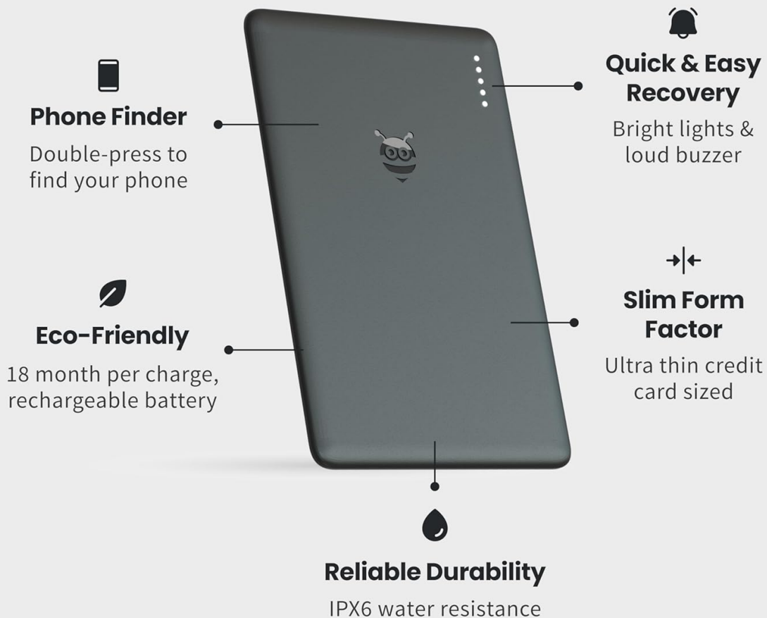
Image 2.1: The Pebblebee Tracker Card Universal, illustrating its key features such as phone finding capability, eco-friendly rechargeable battery, slim design, and IPX6 water resistance.