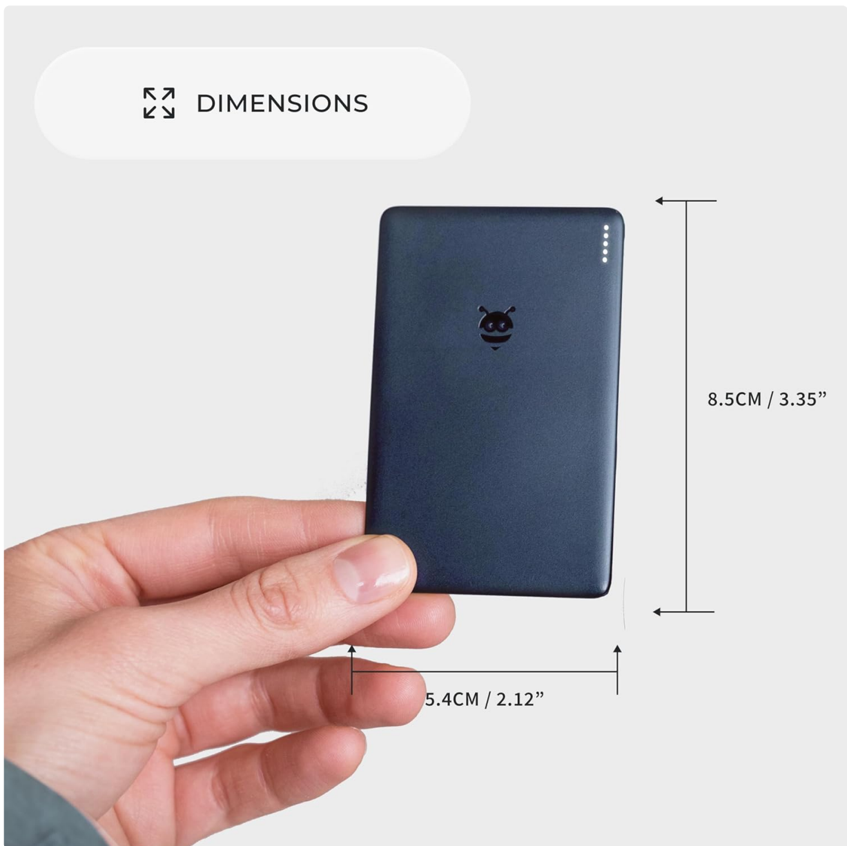
Image 7.1: Physical dimensions of the Pebblebee Tracker Card Universal.