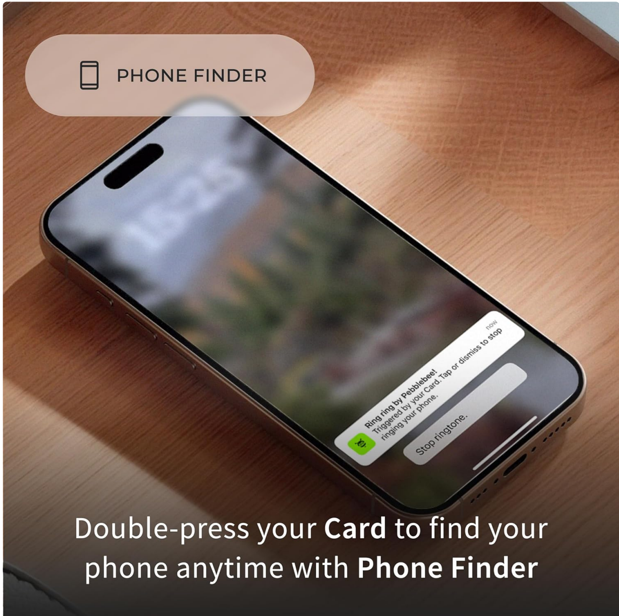
Image 4.1: The Phone Finder feature in action, showing a notification on a smartphone.