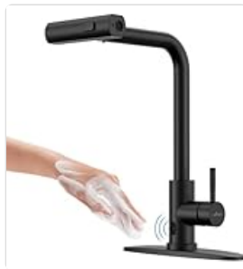
Image: The faucet's high-arc spout swiveling 360 degrees, highlighting the flexibility and the drip-free ceramic valve for reliable performance.