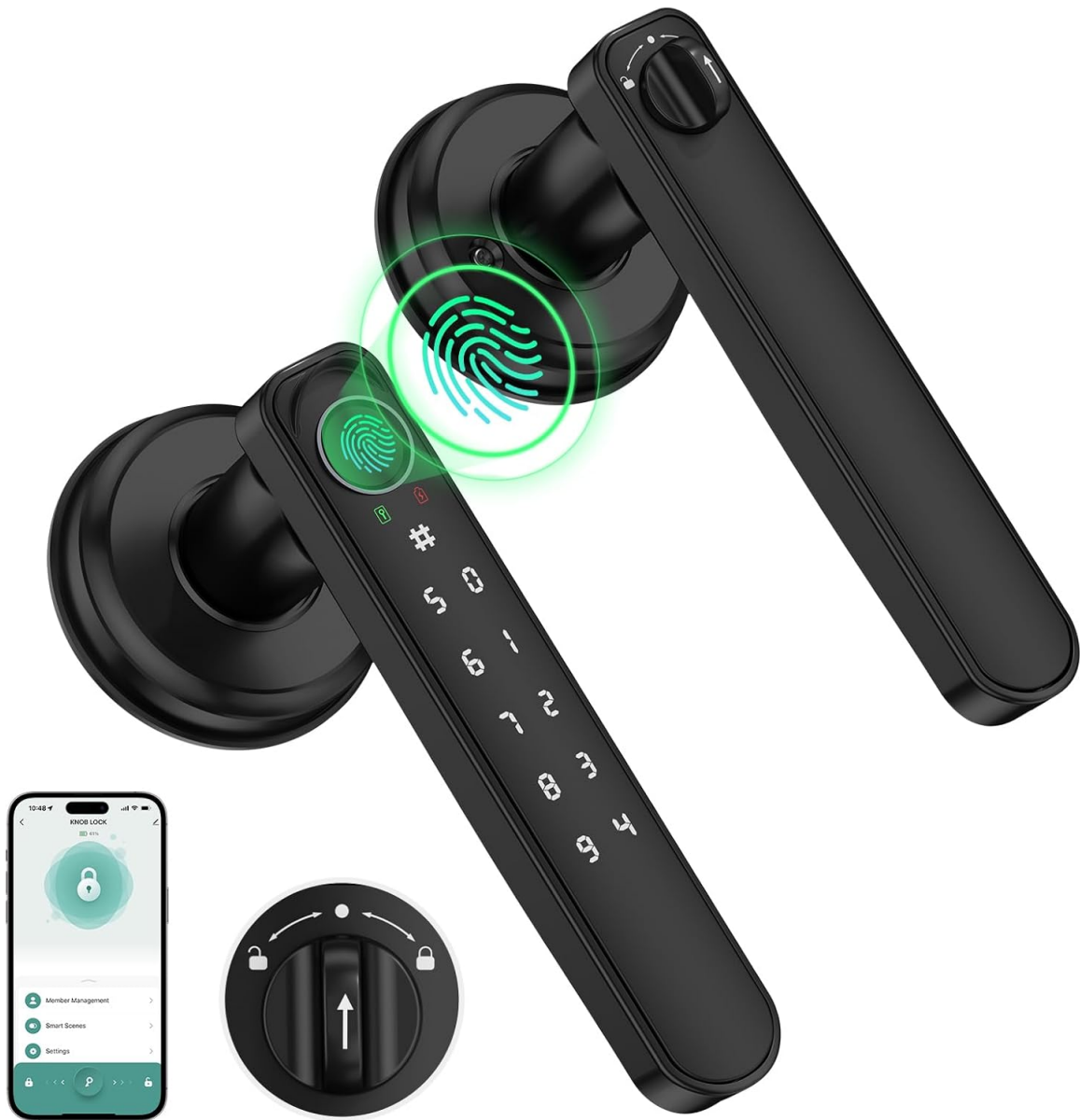
Image: The Sivmn Smart Fingerprint Door Lock L-B203, showcasing its sleek black design with a fingerprint sensor and keypad, alongside a smartphone displaying the companion app interface.