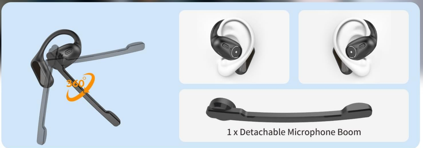
Figure 3.2: Detachable and 360° rotatable boom microphone for flexible use.