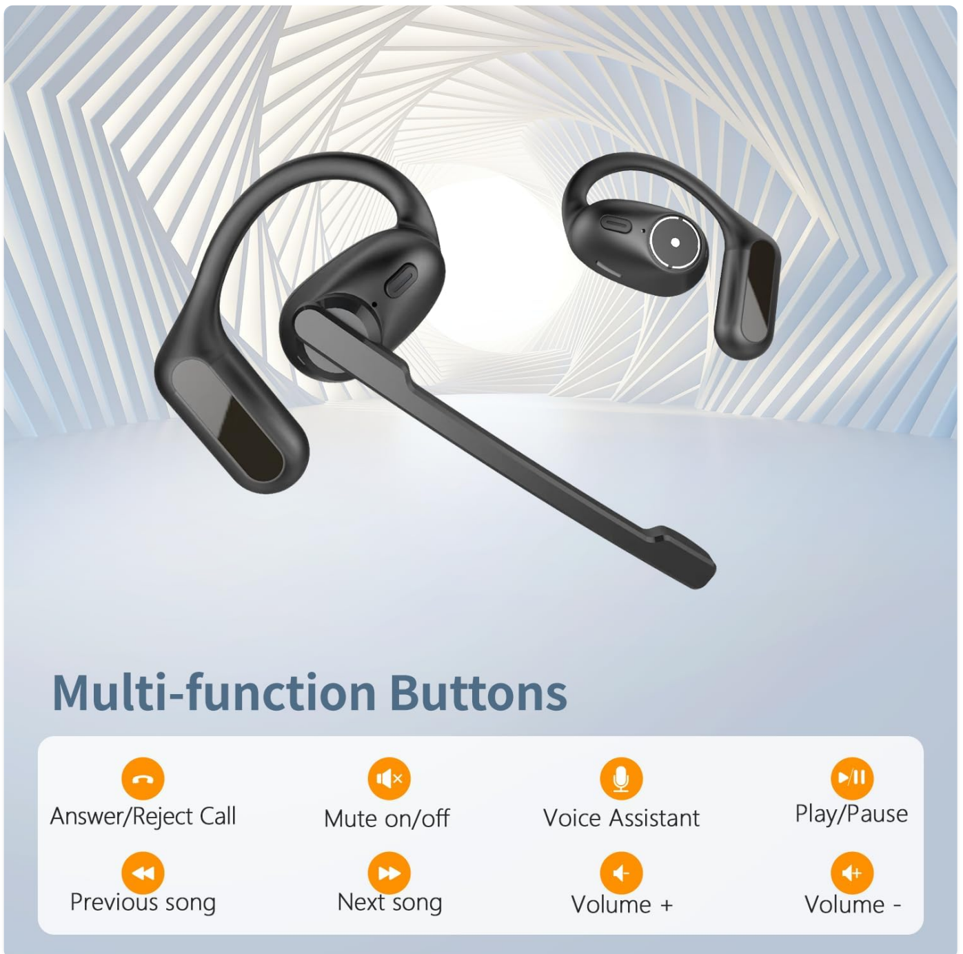
Figure 5.1: Overview of multi-function button controls.