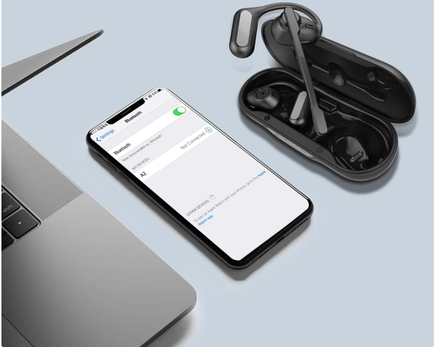
Figure 3.3: Charging case with digital display for battery status.

Bluetooth 5.4 headset allows you to connect two devices at the same time without missing any calls!