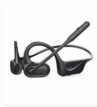
Figure 4.1: Proper wearing of the BANIGIPA A2 headphones.