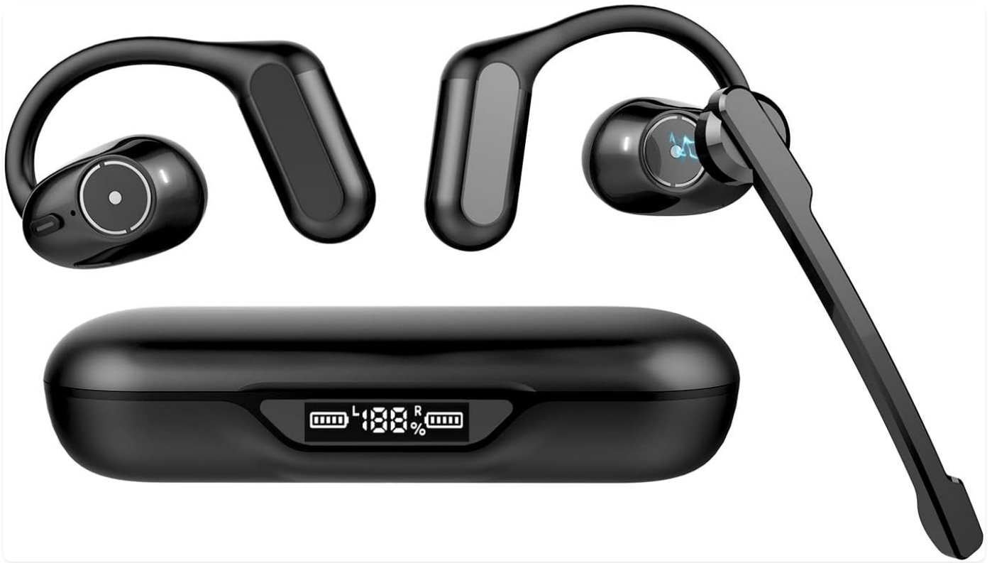
Figure 2.1: BANIGIPA A2 Open Ear Headphones, detachable boom mic, and charging case.