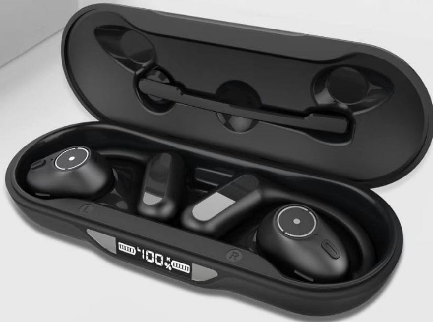
Figure 3.1: The open-ear design provides comfort and situational awareness during activities.