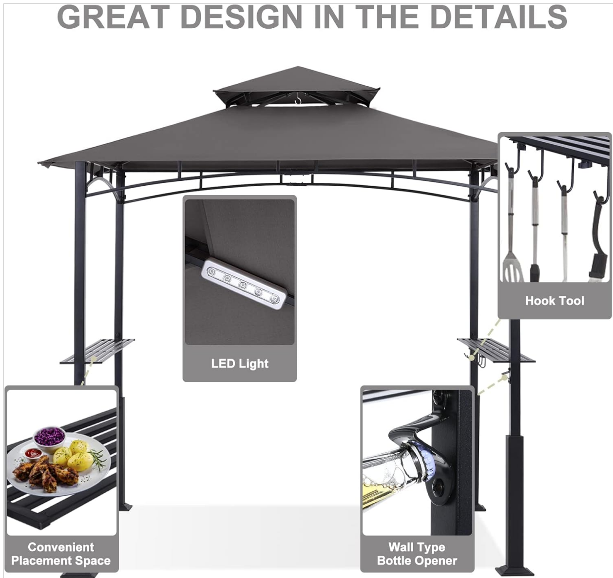
Image: Detailed Features of the Gazebo

A built-in bottle opener is provided on one of the leg posts for convenient access to bottled beverages.