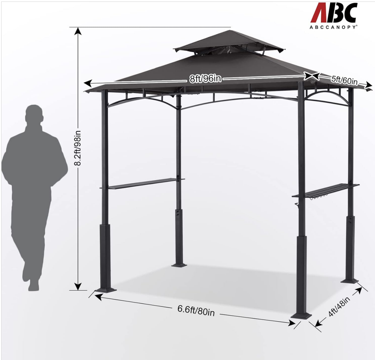
Image: Gazebo Dimensions and Structure

Before beginning assembly, verify that all components listed below are present and undamaged. Refer to the provided diagrams for visual identification of each part.