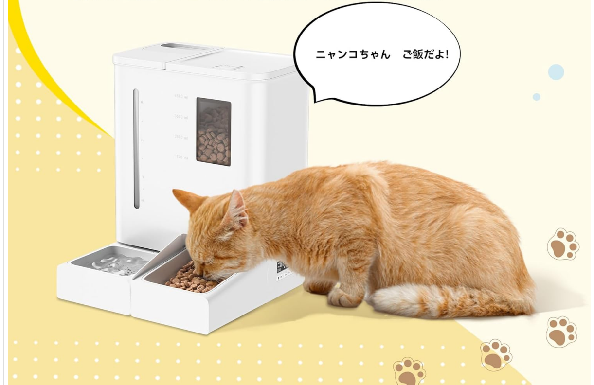
Image 6.2: Voice recording function. This image shows a cat eating from the feeder, with a speech bubble indicating a recorded message, highlighting the feature that allows owners to call their pets for meals.

飼い主さんの声を録音・再生でき、 寂しがり屋のネコちゃんも喜ぶ、うれしい機能です