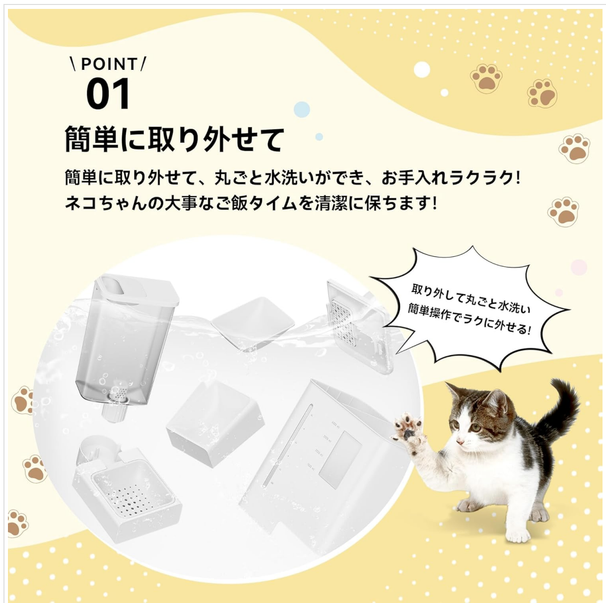
Image 5.1: Disassembled components for easy cleaning. This image shows the food tank, water tank, and bowls separated from the main unit, illustrating the ease of disassembly for maintenance.

Assemble the components as shown in the parts identification diagram. Ensure the food bowl, water bowl, and water tank are correctly seated in their respective positions.