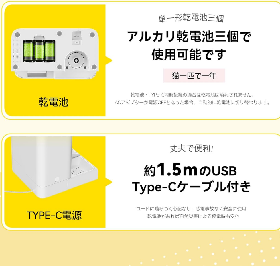
Image 5.2: Two-way power options. This image illustrates the battery compartment for D-cell batteries and the USB Type-C power input, emphasizing reliable operation during power interruptions.