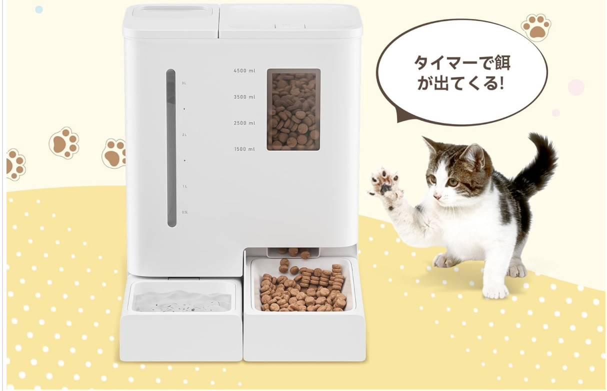
Image 5.3: Large capacity for food and water. This image highlights the 5L food storage and 4L water bottle capacity, ensuring extended feeding and hydration without frequent refills.