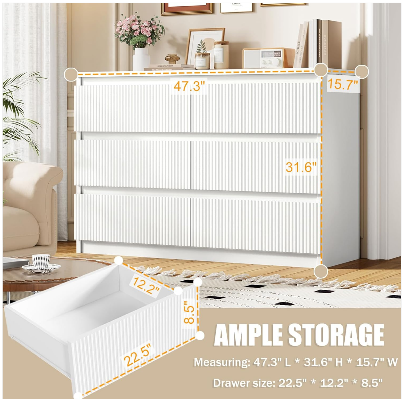
Figure 6: Detailed dimensions of the Jocoevol 6-drawer dresser and its individual drawers.