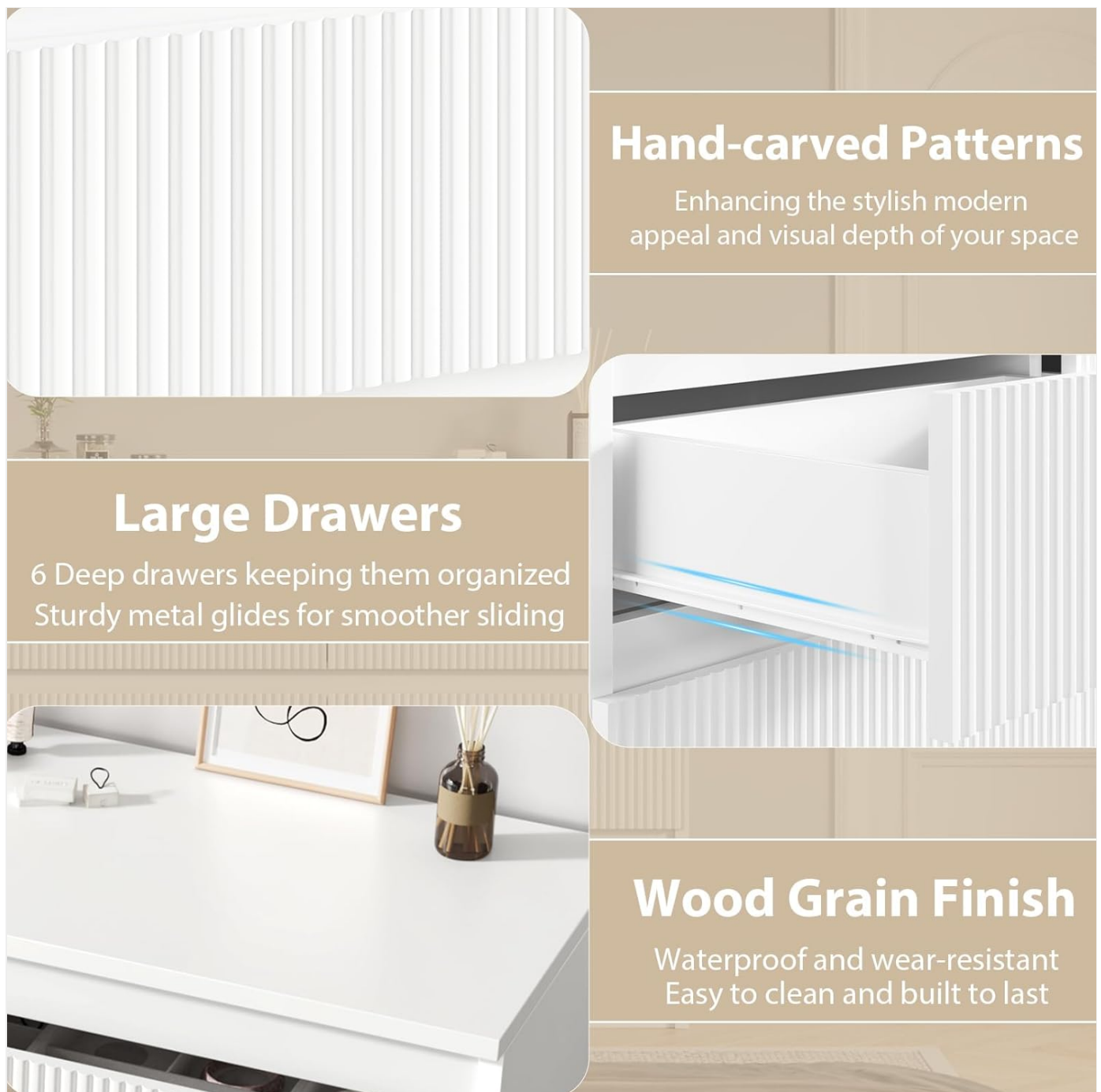
Figure 5: The dresser features a durable wood grain finish that is easy to clean and maintain.