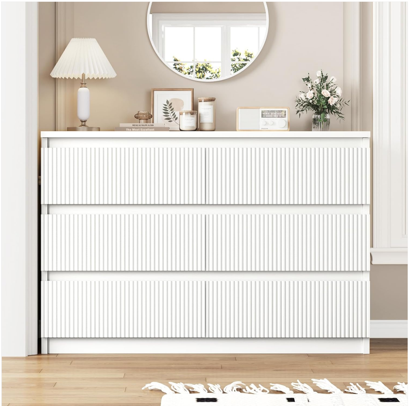
Figure 4: The dresser is suitable for use in hallways or entryways, offering convenient storage.