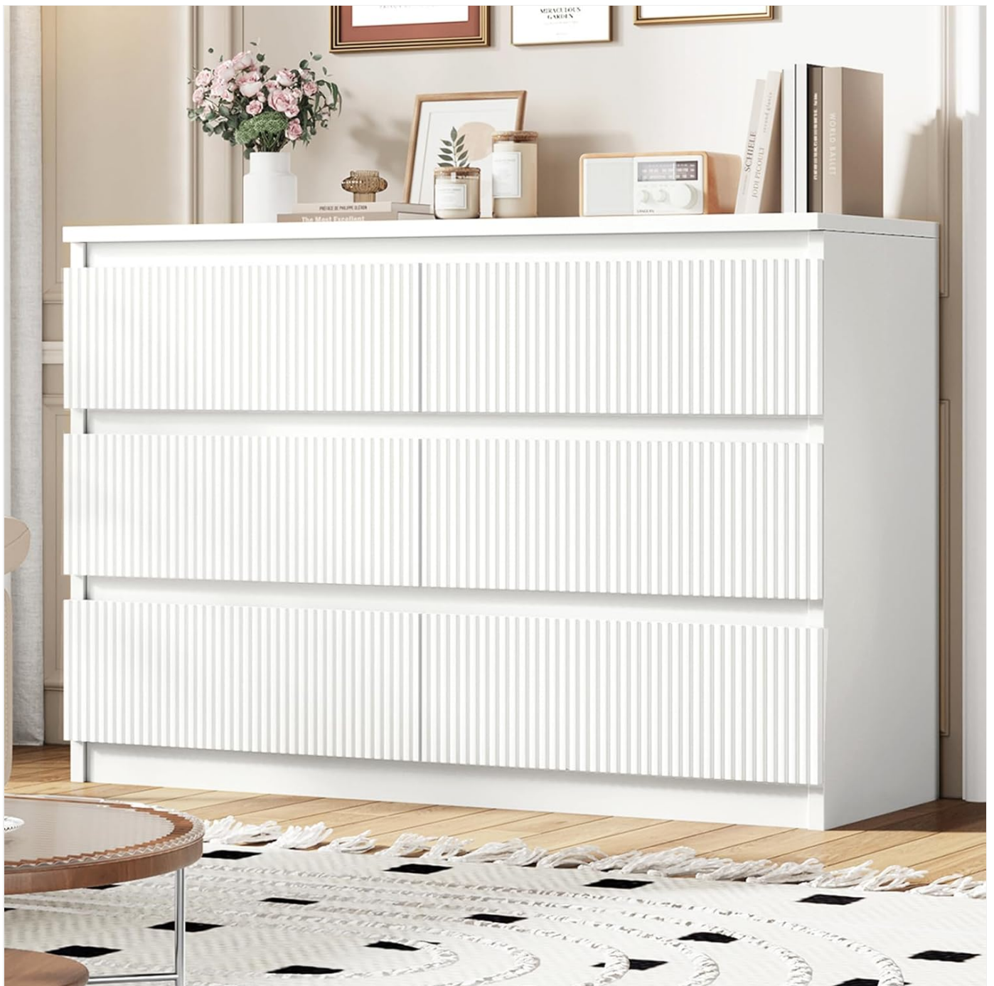
Figure 3: The Jocoevol dresser complements various room decors, providing both storage and a display surface.