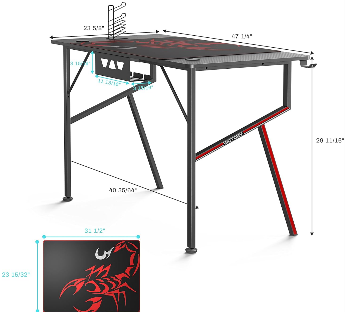
Image 8.1: Detailed dimension diagram of the Captain K47B Gaming Desk, including the desk surface and overall height and width.