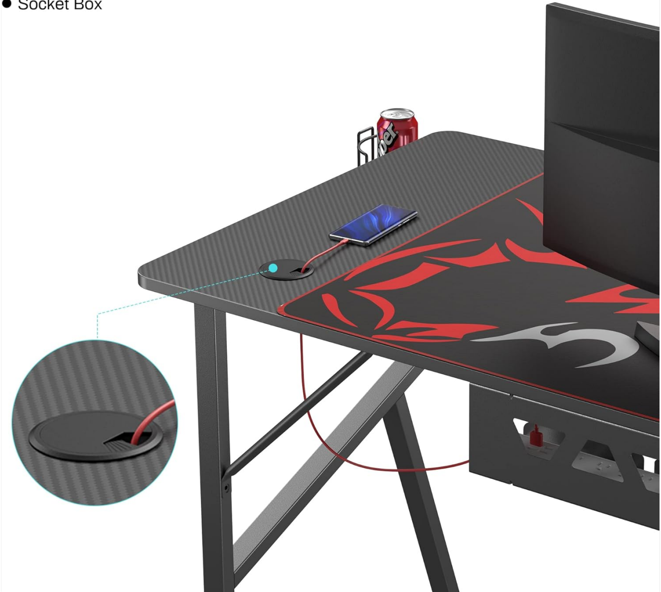
Image 5.2: Illustration of the cable management system, demonstrating the cord grommets and the integrated socket box for organized wiring.