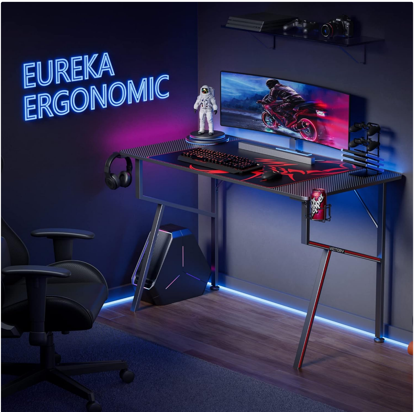
Image 1.1: The EUREKA ERGONOMIC Captain K47B 47-Inch Gaming Desk, showcasing its carbon fiber texture and K-shaped frame in a typical gaming environment.