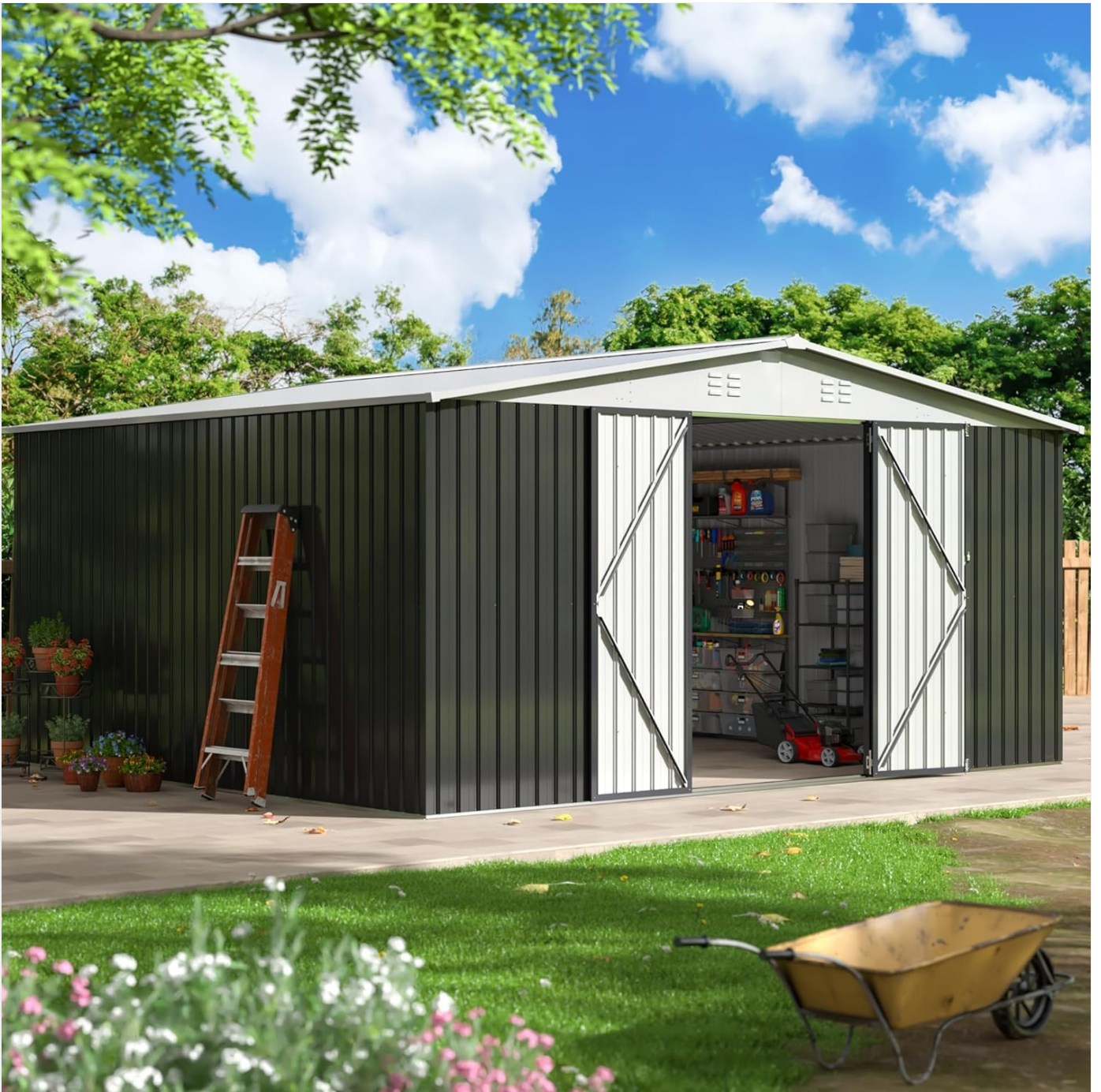
Figure 1: Overview of the VIWAT 12x14 FT Outdoor Storage Shed.