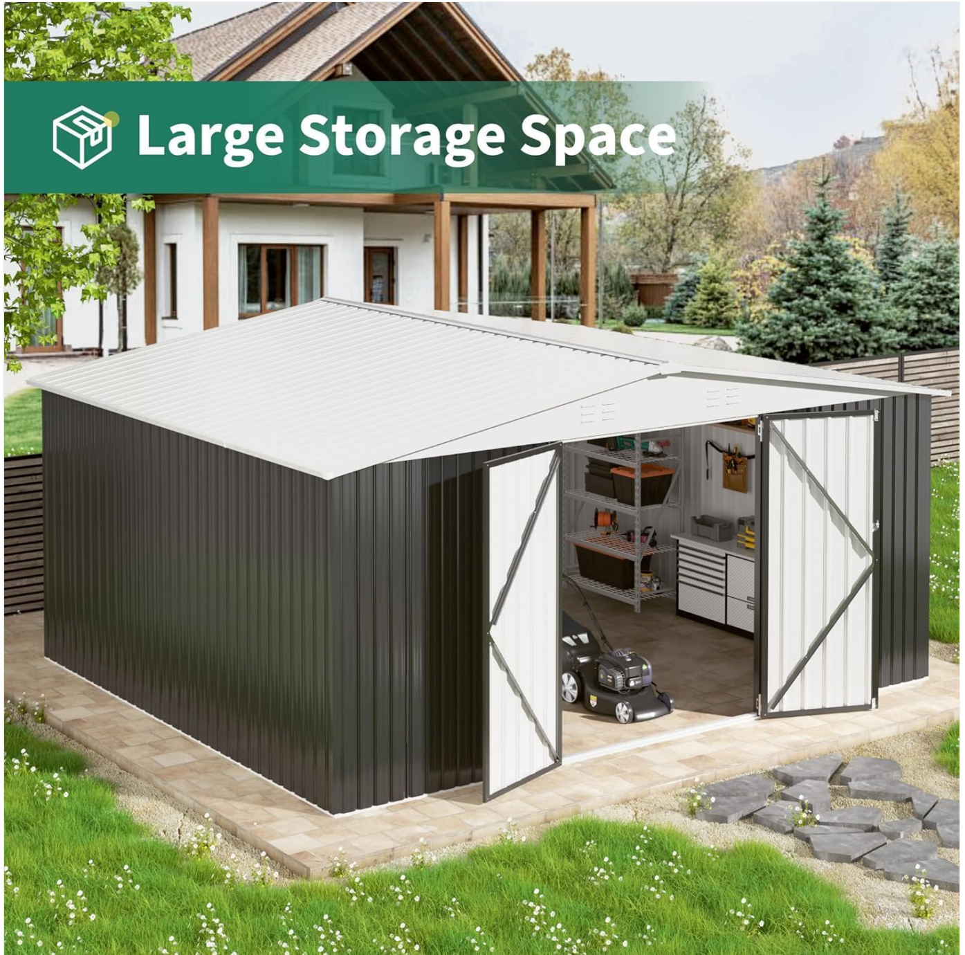
Figure 4: Key functional design elements of the shed, including the secure door lock and air vents.