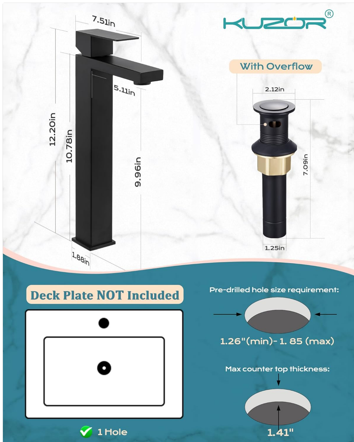
Figure 4: Faucet Dimensions and Sink Hole Requirements