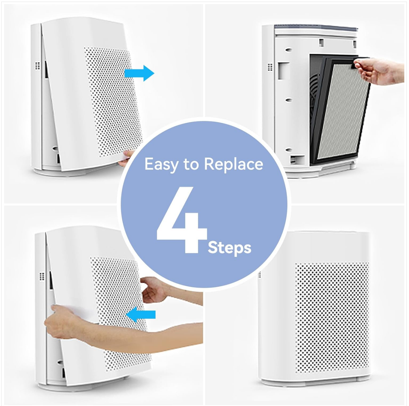
Image: Step-by-step guide for filter replacement.