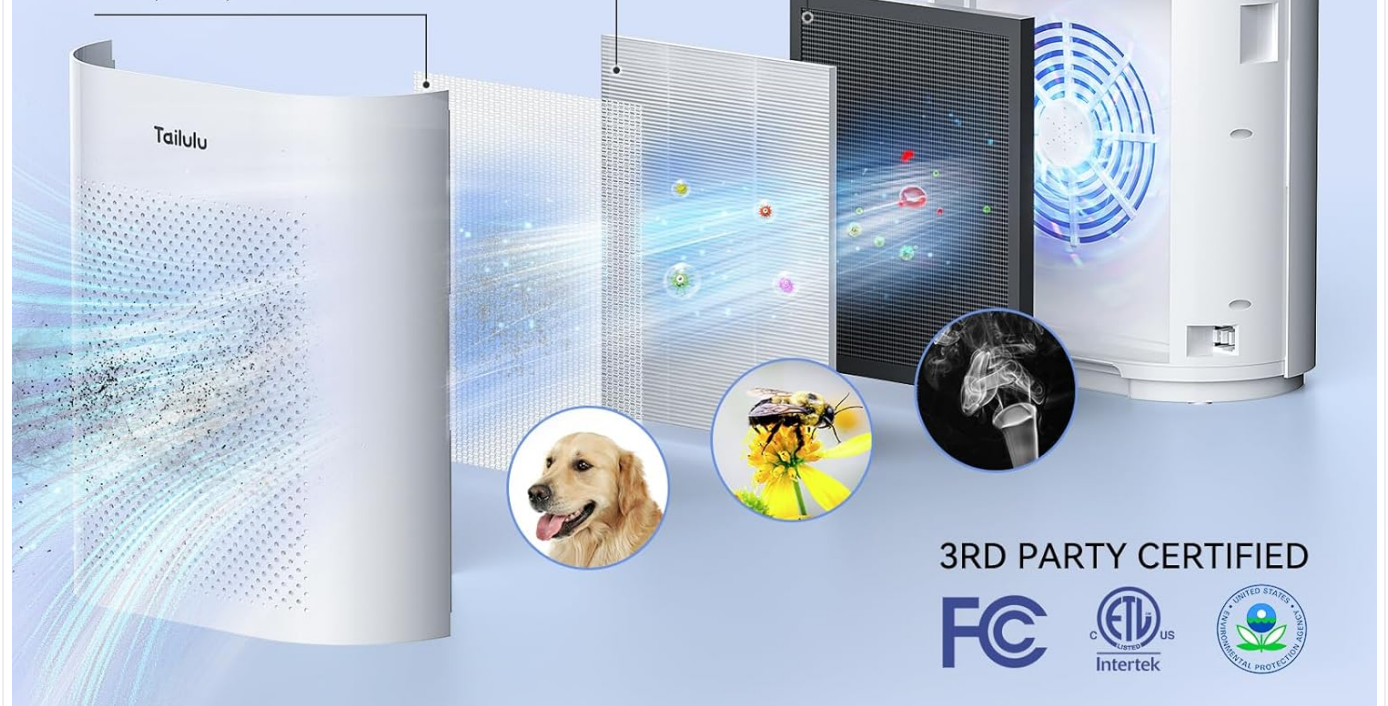
Image: Detailed view of the 3-stage filtration system.