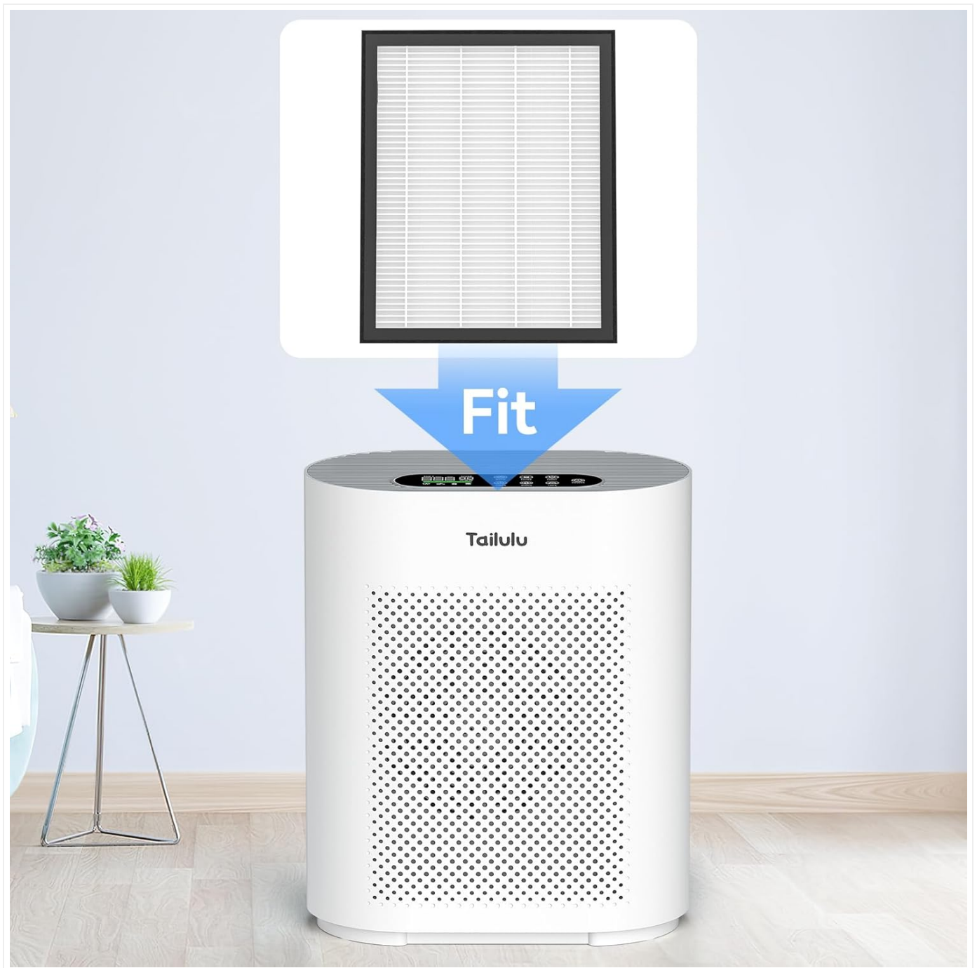
Image: The replacement filter fitting into the air purifier.