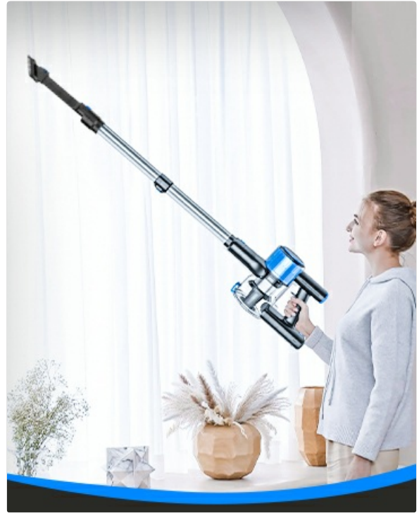
Image: Handheld cleaning and high-reach cleaning configurations.