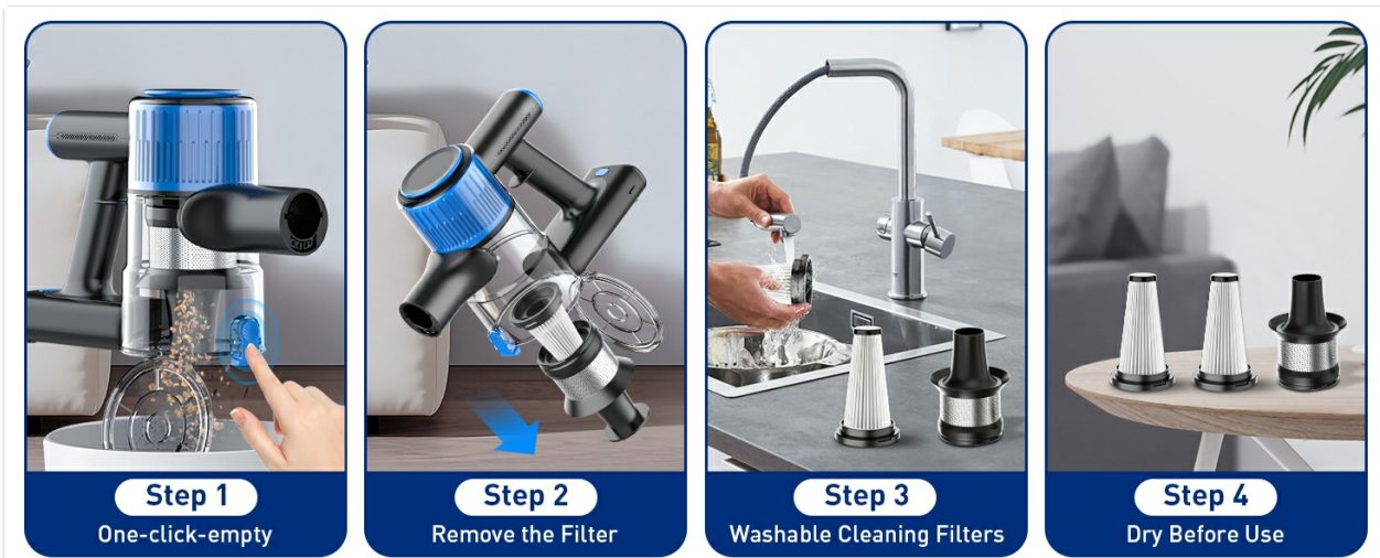
Image: Steps for dust cup emptying and filter cleaning.