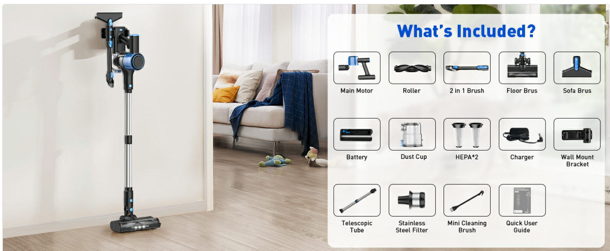
Image: All components included in the SINCHER A27B package.

Carefully unpack your SINCHER A27B Cordless Vacuum Cleaner and ensure all items are present and in good condition. If any items are missing or damaged, please contact customer support.