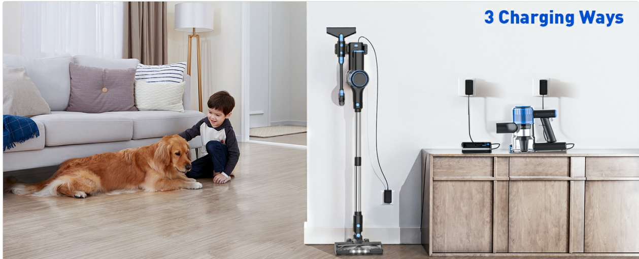
Image: Three charging methods for the SINCHER A27B battery.

Ensure the battery is fully charged before first use. The LED display will show the battery level.