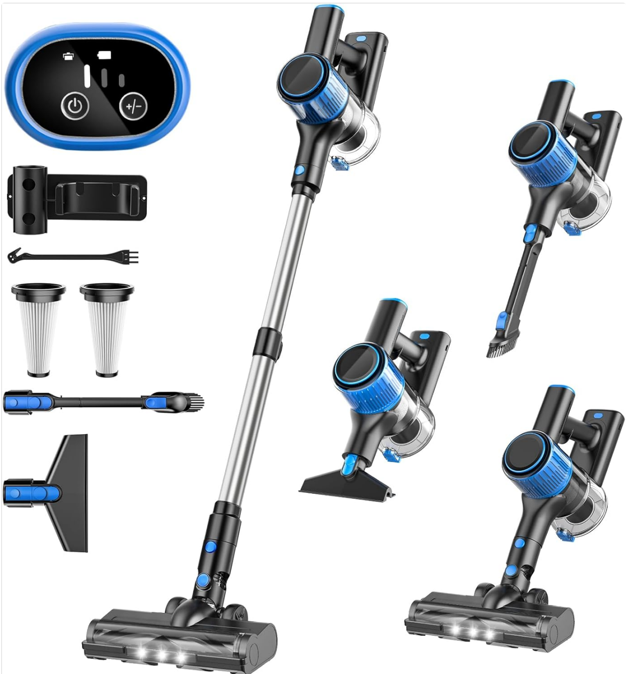
Image: Fully assembled SINCHER A27B Cordless Vacuum Cleaner with accessories.