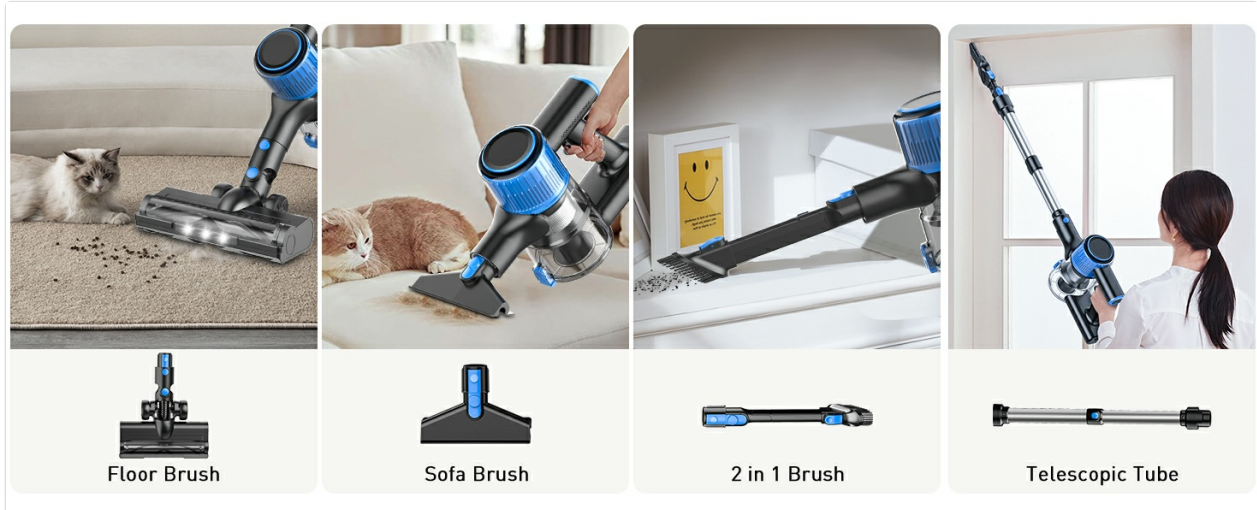
Image: Various cleaning attachments.

The SINCHER A27B comes with various attachments for different cleaning needs: