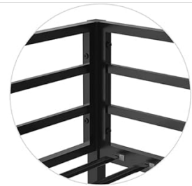
11" Full-Length Guardrail