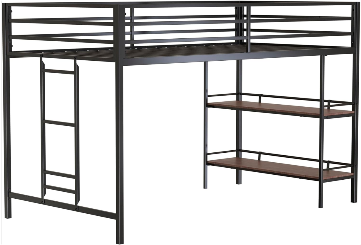
The assembled bed frame without a mattress, illustrating the ladder and integrated shelves.