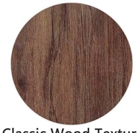
Classic Wood Texture

Detailed view highlighting the 11-inch full-length guardrail, noise-free slat design, non-marring foot pads, and the classic wood texture of the shelves.