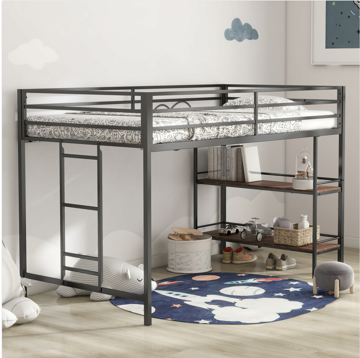
Front view of the Bellemave Twin Size Low Loft Bed with Shelf, showcasing its compact design and integrated shelving.