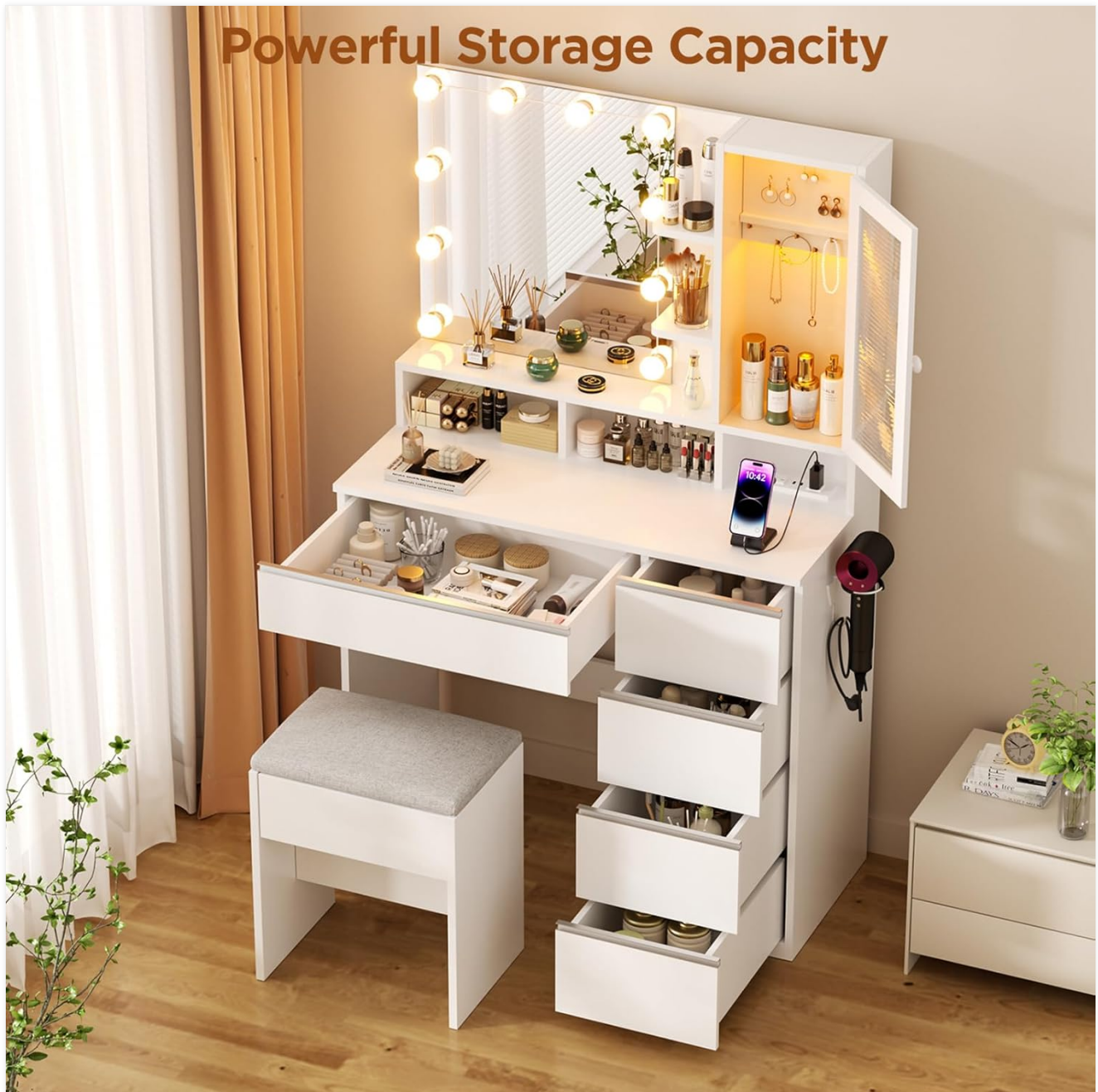
Image 8: Overhead view of the vanity desk with multiple drawers and storage compartments open, demonstrating its storage capacity for various items.