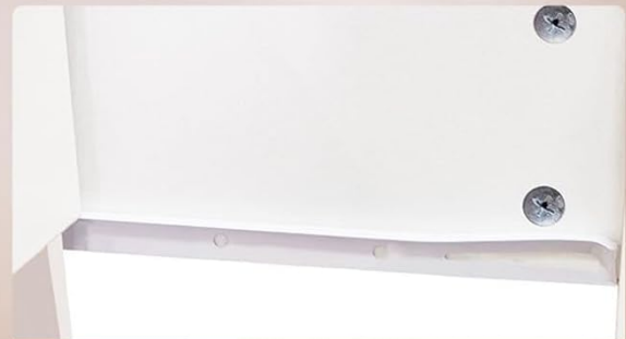
Drawers with Sliding Rails