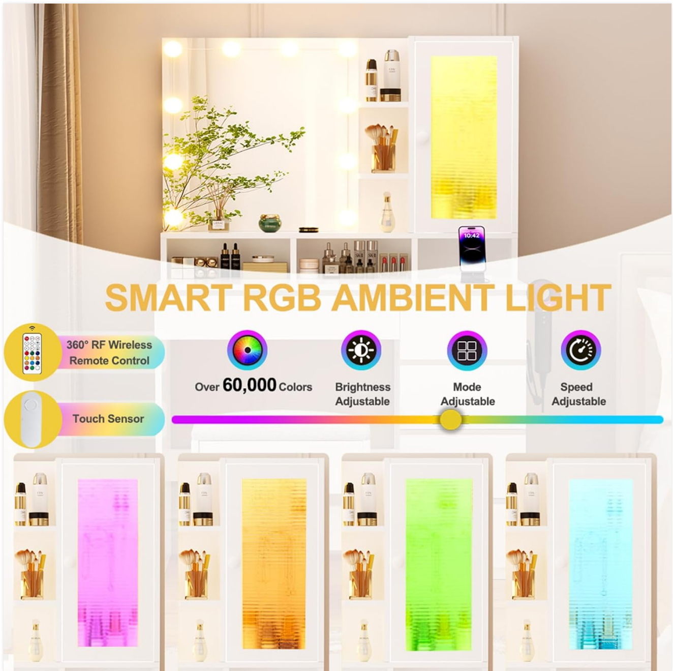
Image 5: Diagram detailing the features of the smart RGB ambient light, including 360° RF wireless remote control, touch sensor, over 60,000 colors, brightness adjustment, mode adjustment, and speed adjustment.