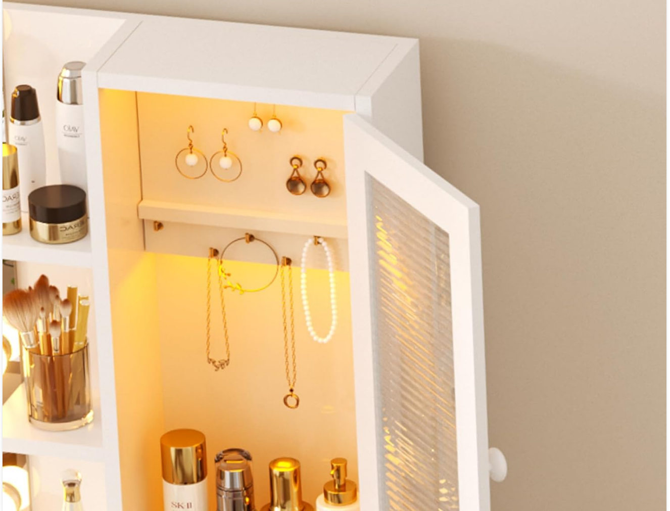
Image 7: Close-up view of the vanity cabinet interior, showing six metal jewelry hooks designed for organizing earrings and necklaces.