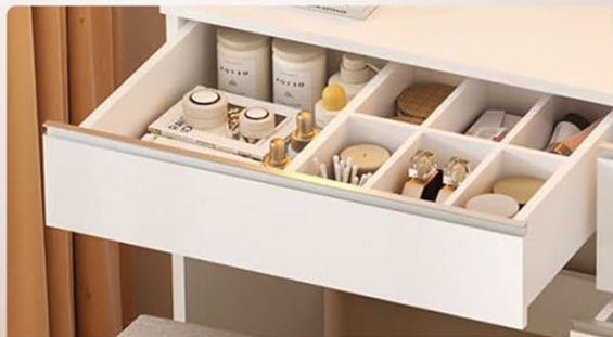
Large Drawer with Partition Board