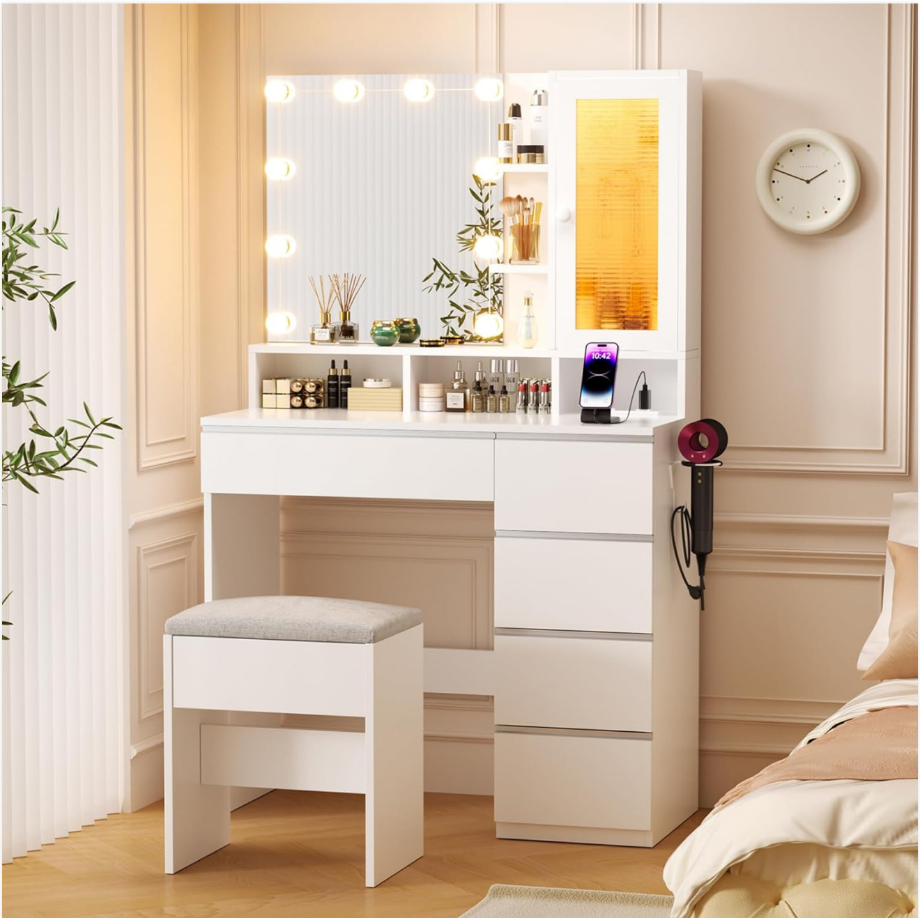
Image 1: Complete ERLEJIA Vanity Desk setup, showing the desk, mirror with lights, RGB cabinet, power outlet, and stool.