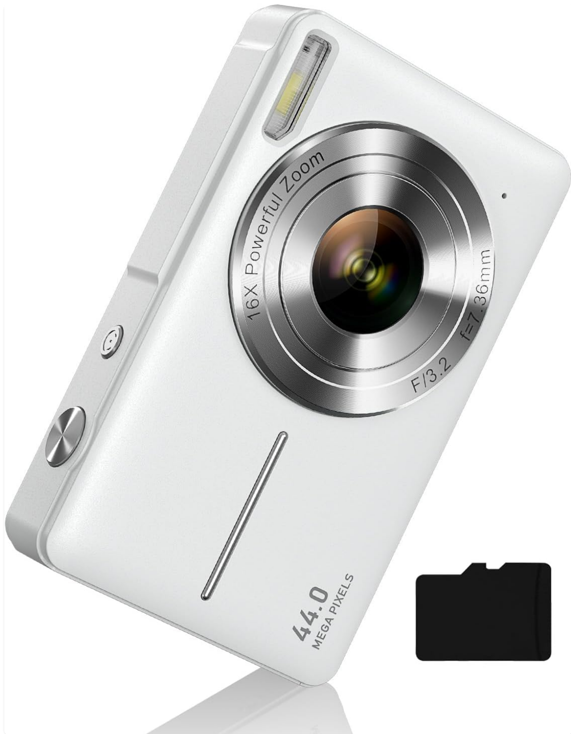
Figure 1: Front view of the Camkory Digital Camera Model DC403.