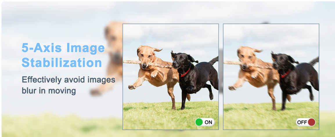
Figure 7: Using self-timer, continuous shooting, and anti-shake.

Access self-timer options (2s, 5s, 10s) and continuous shooting mode via the camera's menu for versatile photo capture.