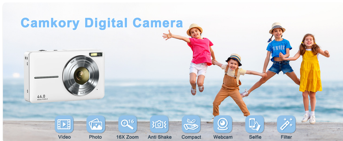
Figure 5: Capturing high-quality photos with the camera.