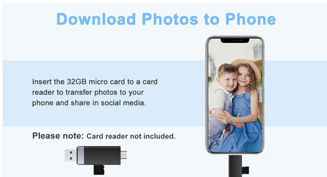
Figure 10: Transferring photos to a phone using an external card reader.

To transfer photos to your phone, remove the 32GB micro SD card from the camera and insert it into a compatible card reader (not included). Connect the card reader to your phone to access and share your media.