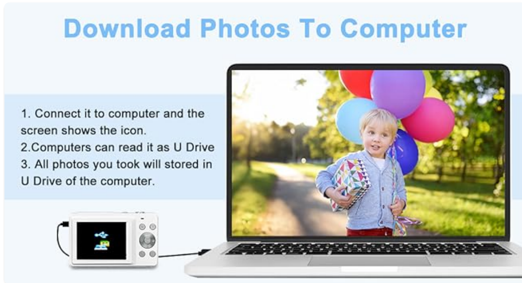
Figure 9: Steps to download photos to a computer.