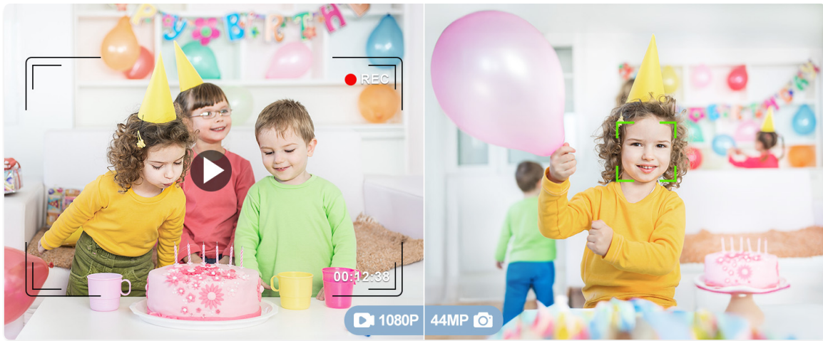
Figure 6: Applying creative filters to photos.