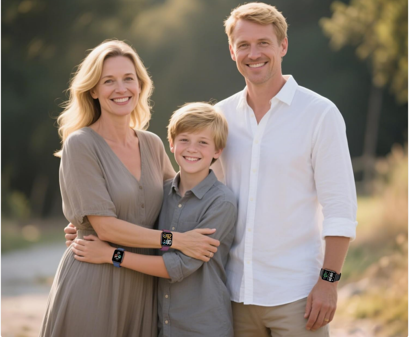
Image: A family wearing EURANS Smart Watches, emphasizing the product's key feature of not requiring a smartphone or app for operation.