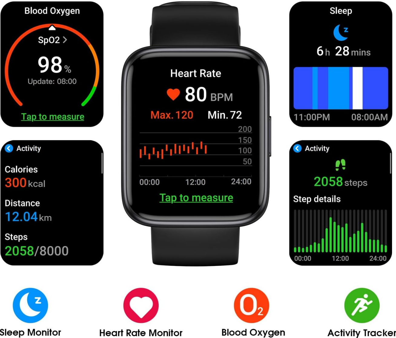
Image: The EURANS Smart Watch screen showing various health metrics including Blood Oxygen (SpO2), Heart Rate (BPM), Sleep duration and patterns, Calories, Distance, and Steps.