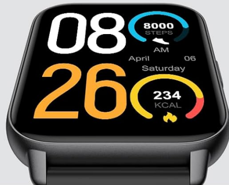
Image: A detailed view of the EURANS Smart Watch screen, emphasizing its large, clear display and high contrast for readability in various conditions.