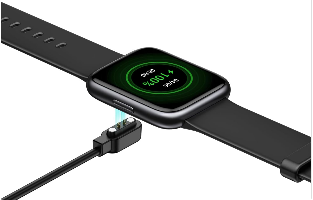
Image: The EURANS Smart Watch being charged via its magnetic charging cable, displaying a 100% charge indicator.