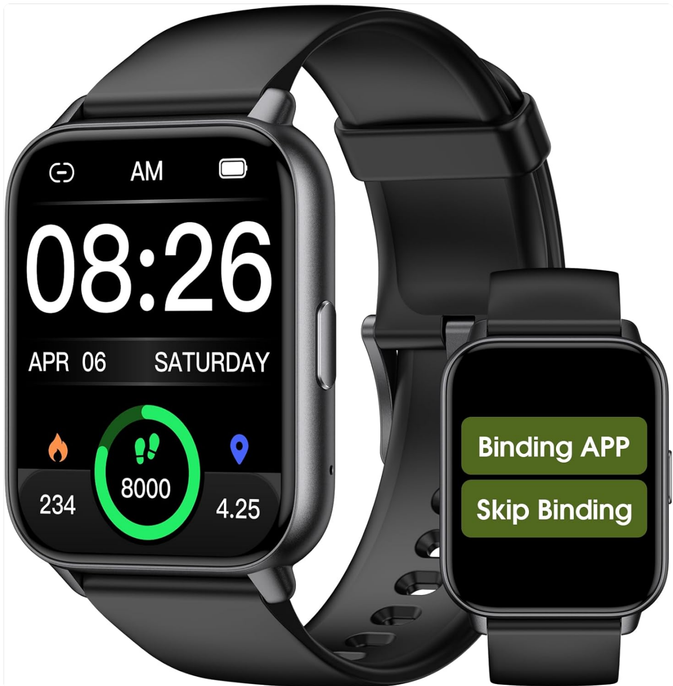
Image: The EURANS Smart Watch in black, showing the main display with time, date, and activity metrics. A smaller inset image shows the initial setup screen with "Binding APP" and "Skip Binding" options.