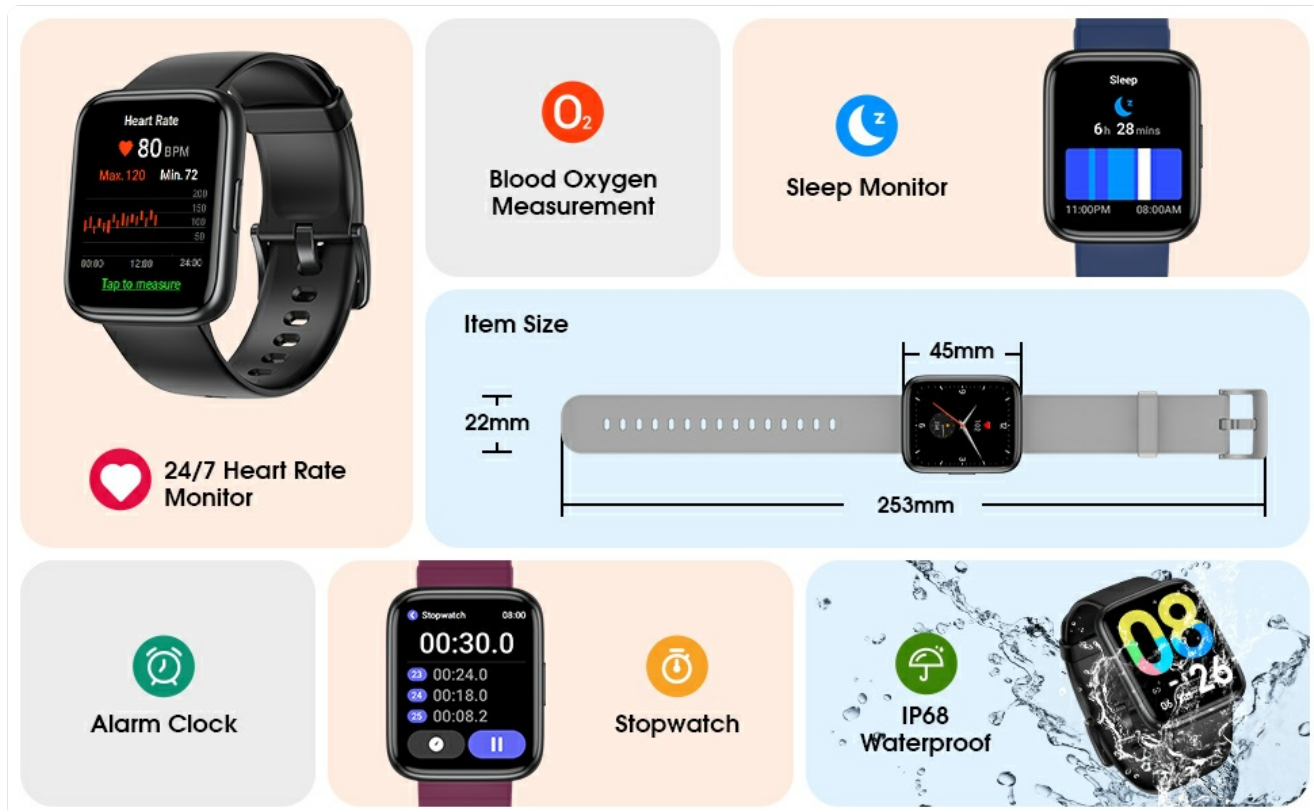
Image: The EURANS Smart Watch screen showing the time and date with large, bright fonts, indicating its 1.8-inch AMOLED display and readability in sunlight.