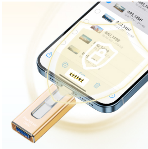
Image: An icon symbolizing encryption protection, indicating the ability to secure your files with a password.