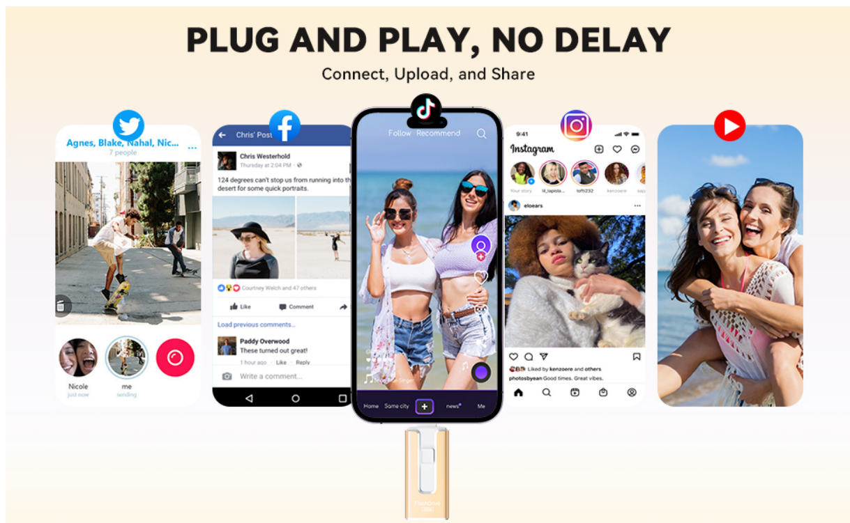
Image: A visual representation of the flash drive's plug-and-play functionality, enabling users to connect, upload, and share content across various platforms.

Easily share your stored photos, videos, and files with friends and family on social media platforms with just one click through the app.