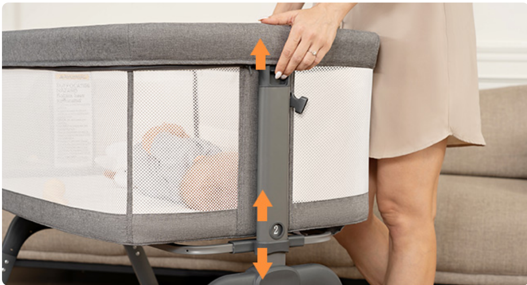
Image: Breathable full-mesh design for safety and visibility.