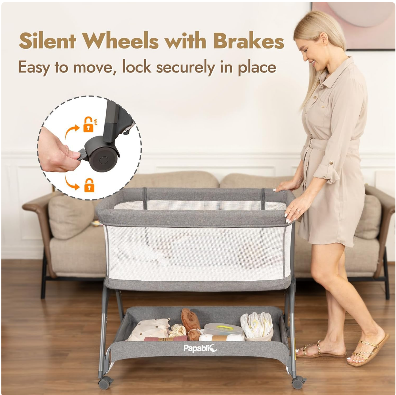
Image: Silent wheels with brakes for easy movement and secure locking.