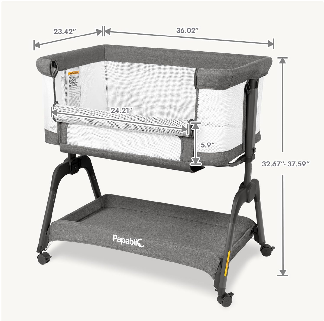
Image: Detailed product dimensions.