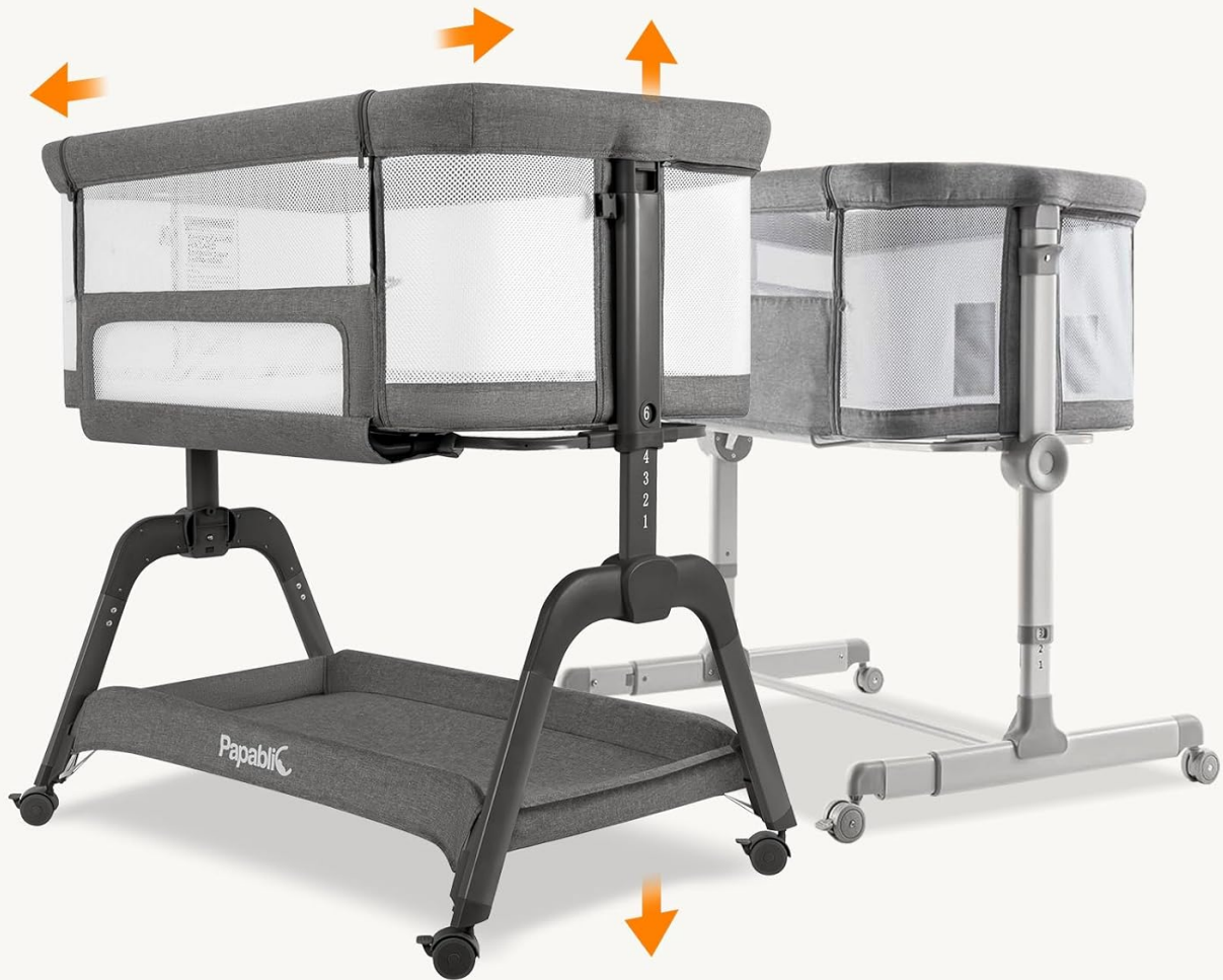
Image: 6-level height adjustment for perfect fit with any bed.