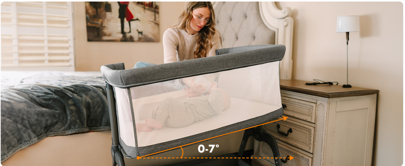
Image: Bassinet with anti-reflux incline feature.