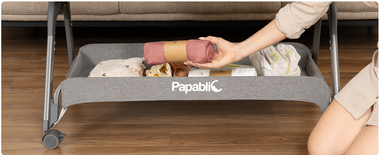
Image: Easy-reach storage basket for baby essentials.