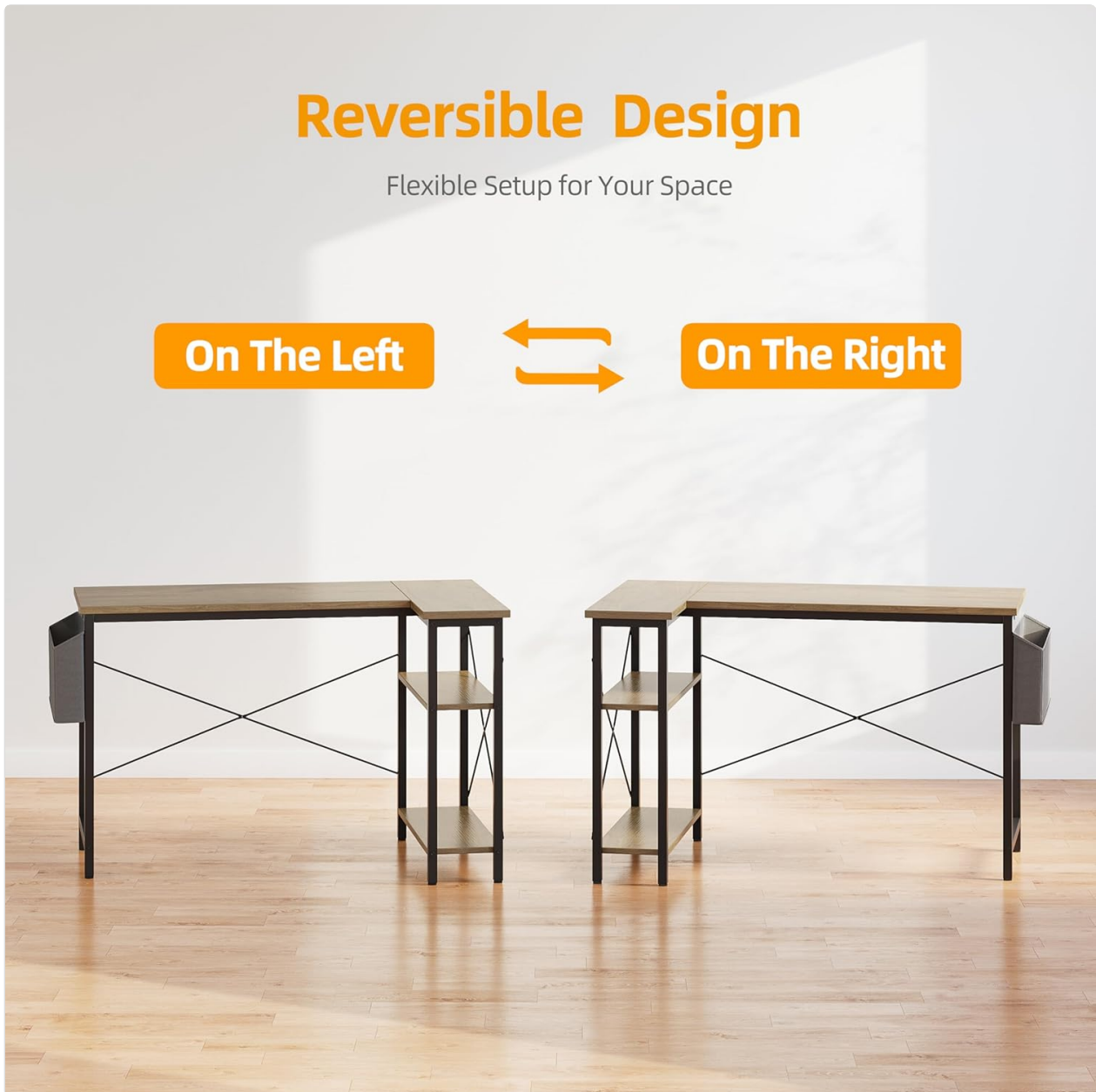
Figure 2: Reversible design of the desk, allowing left or right shelf placement.

The storage shelf unit can be installed on either the left or right side of the desk to best suit your room layout and personal preference. This flexibility allows for optimal space utilization.