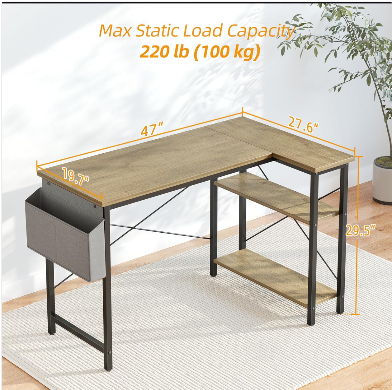
Figure 7: Key dimensions and load capacity of the desk.