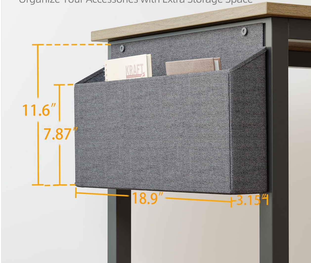
Figure 4: Dimensions of the integrated storage bag.

Organize Your Accessories with Extra Storage Space