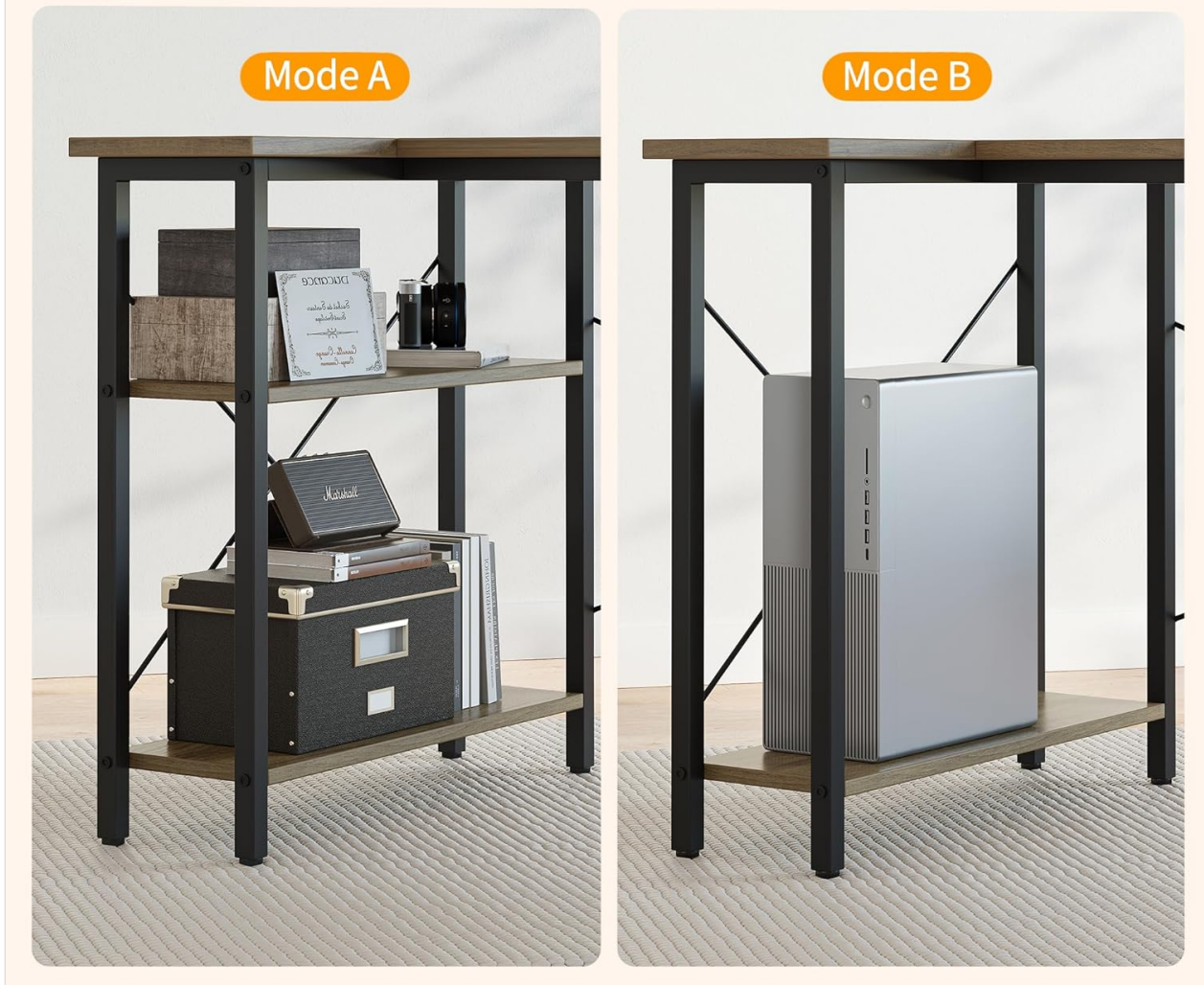
Figure 5: Shelf configurations for storage or PC tower placement.

Customize Your Space for Storage or Tower PC Setup