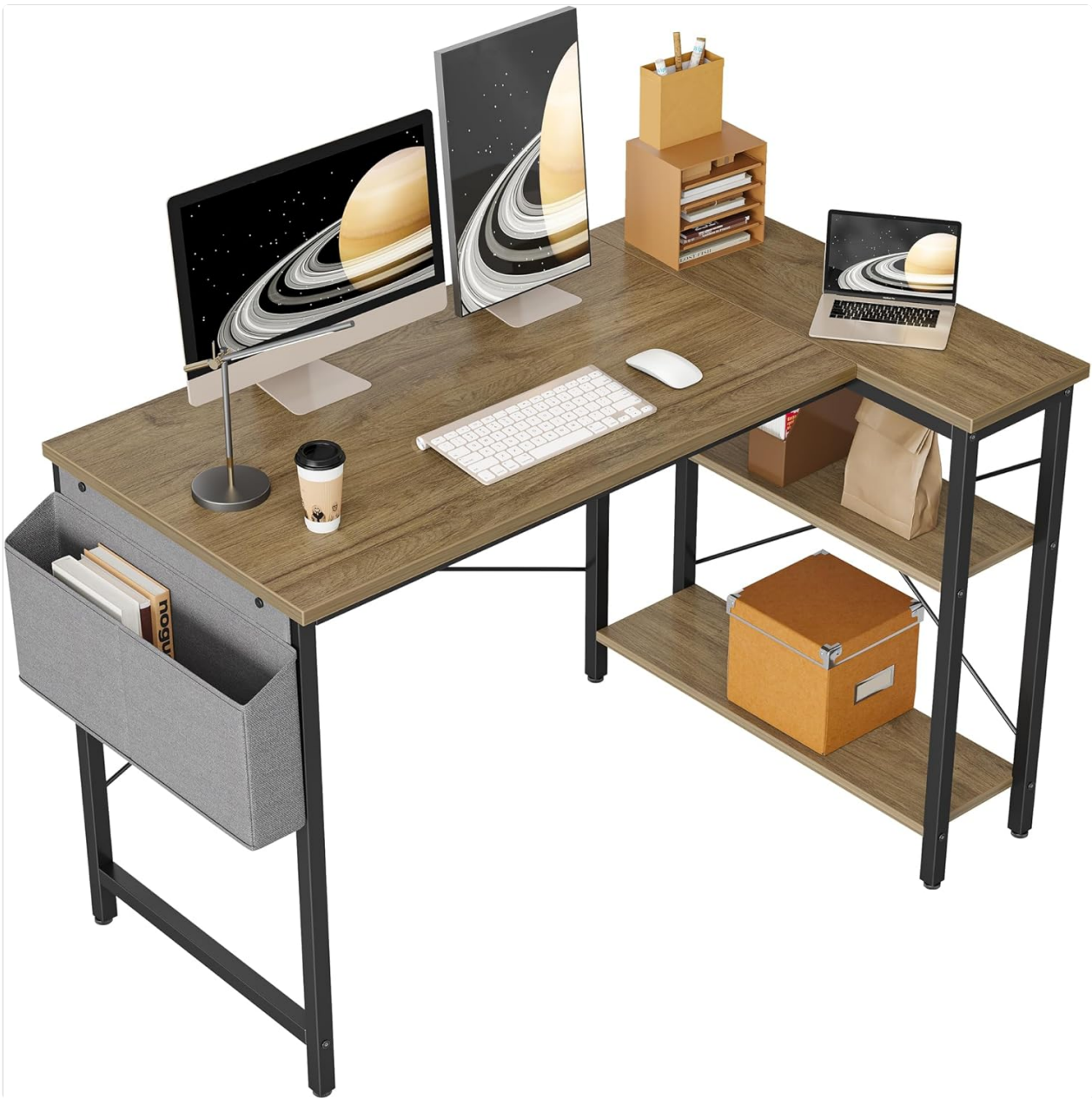
Figure 1: Overview of the BEXEVUE L-Shaped Desk.