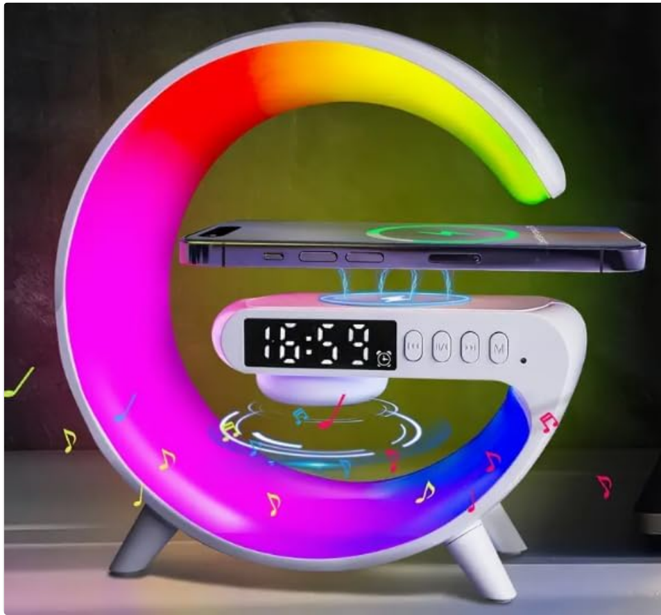
Image: The Smart Light Sound Machine emitting colorful lights and musical notes, illustrating its audio capabilities.