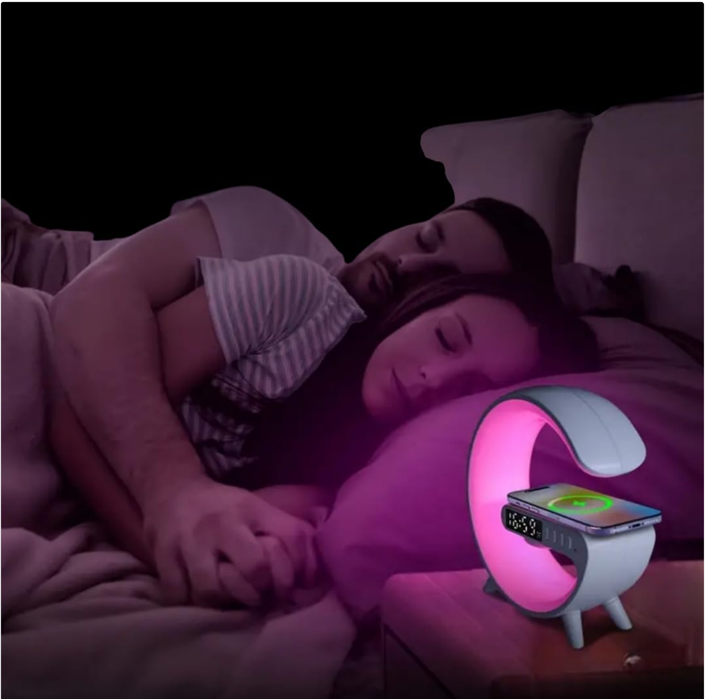
Image: The Smart Light Sound Machine providing ambient light in a bedroom setting, demonstrating its use as a sleep aid.