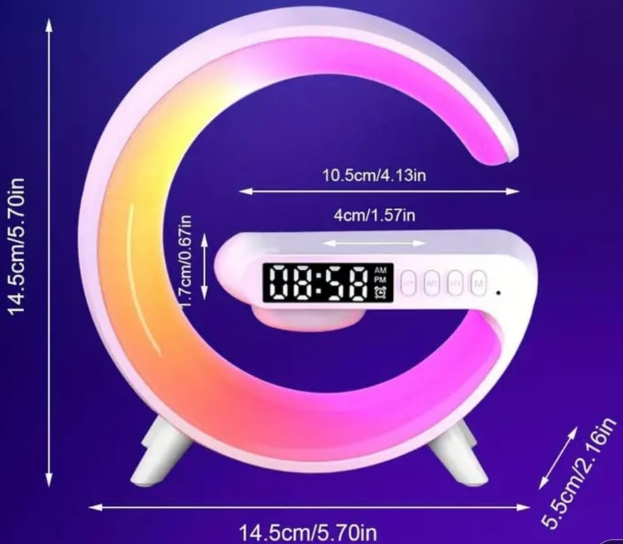
Image: Product Size diagram, illustrating the physical dimensions of the Smart Light Sound Machine.