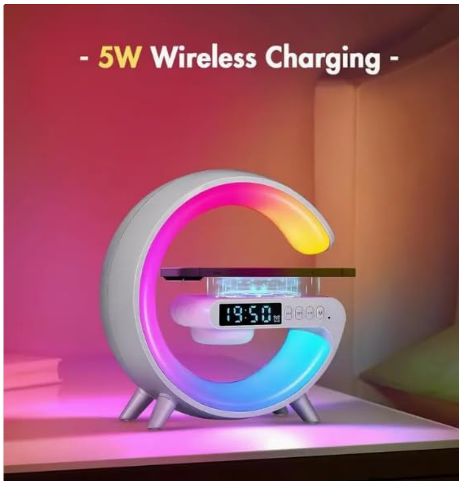
Image: The Smart Light Sound Machine with a smartphone on its wireless charging pad. Note: While the image indicates 5W, the product specifications state 10W wireless charging capability.