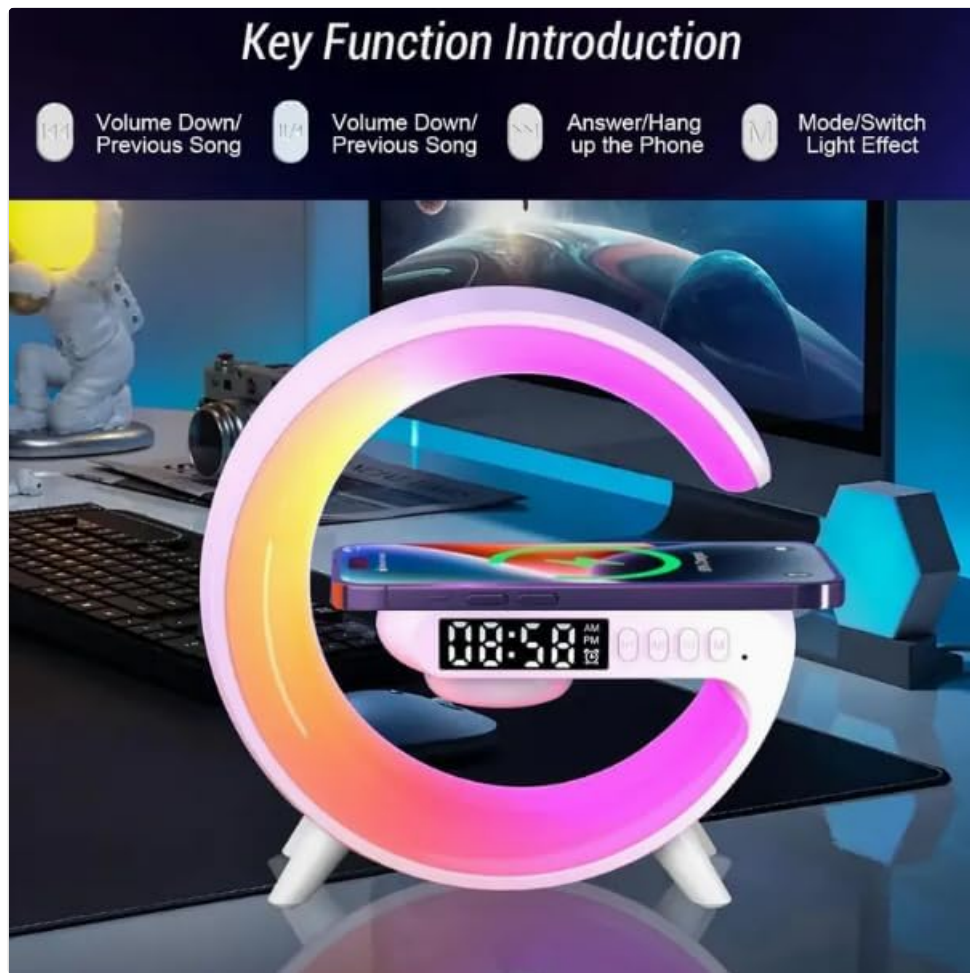
Image: Key Function Introduction, showing the control buttons on the device's base for volume, call management, and light effects.