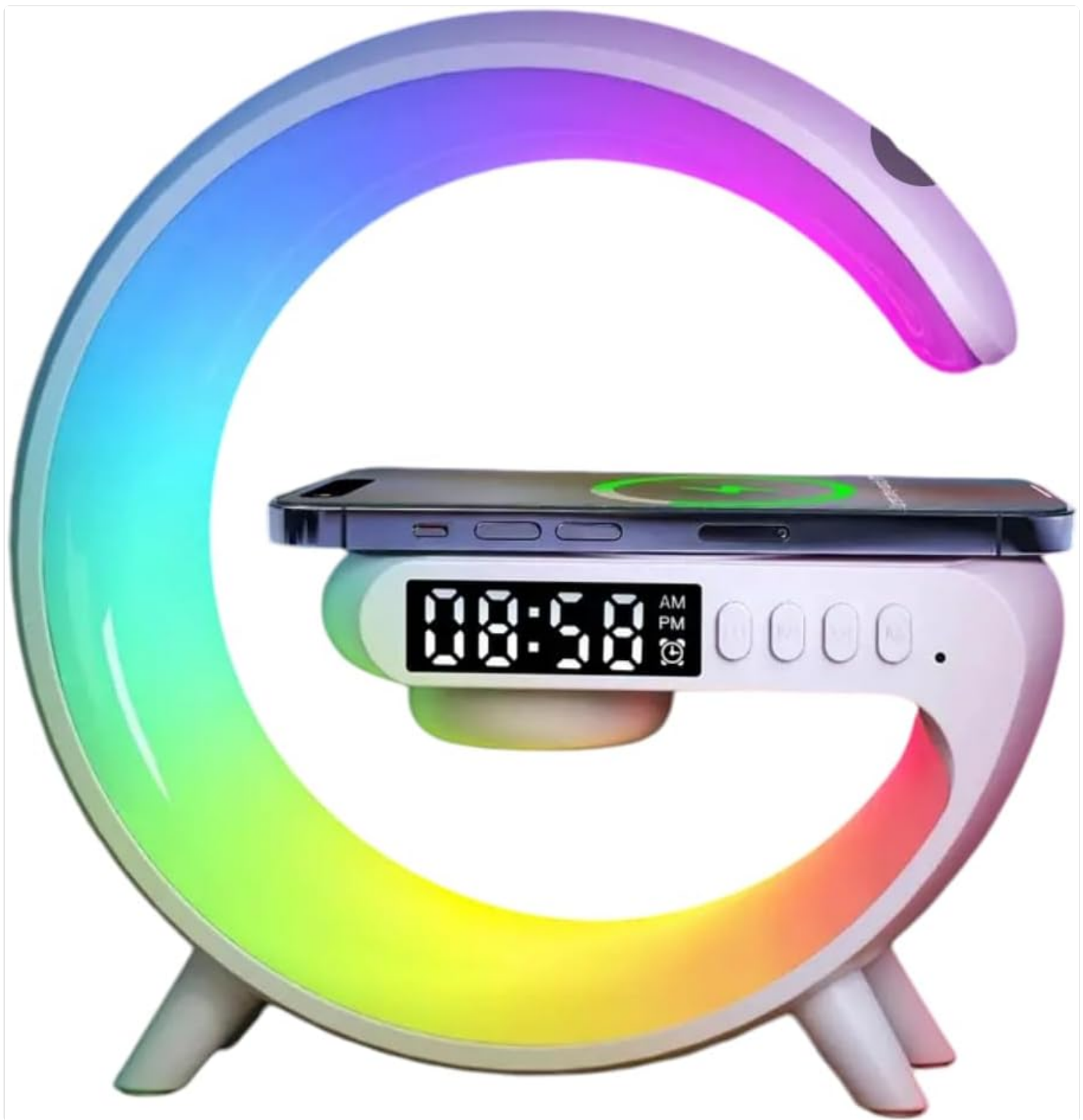
Image: The Generic G63 Smart Light Sound Machine, showcasing its design with integrated clock, wireless charging pad, and vibrant LED lighting.