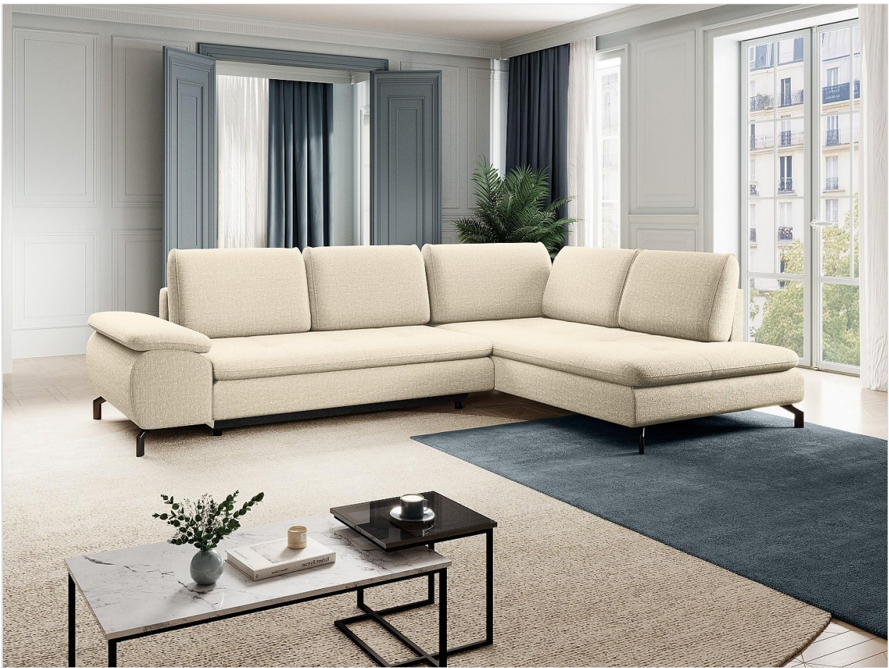
Image 1.2: The Archibald sofa integrated into a living room environment.