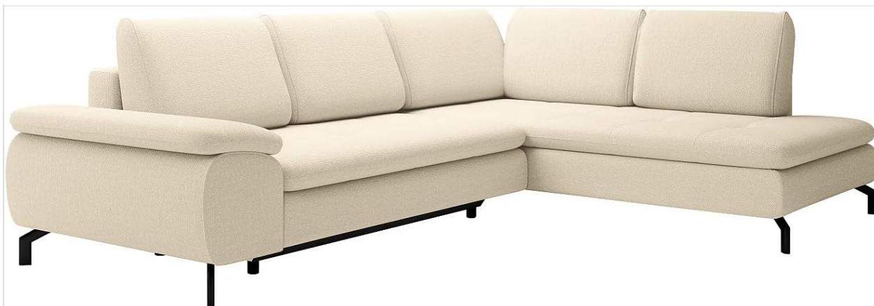
Image 1.1: The Archibald convertible corner sofa in its standard configuration.

The Vente-unique Archibald is a versatile right-hand convertible corner sofa designed for comfort and functionality. It features a textured beige fabric upholstery and a sturdy wooden frame. This sofa can be easily converted into a bed, offering a practical solution for accommodating guests or providing additional sleeping space.