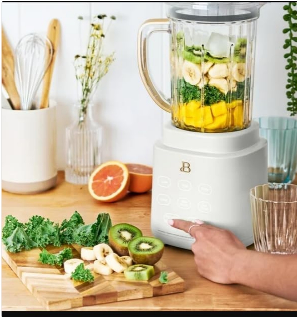
Image 2: A hand is shown pressing one of the illuminated touch controls on the blender's motor base. The 50oz jar is filled with various fruits and vegetables, ready for blending.