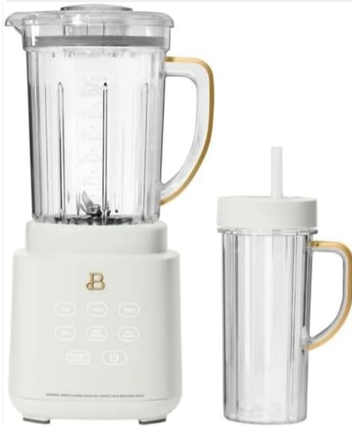
Image 1: The Beautiful PowerExact Blender System, showing the motor base, 50oz blending jar with lid, and the 20oz single-serve cup with its lid. All components are in a white icing color with gold accents.