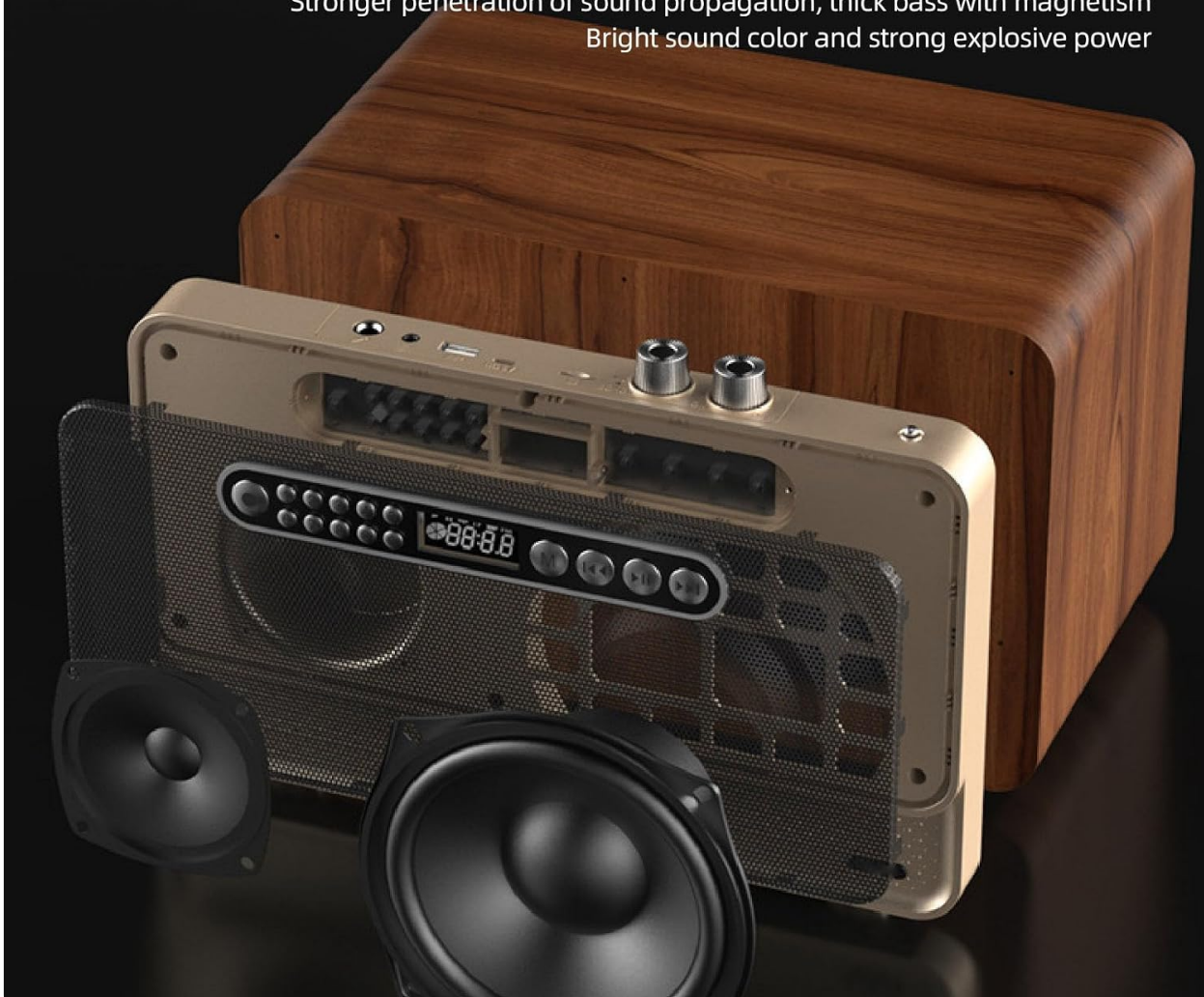
Image: An exploded view of the Bewinner Portable Bluetooth Speaker, revealing its internal dual speakers and independent bass guide holes, illustrating the design for enhanced sound quality and powerful bass.

Dual speakers with independent bass guide holes for efficient sound quality. Stronger penetration of sound propagation, thick bass with magnetism Bright sound color and strong explosive power