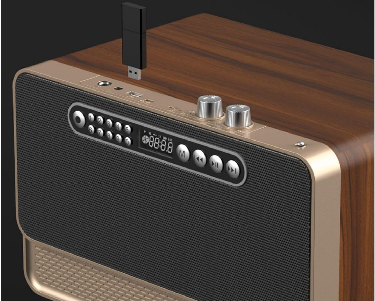
Image: A close-up of the Bewinner Portable Bluetooth Speaker with a USB flash drive inserted into its USB port, illustrating USB disk playback capability.

Support the upper limit of 32GB memory card or U disk, plug and play, you can switch up and down the song at will, support play pause