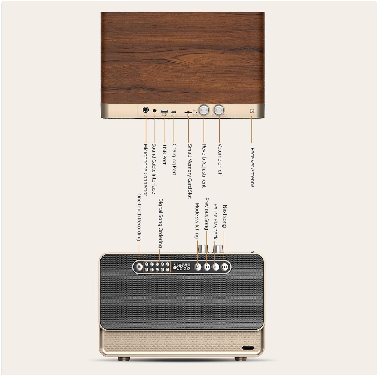
Image: Detailed diagram showing the various ports and control buttons on the Bewinner Portable Bluetooth Speaker, including the volume knob, charging port, USB port, small memory card slot, sound cable interface, microphone connector, and receiver antenna.

Familiarize yourself with the speaker's ports and controls: