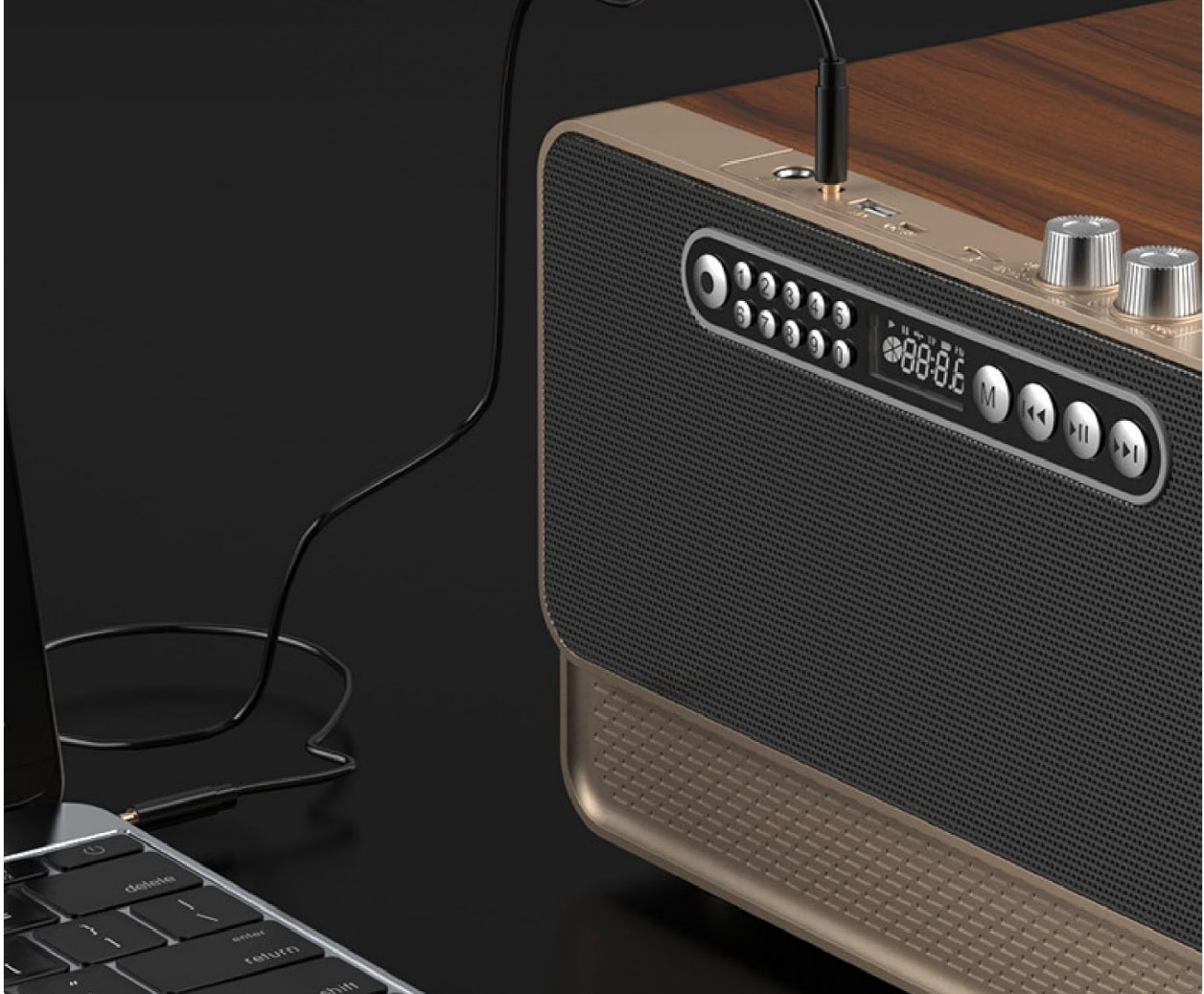
Image: The Bewinner Portable Bluetooth Speaker connected to a laptop using the 3.5mm AUX sound cable, demonstrating wired audio playback.

Make music easier, connect the USB power cable and 3.5mm sound cable to your computer and enjoy listening to music.