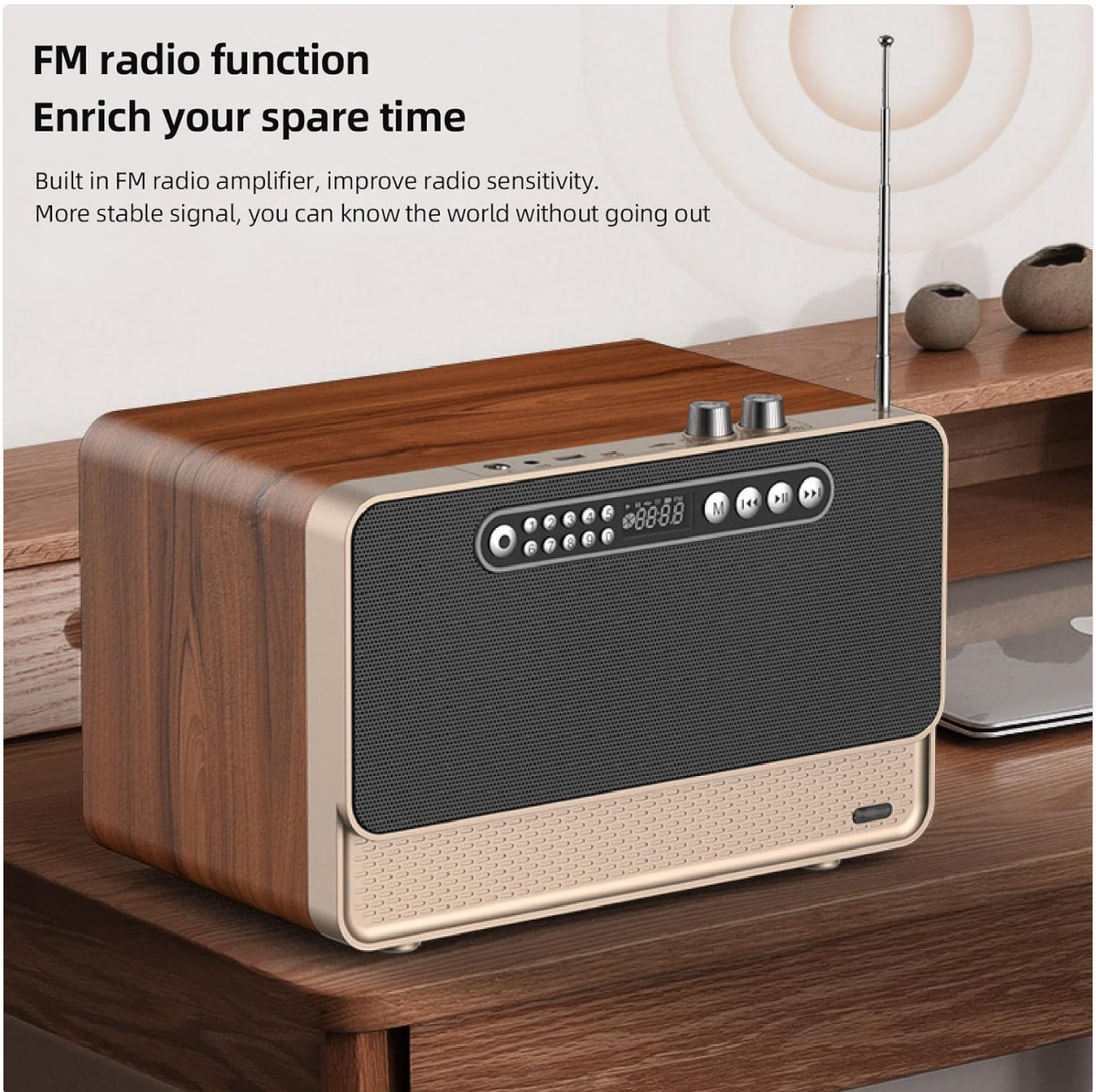
Image: The Bewinner Portable Bluetooth Speaker with its telescopic antenna extended, highlighting its FM radio functionality and ability to receive stable signals.

Built in FM radio amplifier, improve radio sensitivity. More stable signal, you can know the world without going out