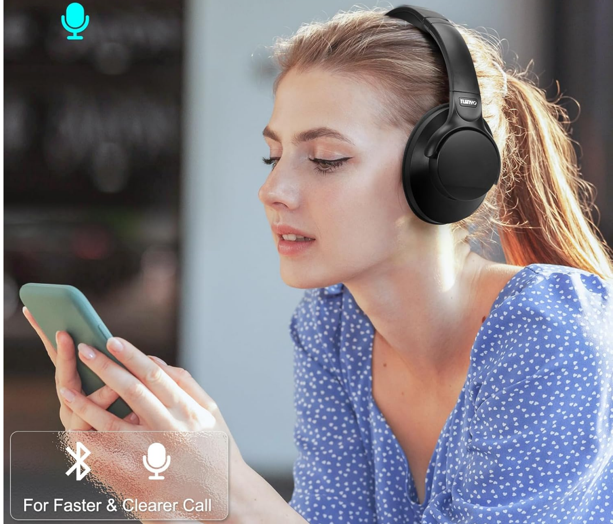
Image: A user interacting with a smartphone while wearing the TUINYO WH-96 headphones, illustrating the voice assistant feature.