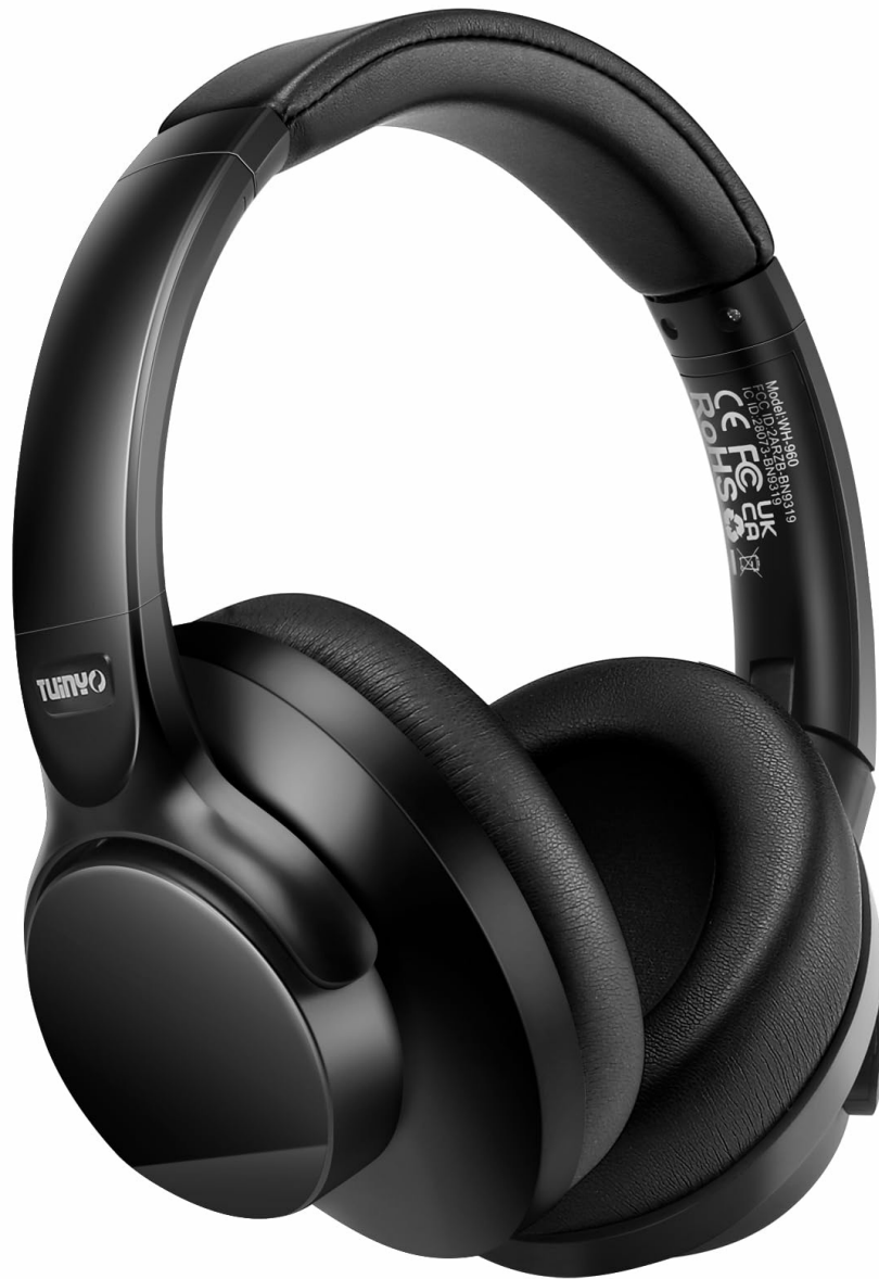
Image: TUINYO WH-96 Bluetooth Wireless Over-Ear Headphones, showcasing the sleek design.