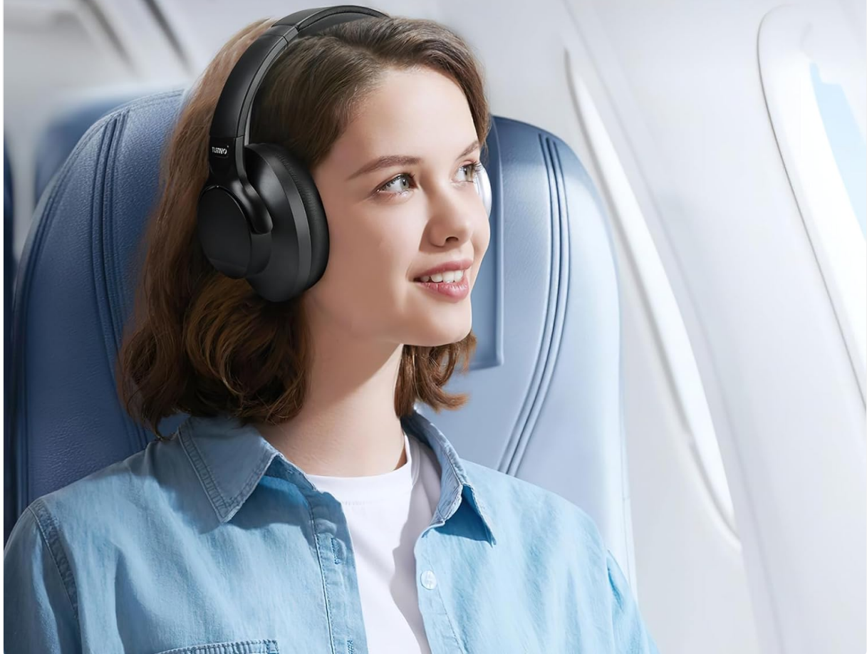
Image: A woman wearing TUINYO WH-96 headphones in an airplane cabin, highlighting the noise reduction capability for a quieter experience.