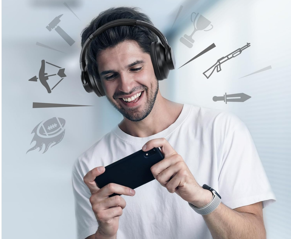
Image: A man enjoying a mobile game while wearing TUINYO WH-96 headphones, illustrating the low-latency Game Mode for synchronized audio and video.

Ultra-Low Latency for Perfect Audio and Video Sync