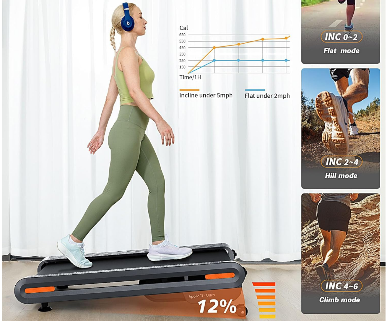
Image: Visual representation of the 6 auto incline options available on the VITALWALK Apollo 11 Ultra, illustrating different terrain simulations.