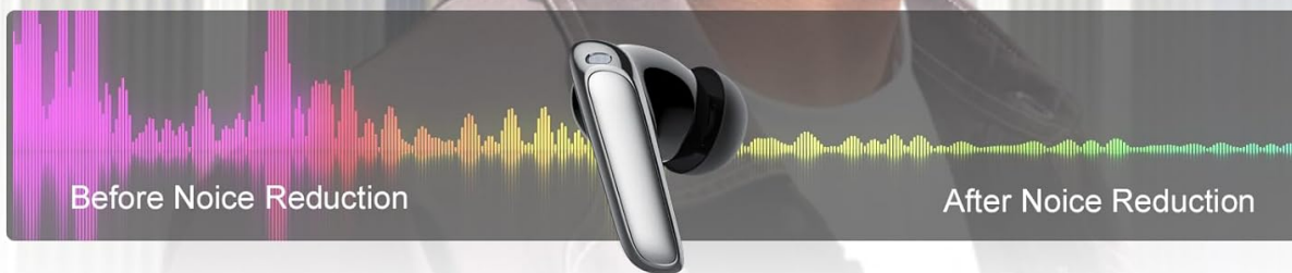
Illustration demonstrating improved call clarity with the dual-microphone system, effectively isolating voice from ambient noise.