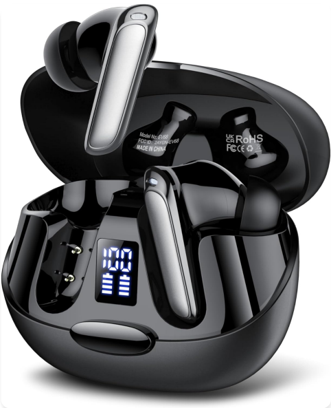
The SKIUDCT Wireless Earbuds EV68 in their open charging case, showcasing the earbuds and the LED battery display.

Thank you for choosing SKIUDCT Wireless Earbuds EV68. These earbuds are designed to provide a superior audio experience with advanced features such as Bluetooth 5.3 connectivity, HiFi stereo sound, extended playtime, intuitive touch controls, and IPX7 waterproofing. This manual will guide you through the setup, operation, and maintenance of your new earbuds to ensure optimal performance and longevity.