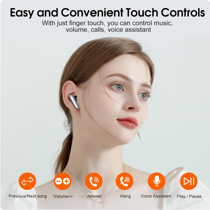
A user demonstrating the touch controls for music, volume, calls, and voice assistant on the SKIUDCT earbuds.