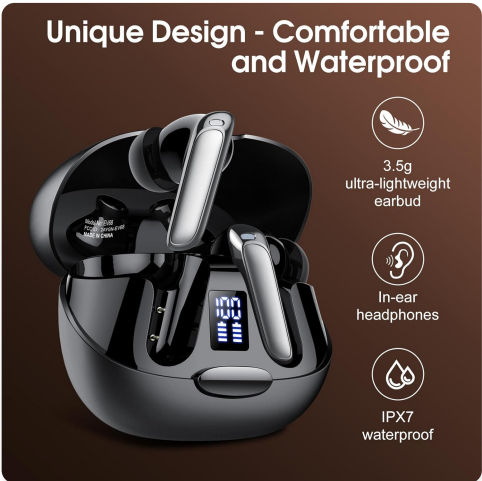
Illustration highlighting the unique design,