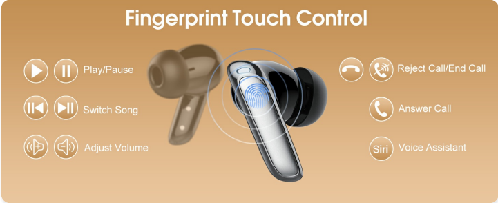
Detailed diagram illustrating the various touch control functions on the earbud, including play/pause, switch song, adjust volume, reject/end call, answer call, and voice assistant activation.