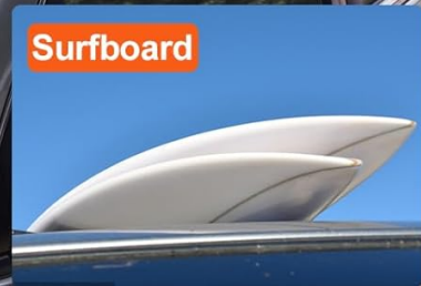
Image: An illustration highlighting the 155 lbs load capacity of the roof rack, with examples of items that can be carried, such as camping gear, bikes, cargo baskets, cargo boxes, and surfboards.