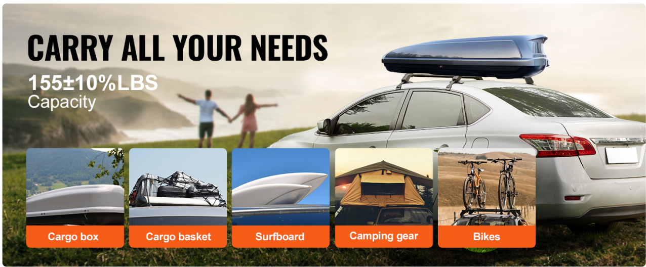
Image: A car equipped with the VEVOR roof rack carrying a cargo box, with additional icons depicting other items like cargo baskets, surfboards, camping gear, and bikes that can be transported.