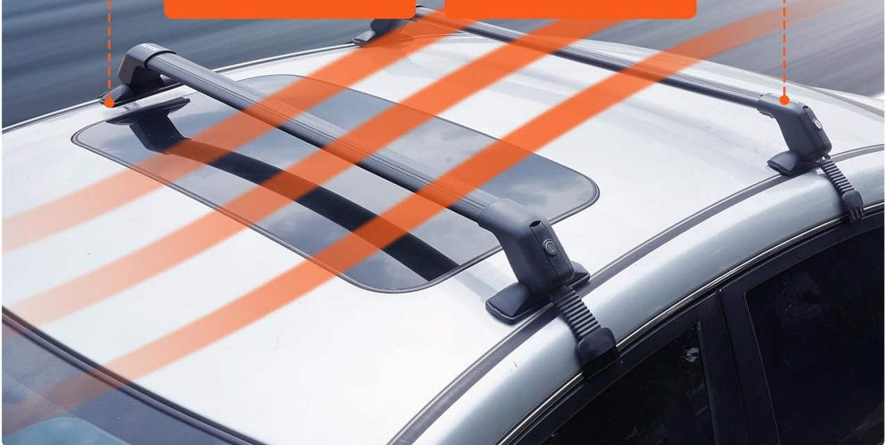
Image: A close-up showing the soft-padded feet for vehicle protection and the anti-theft lock mechanism on the VEVOR roof rack.