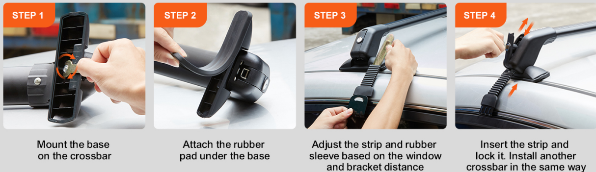
Image: A four-step visual guide demonstrating the damage-free installation process: mounting the base, attaching the rubber pad, adjusting the strap, and inserting/locking the strap.