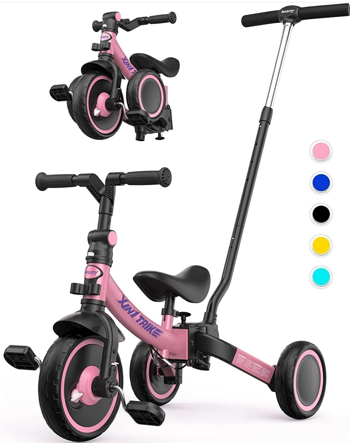
Image: The besrey 7-in-1 Toddler Bike, showcasing its adaptability from a push trike to a balance bike. The main image displays the product in pink, highlighting its compact and multi-functional design.