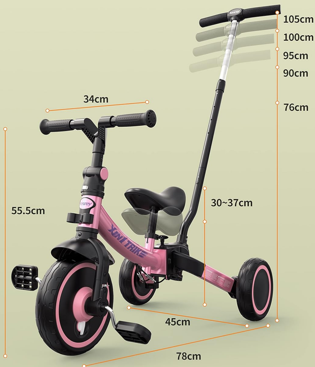
Image: A diagram detailing the adjustable features and dimensions of the bike, including seat height, handlebar position, and the range of the parent push handle.