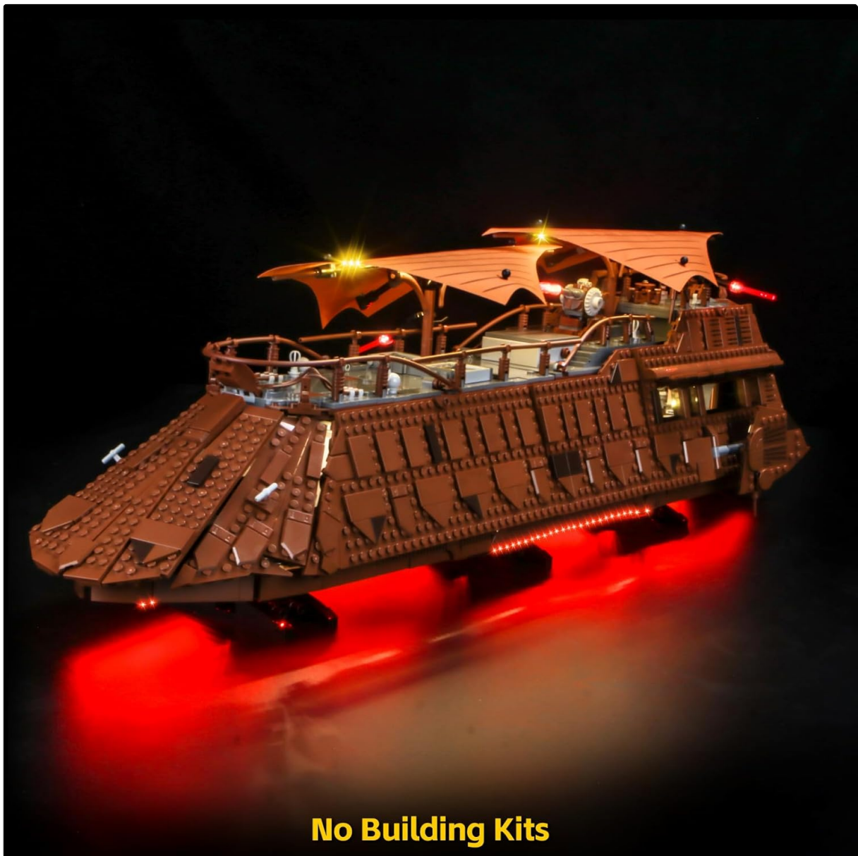
Image: The LEGO Jabba's Sail Barge model illuminated by the BrickBling LED Light Kit, showcasing the vibrant lighting effects.