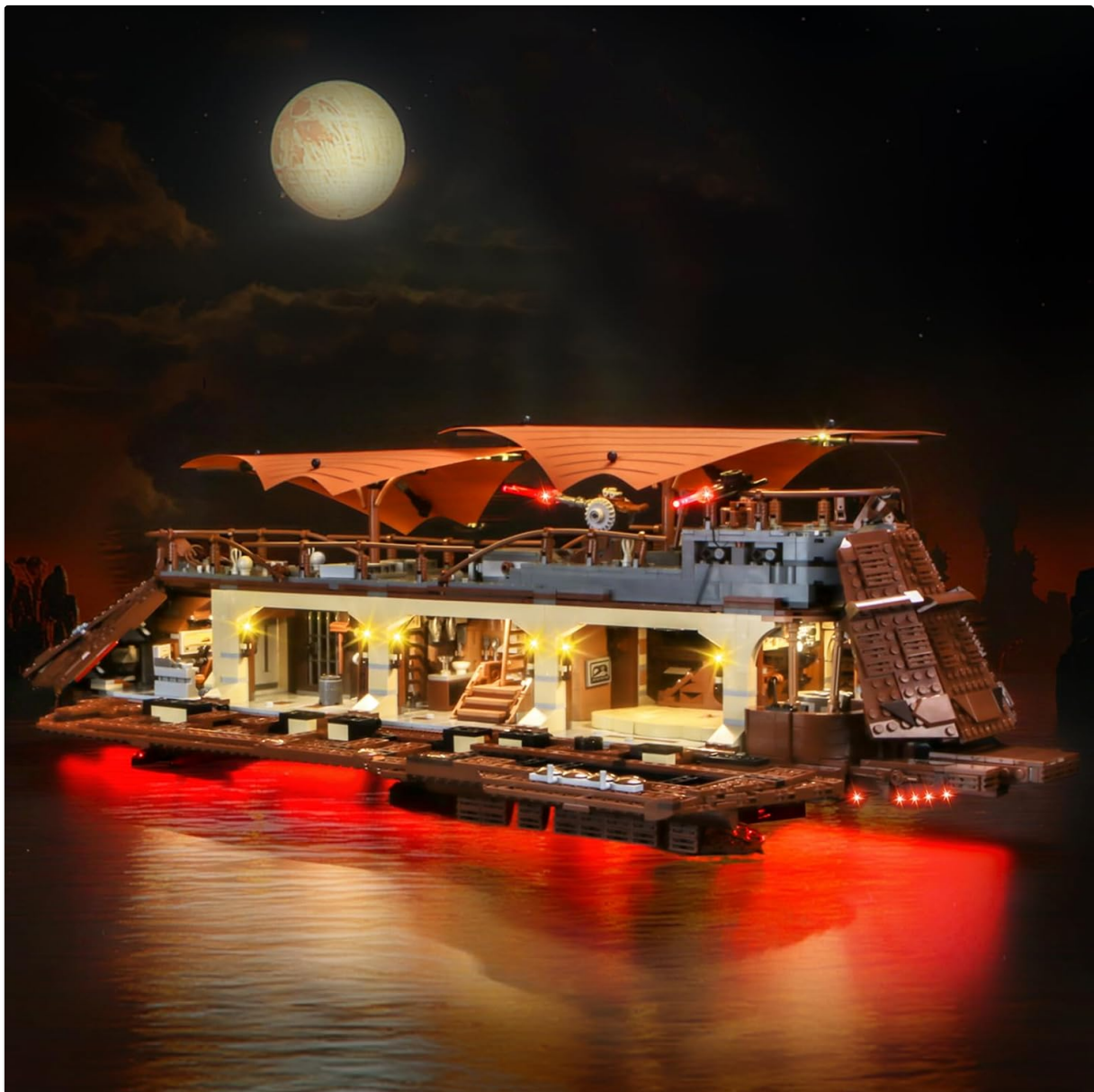
Image: Detailed view of the BrickBling LED Light Kit components.