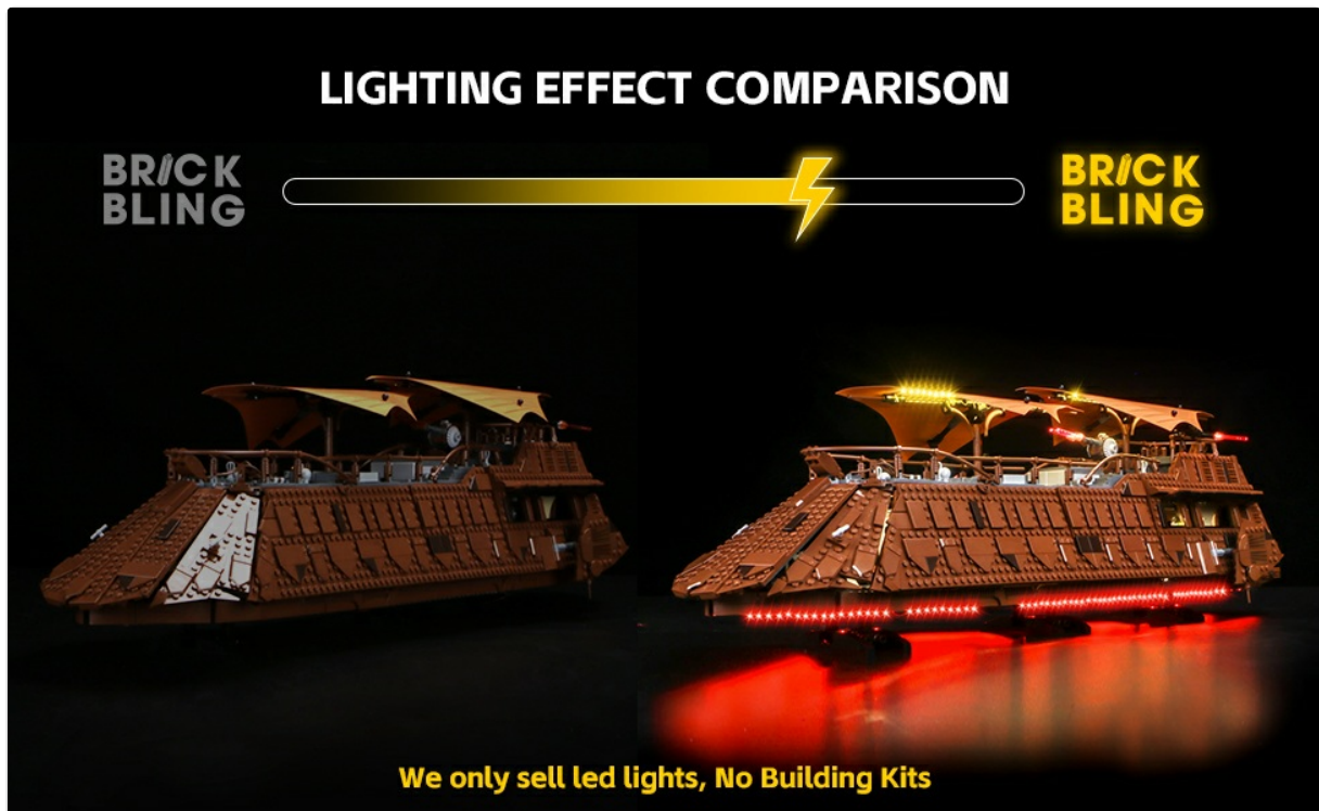
Image: Lighting effect comparison, demonstrating the impact of the LED kit.

If these steps do not resolve the issue, please consult the detailed electronic manual or contact BrickBling customer support for further assistance.