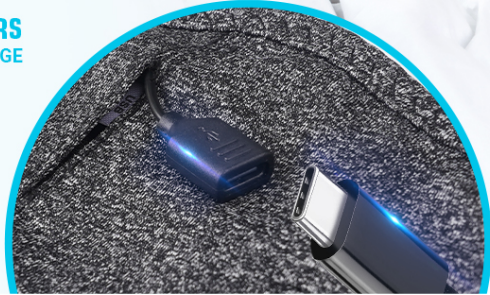
Image: Charging the headband, highlighting the USB port and battery life.