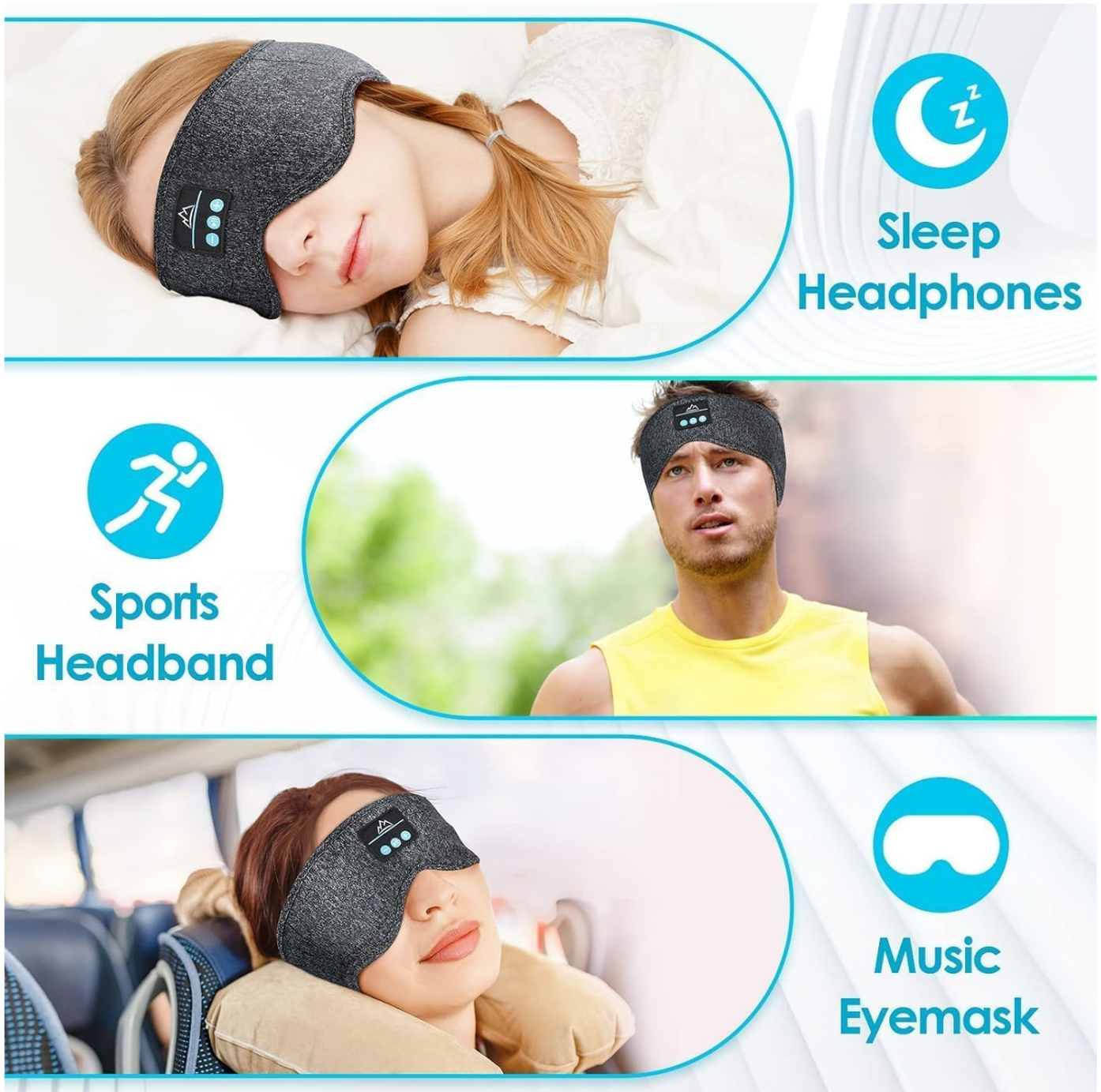
Image: Illustrates the 3-in-1 functionality: Sleep Headphones, Sports Headband, and Music Eyemask.