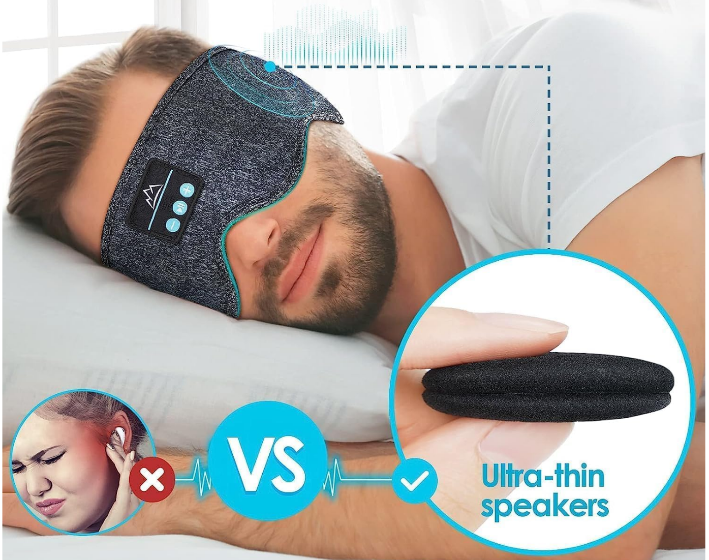
Image: Demonstrates the comfort for side sleepers due to the ultra-thin speakers.