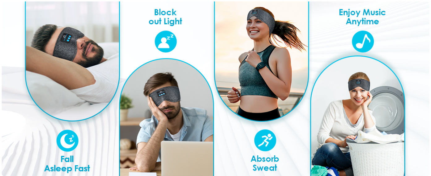
Image: Various usage scenarios for the headband, including sleeping, working, exercising, and daily activities.