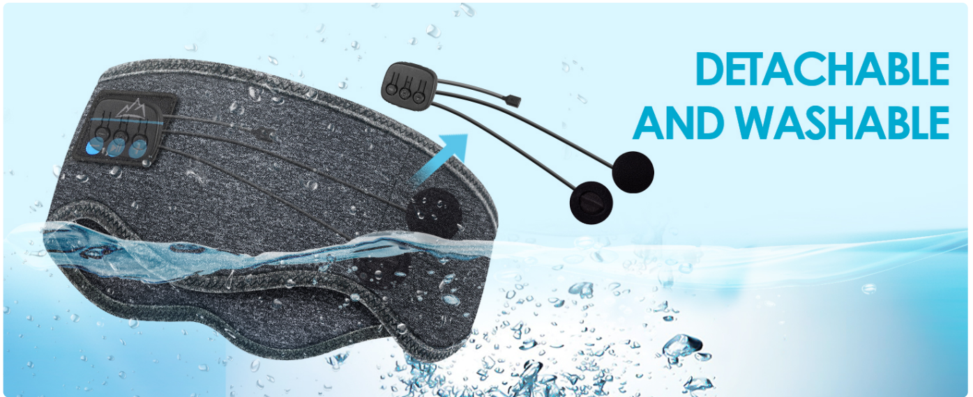
Image: Detachable and washable design for easy cleaning.