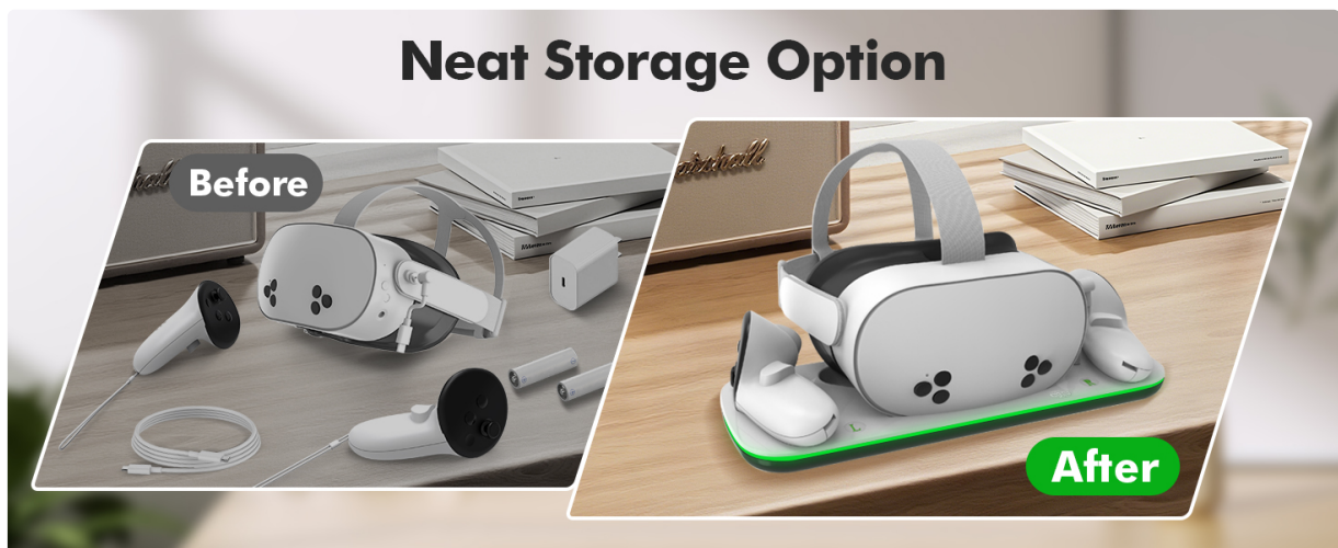
Figure 1.1: The charging dock provides a neat and organized storage solution for your Meta Quest 3/3S headset and controllers.

The ultra-thin design allows for effortless use, cleaning, storage, and portability, saving valuable space. It provides a dedicated spot for your VR gear, ensuring it's always ready for immersive gaming sessions and reducing storage complexity.