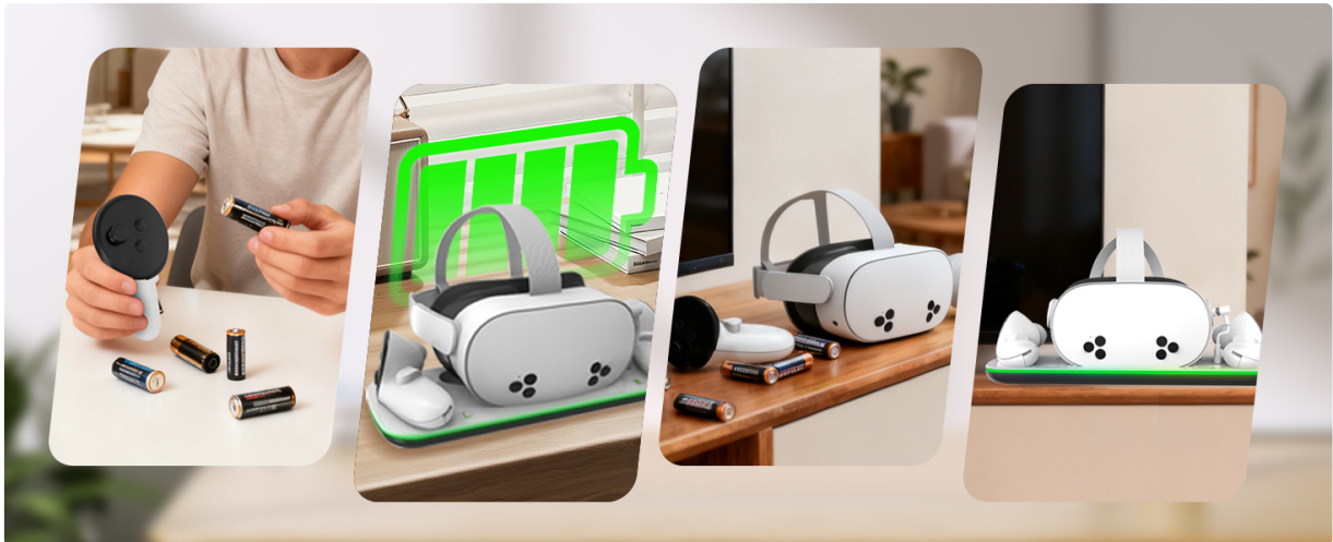
Figure 3.1: Proper installation of rechargeable batteries and specialized covers for controllers.