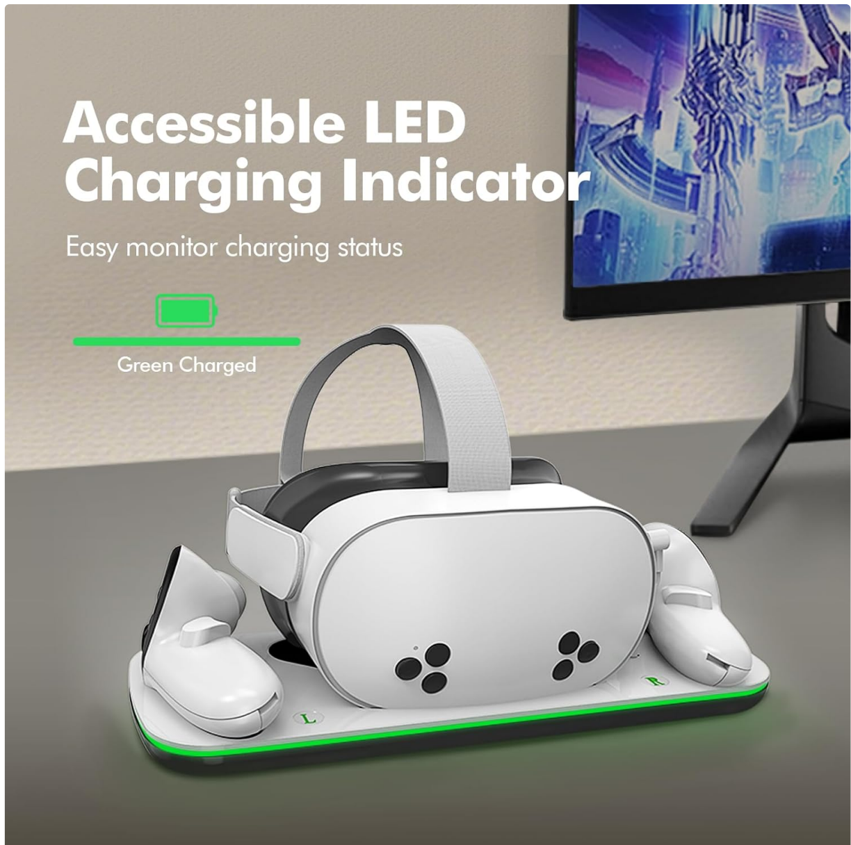
Figure 4.3: The accessible LED indicator shows a green light when devices are fully charged.