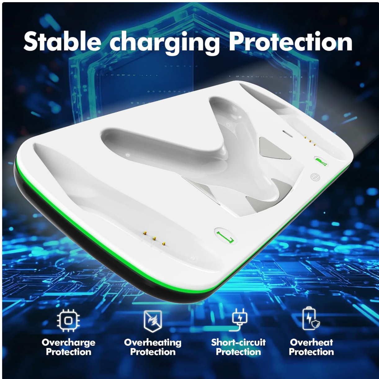
Figure 6.1: The charging dock includes multiple safety protections for stable charging.