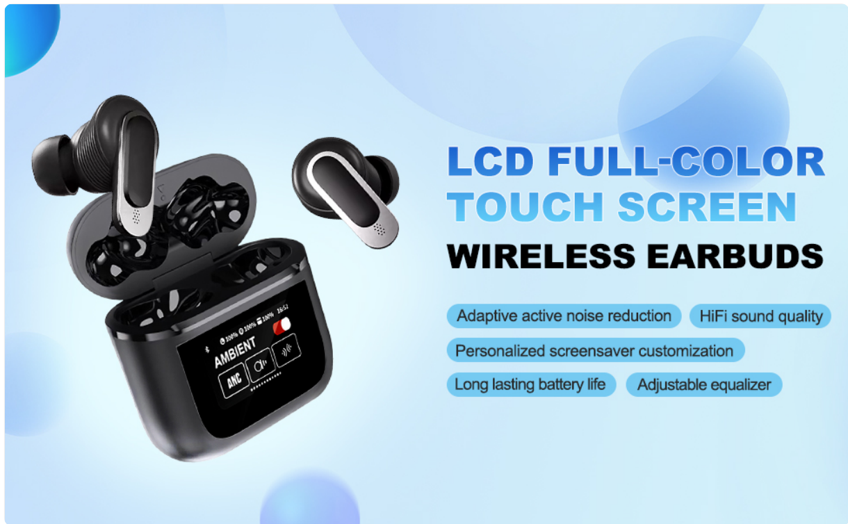
Figure 2: Earbuds with LCD Full-Color Touch Screen. This image highlights the smart touch screen on the charging case, which allows for noise reduction control, music playback, and equalizer switching.

Your browser does not support the video tag.