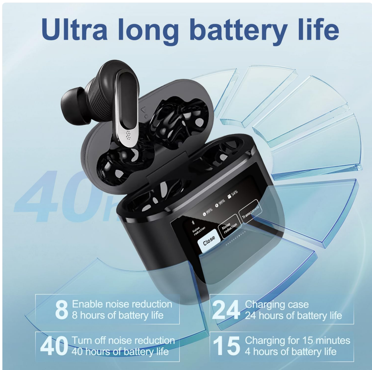
Figure 5: Earbuds Ultra Long Battery Life. This image details the battery performance, including total playtime with the charging case and single charge duration.