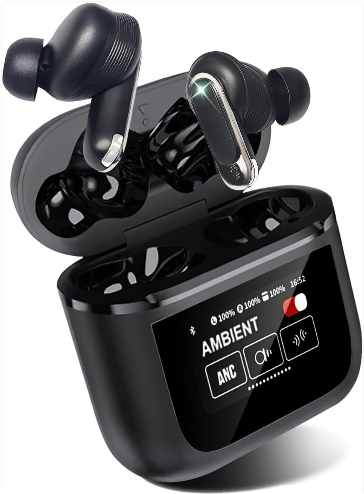
Figure 1: Generic Y12 TWS Wireless Earbuds and Charging Case. The earbuds are shown resting in their open charging case, which features a digital display on the front.