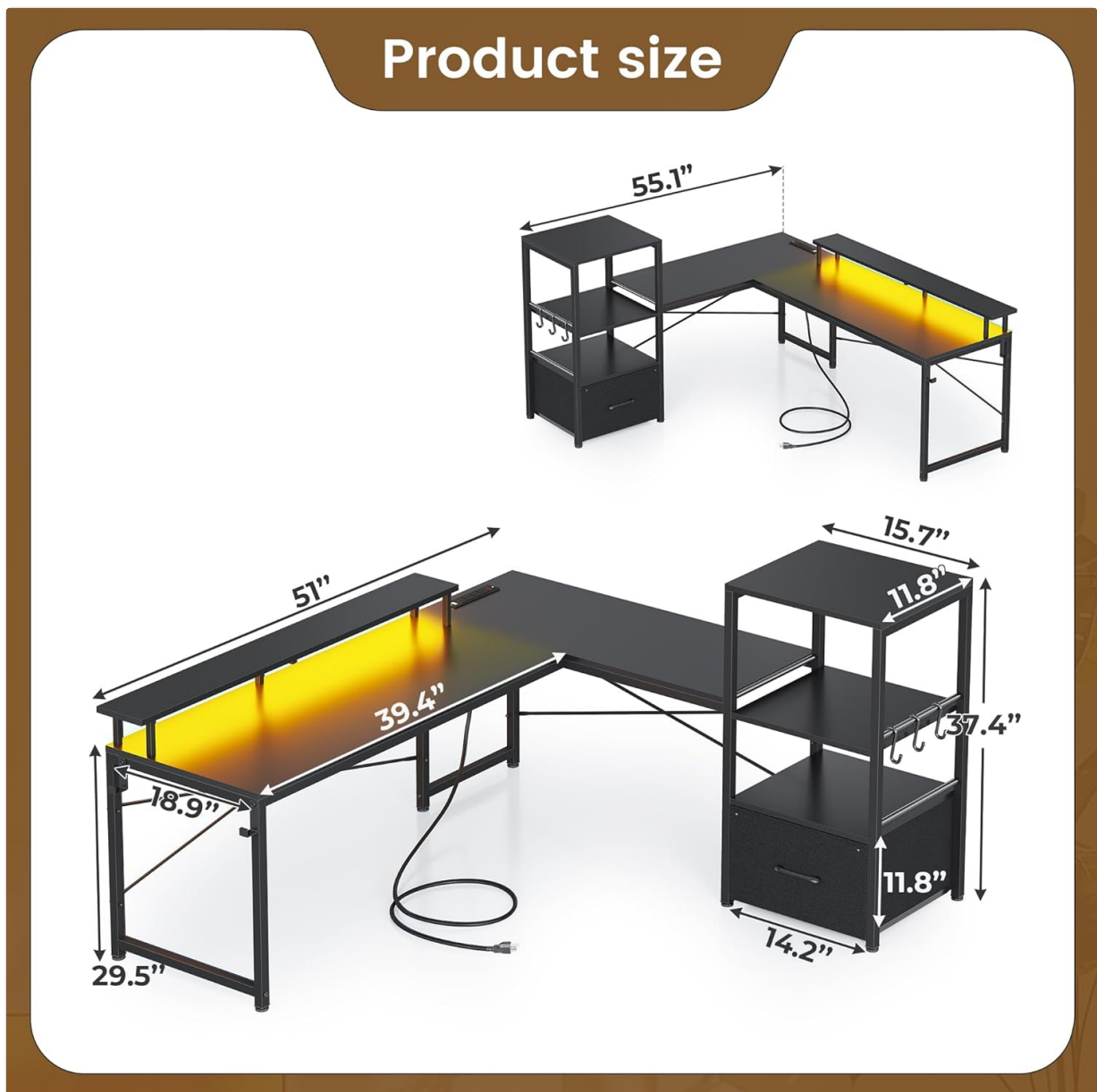
Figure 3.1: Product dimensions for planning your space.