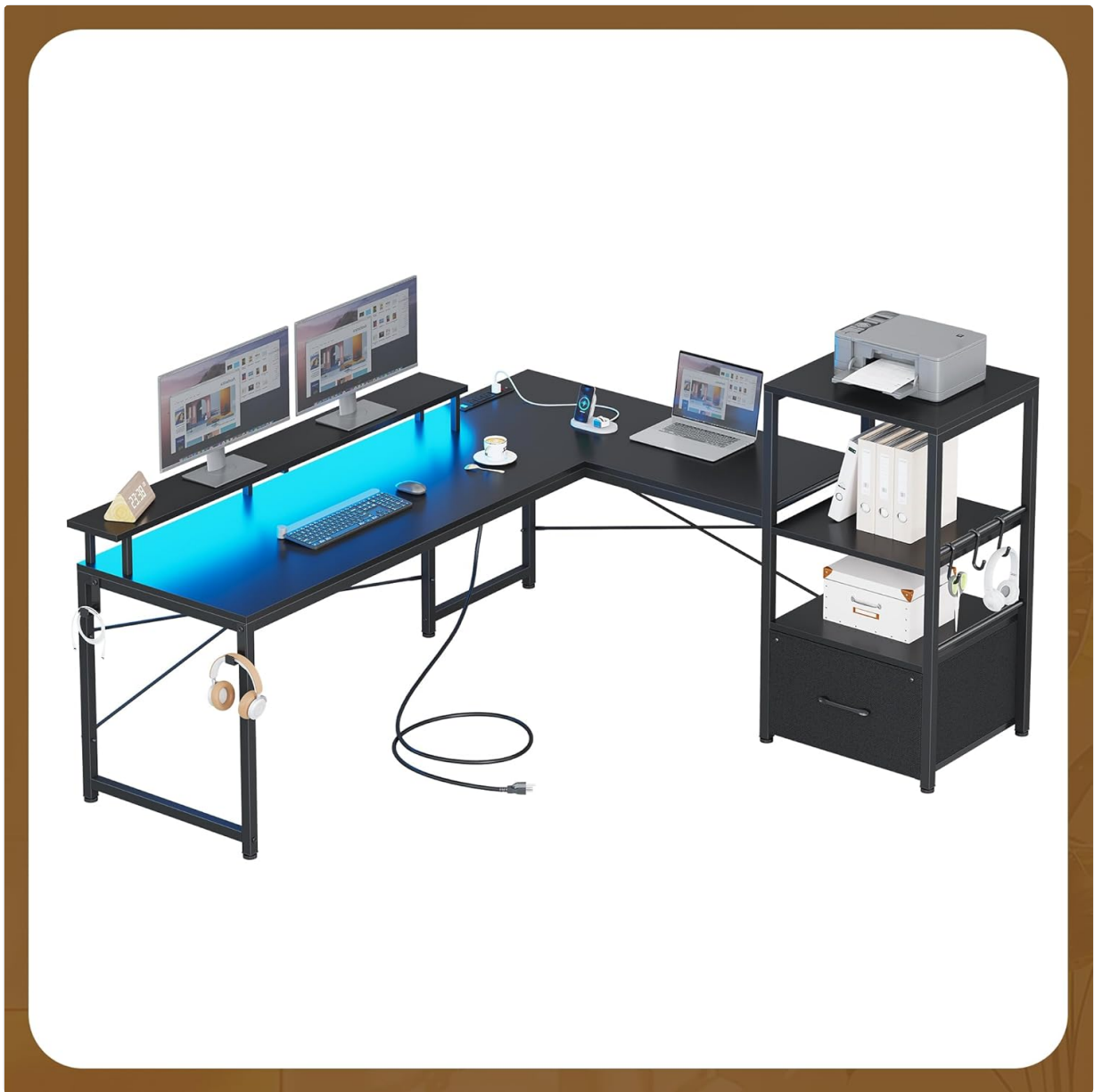
Figure 2.1: The MSmask L-Shaped Desk W69241, showcasing its design and features.