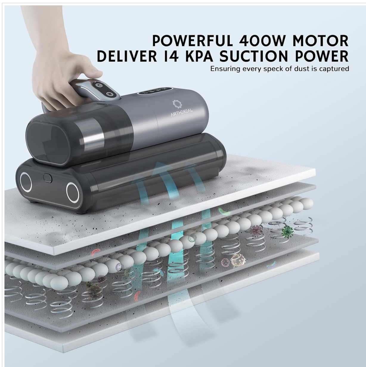
Image: The AIRTHEREAL M1 Mattress Vacuum Cleaner highlighting its 140°F high-temperature air heating feature, designed to inhibit dust mite growth.