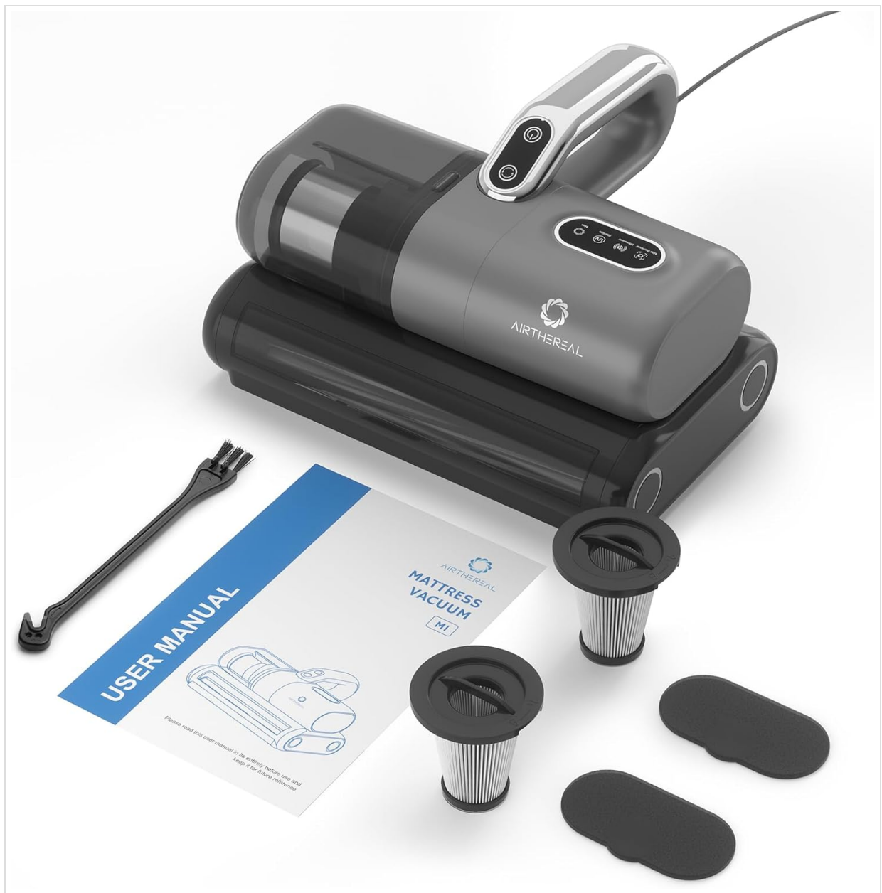
Image: The AIRTHEREAL M1 Mattress Vacuum Cleaner along with its included accessories, such as the cleaning brush and user manual.