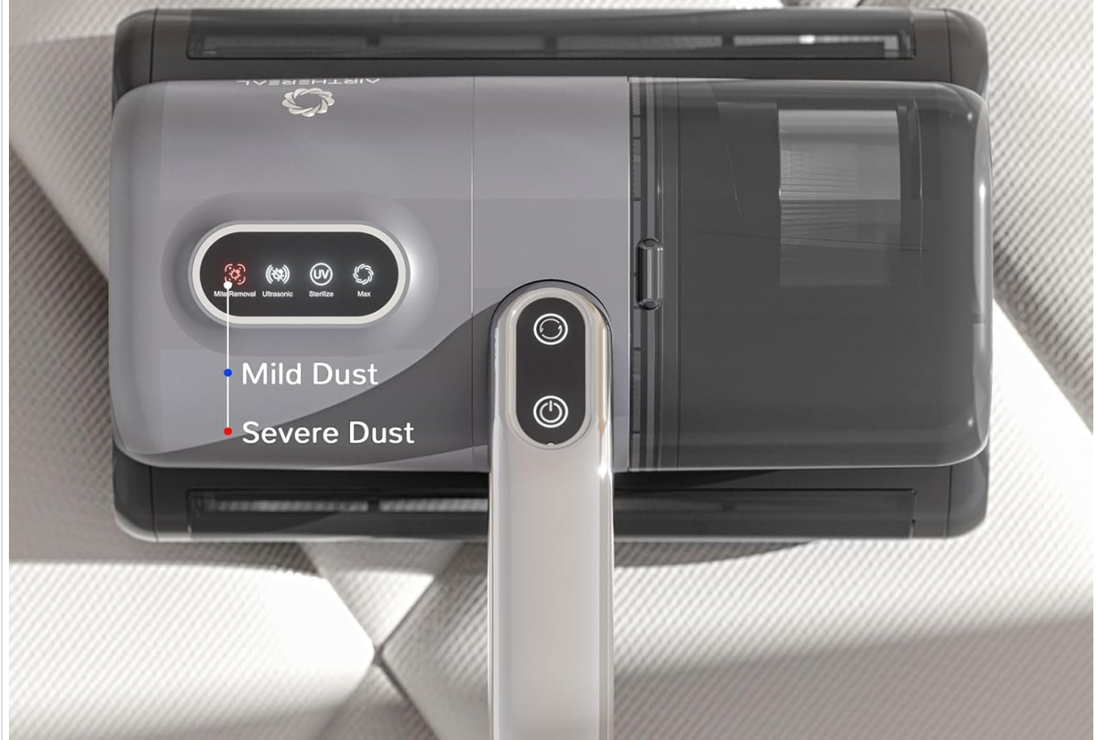
Image: The AIRTHEREAL M1 Mattress Vacuum Cleaner demonstrating its UV-C light and ultrasonic wave functions for effective allergen and dust removal.