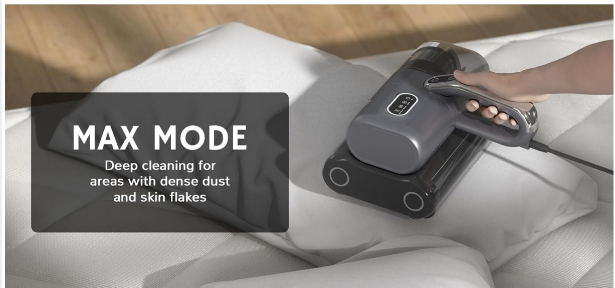
Image: The AIRTHEREAL M1 Mattress Vacuum Cleaner illustrating its two suction modes: AUTO for automatic adjustment based on dust levels, and MAX for deep cleaning.