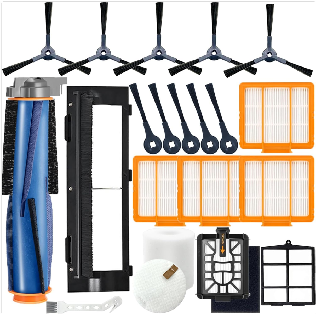
Image 1.1: Overview of the complete CauYien replacement parts kit.