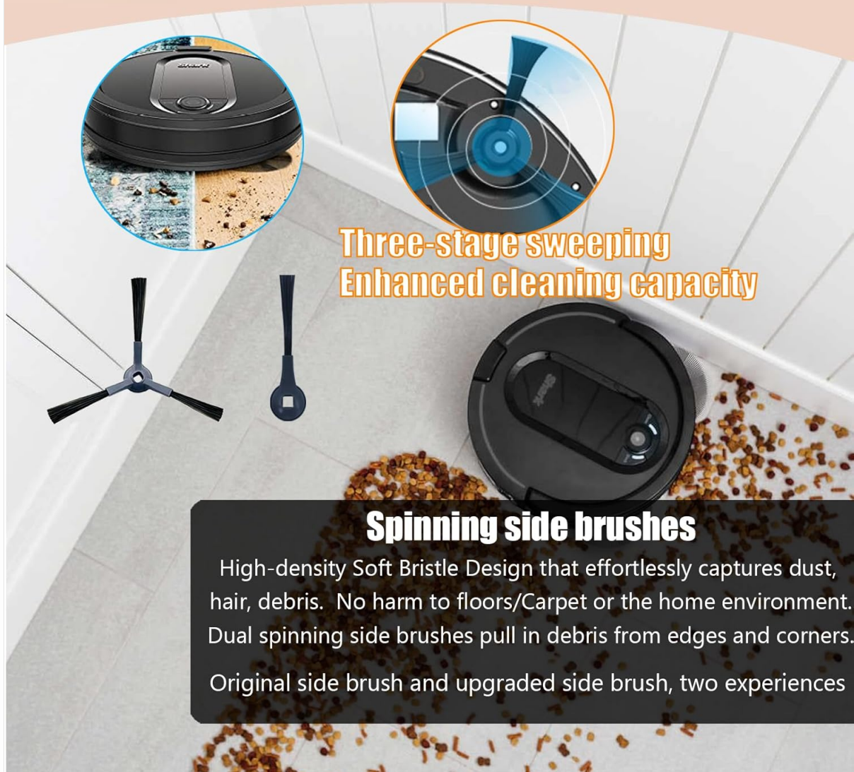
Image 4.2: Illustration of side brush design and its sweeping action.