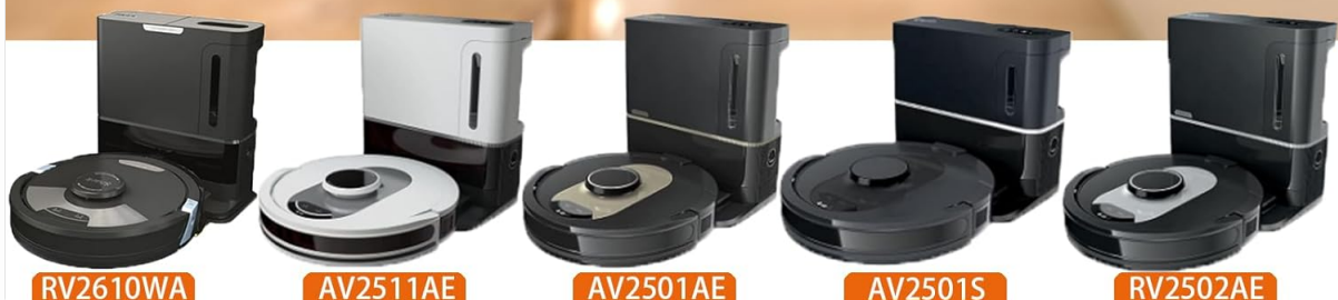
Image 2.1: Visual representation of compatible Shark AI Robot Vacuum Cleaner models.

Not Compatible Models: AV1010AE R101AE RV1001AE AV911S AV993RV912S AV992 AV1002AE RV100AE RV1000 UR1000SR