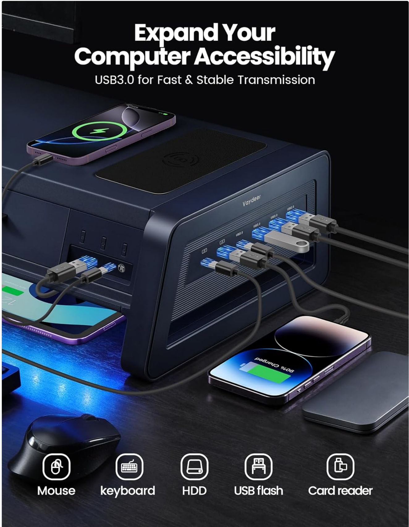
Image: A close-up view of the Vaydeer monitor stand's front panel, highlighting the various USB ports. Multiple USB cables are connected, illustrating the stand's capability to expand computer accessibility and connect various peripherals.

The monitor stand features 8 USB ports on the front for convenient access. Four ports are dedicated to fast charging, while the other four are for data transfer. Simply plug your USB devices, such as smartphones, USB drives, or external hard drives, into the appropriate ports.