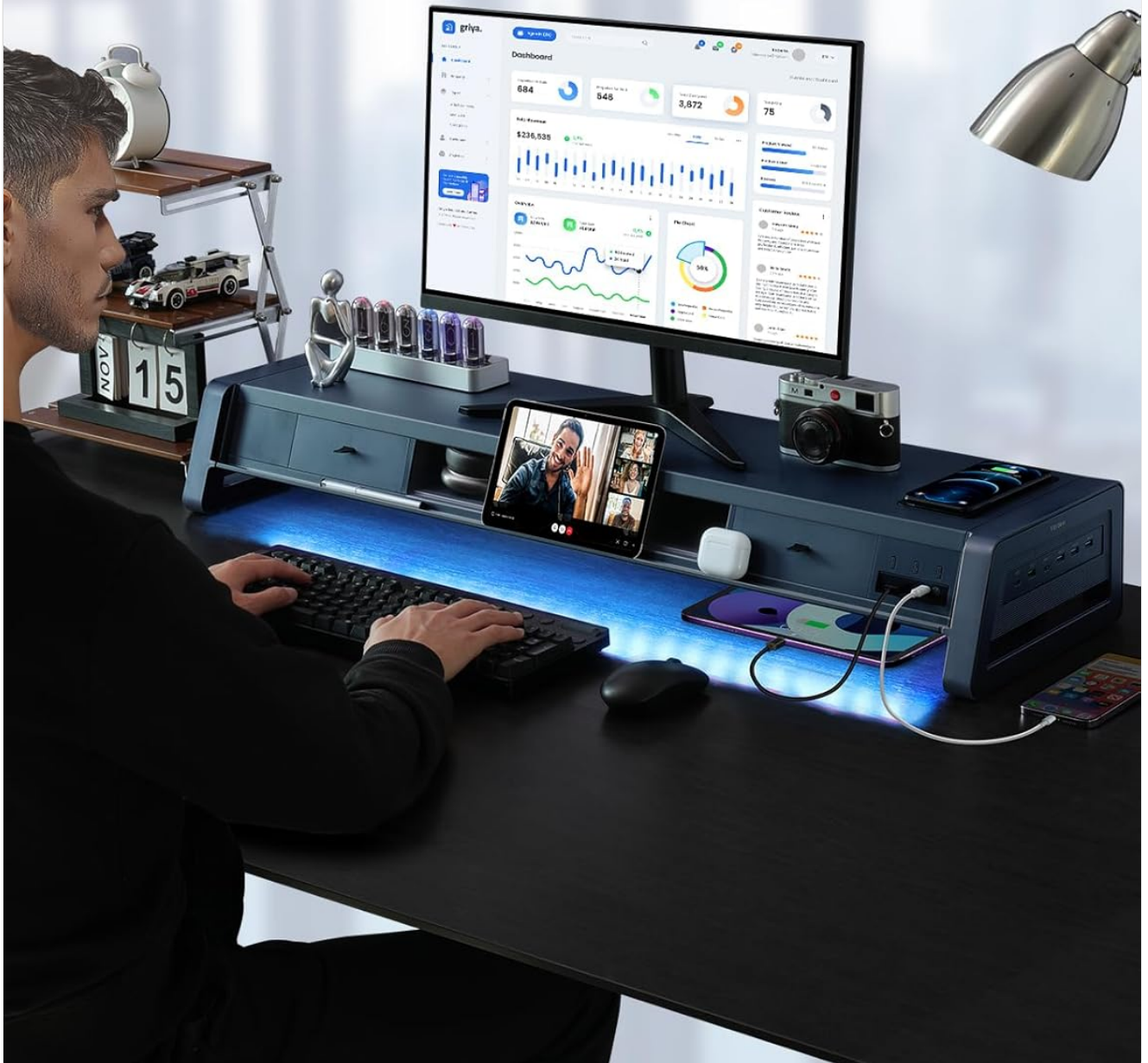
Image: A user is seated at a desk, utilizing the Vaydeer monitor stand. A single monitor is placed on top, with a tablet and smartphone positioned in the lower storage tier, demonstrating a functional workspace setup.