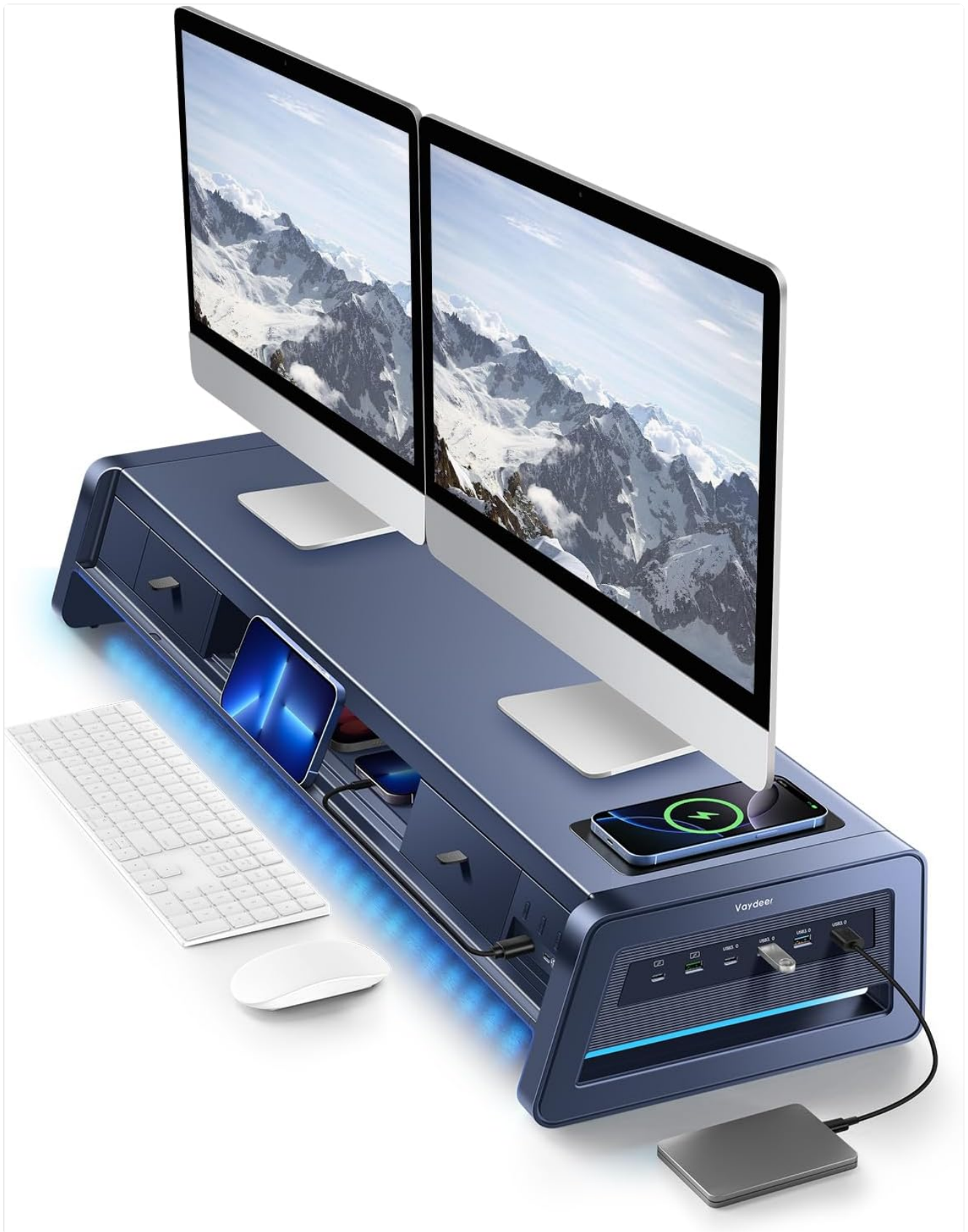
Image: The Vaydeer All-in-One Dual Monitor Stand Riser in a dark blue finish, shown supporting two monitors. A keyboard and mouse are positioned below the stand, and a smartphone is charging wirelessly on the integrated pad. The LED light strip illuminates the area beneath the stand.