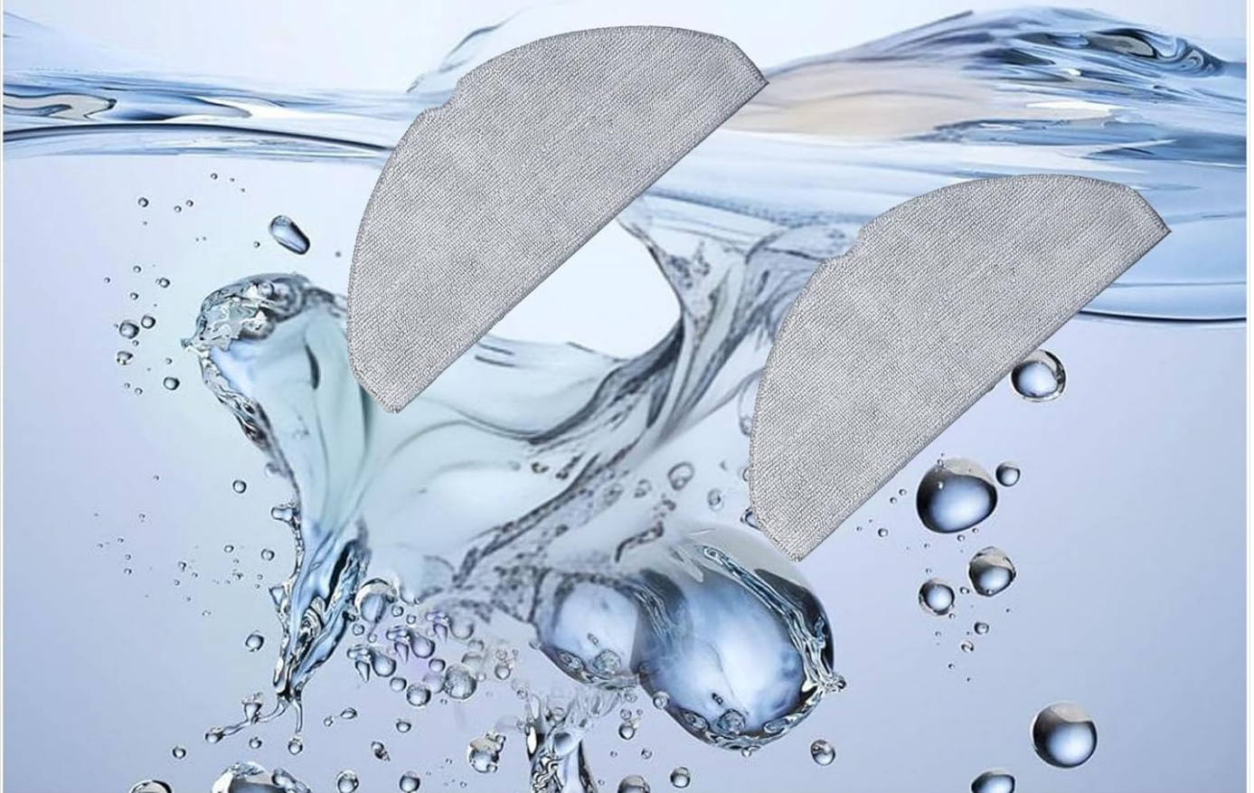
Figure 5: Mop Pads.

Washable and Reusable can be washed with water, so you can increase the frequency of use