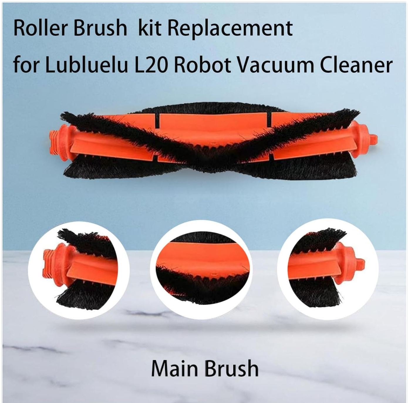
Figure 2: Main Brush Roller.