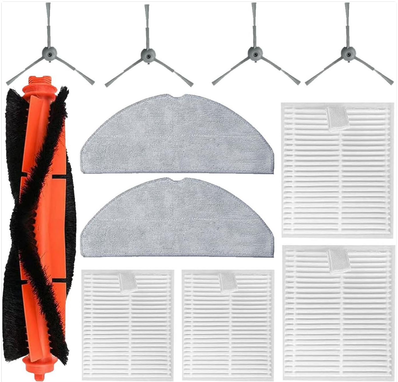
Figure 1: Complete Replacement Accessories Kit for Lubluelu L20 Robot Vacuum Cleaner.