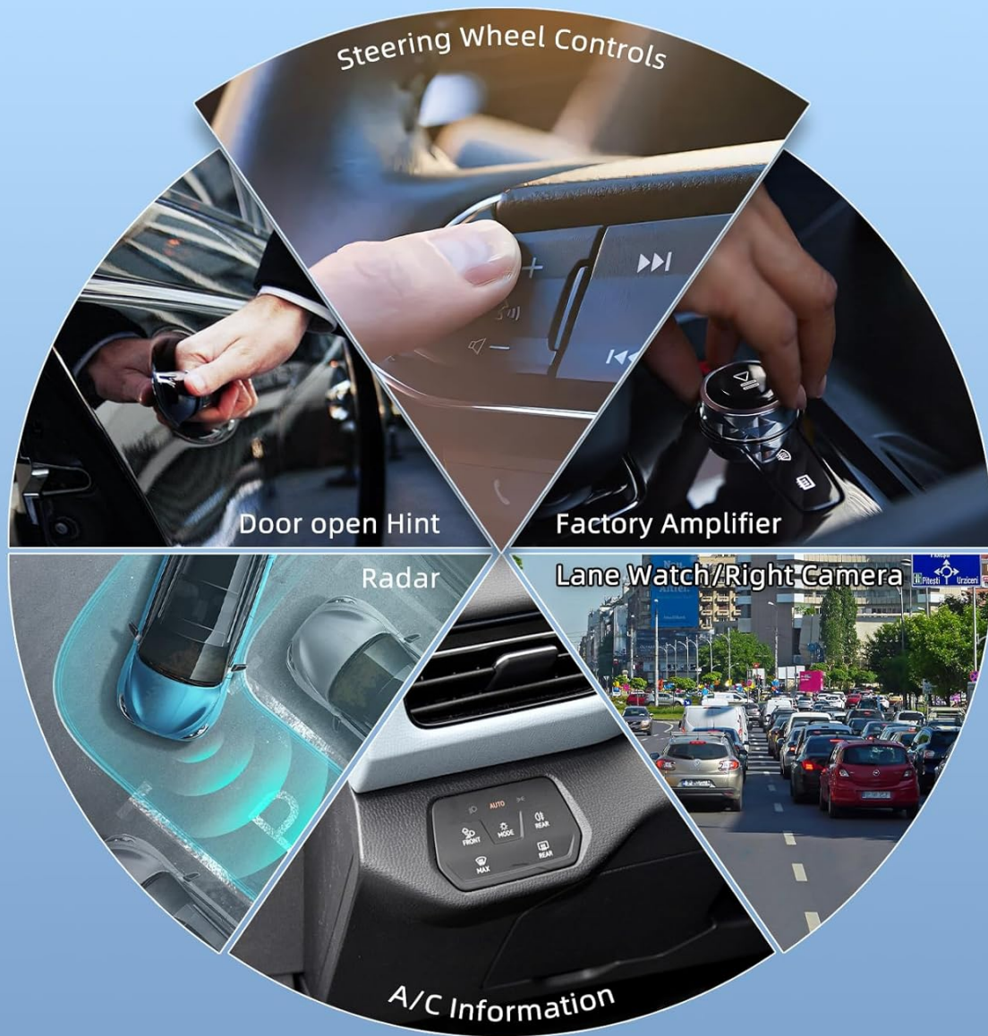
Figure 8.5: Overview of retained original vehicle functions.