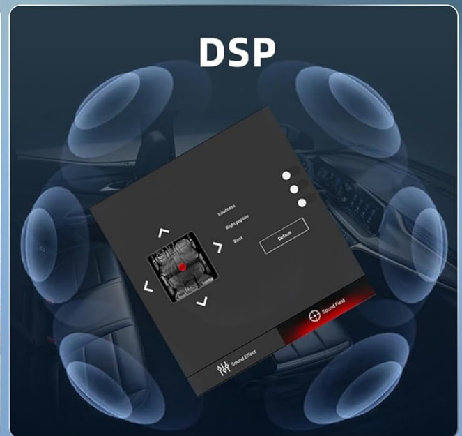
Figure 8.2: Bluetooth 5.0, FM RDS Radio, and DSP features.