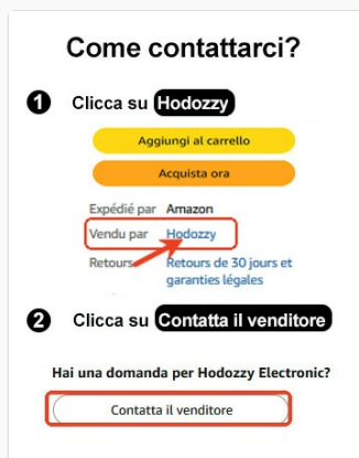
Figure 11.1: Guide on contacting Hodozzy for support.