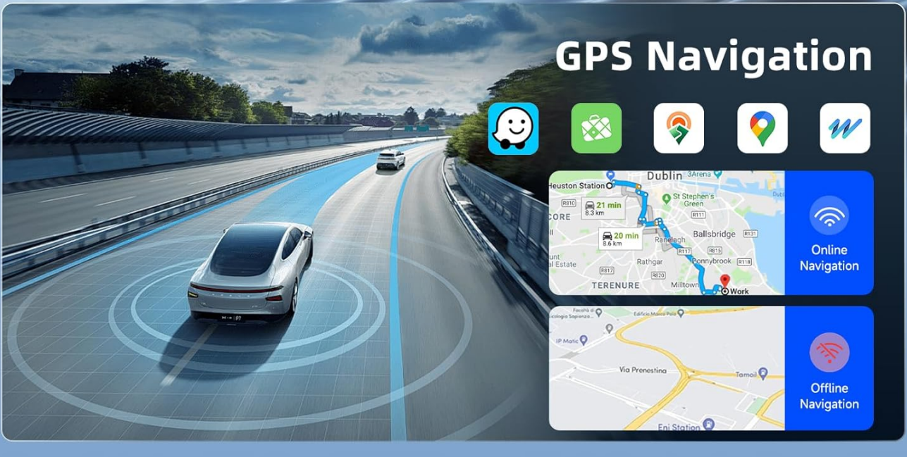
Figure 8.3: WiFi connectivity and GPS navigation features.