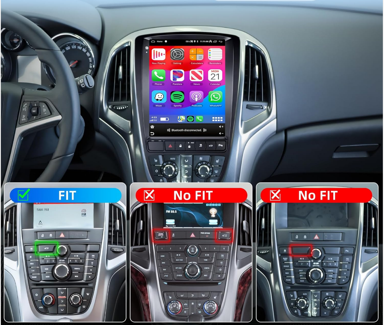
Figure 4.1: Visual guide for vehicle compatibility, highlighting models with the ECO button.