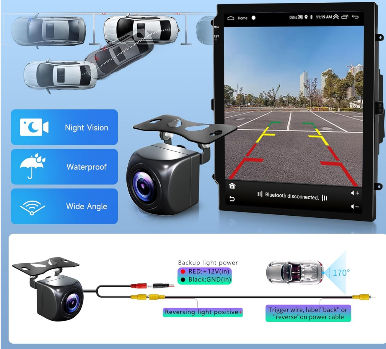
Figure 8.4: Rear camera features and wiring for reverse assistance.