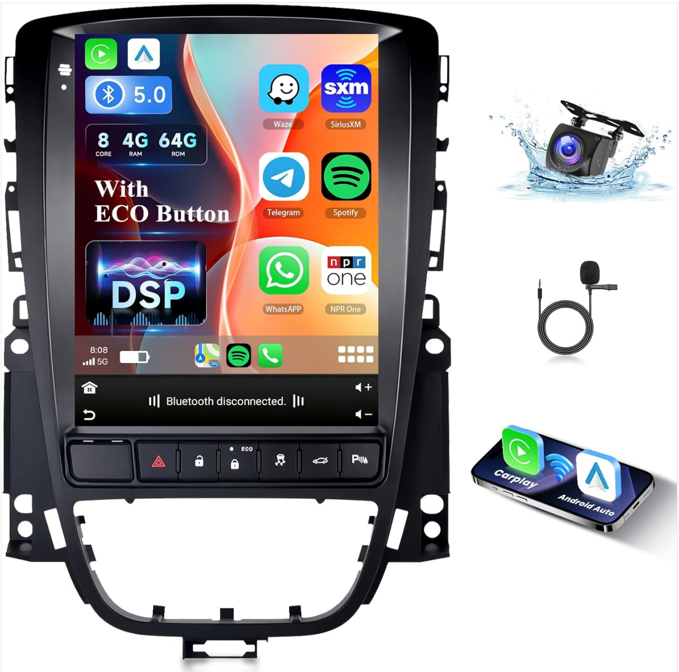
Figure 3.1: Main view of the Hodozy Carplay Android Car Stereo and included accessories.