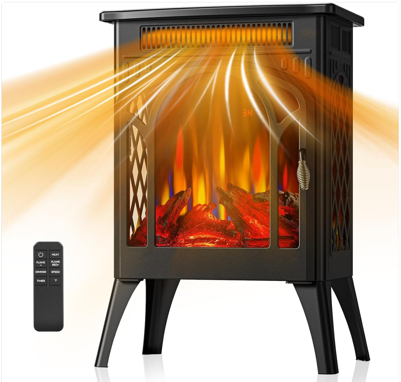
Image 1: Electactic S180 Electric Fireplace Stove and its remote control.