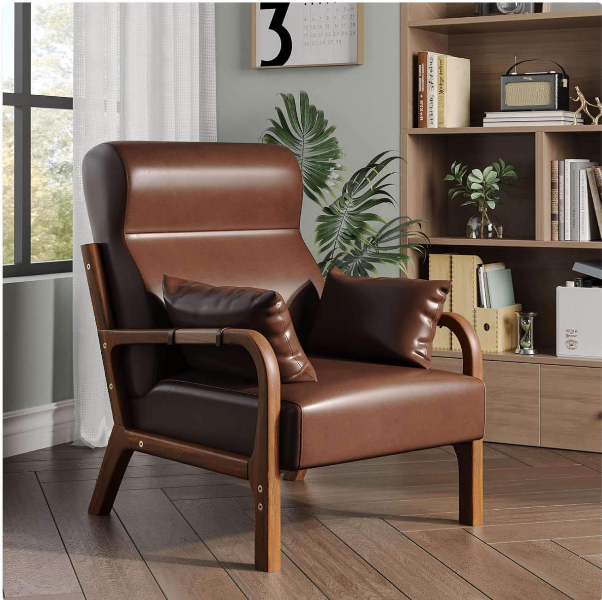
Image: The Bestier Mid-Century Modern Accent Chair, featuring a brown PU leather upholstery and a wooden frame, positioned in a contemporary living space.