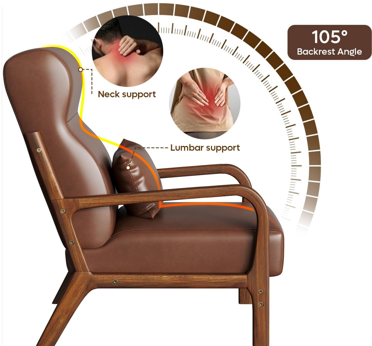
Image: An illustration demonstrating the 105-degree backrest angle of the chair, highlighting how it provides optimal neck and lumbar support for the user.