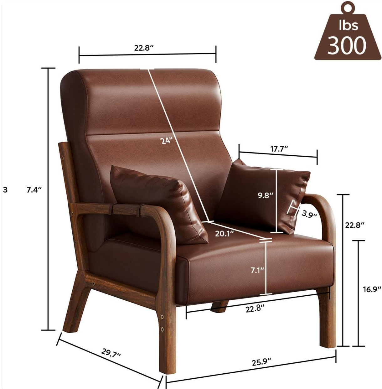
Image: A technical diagram illustrating the various dimensions of the accent chair, including width, depth, and height measurements, along with the 300 lbs weight capacity.