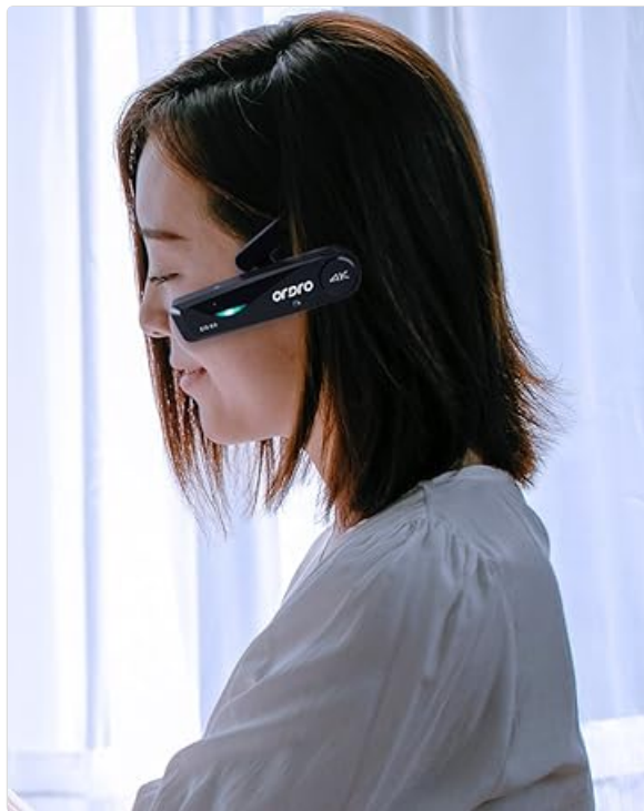
Image 5.3: The ORDRO G930 camera demonstrating its use as a webcam for live streaming and its HDMI output capability for connecting to a TV.