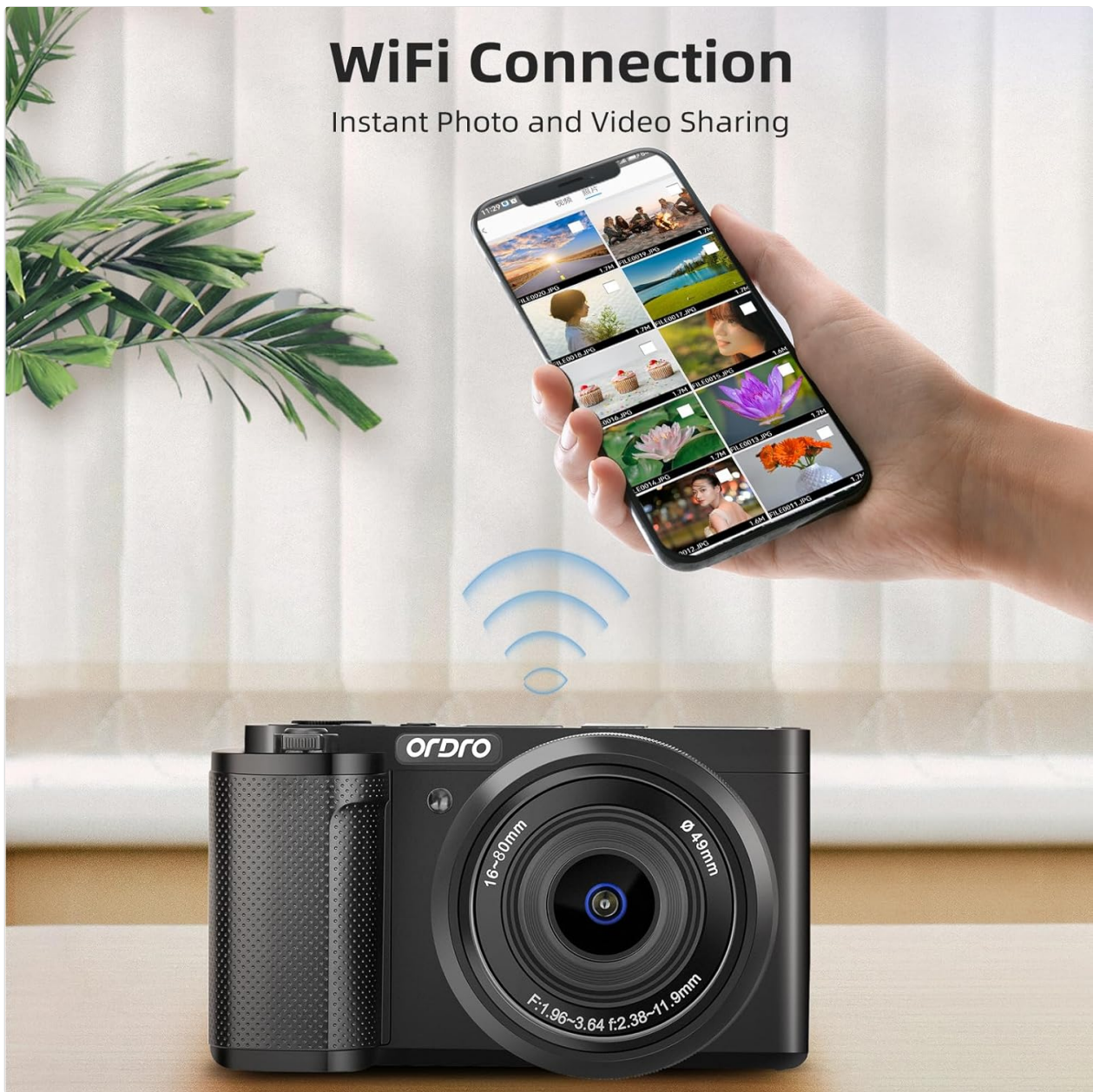
Image 5.4: The ORDRO G930 camera wirelessly connected to a smartphone, illustrating the instant photo and video sharing capability via Wi-Fi.