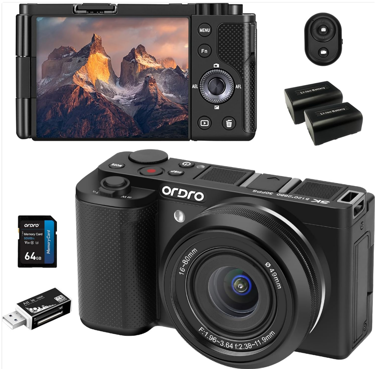
Image 2.1: The ORDRO G930 Digital Camera shown with its standard accessories, including two batteries, a 64GB memory card, and a remote control.