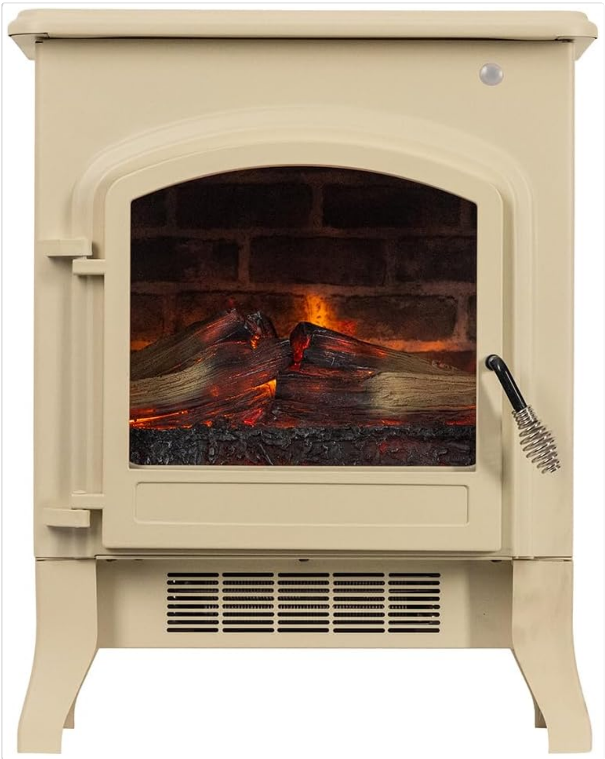
Image 1: Front view of the Country Living 18 Inch Cream Electric Fireplace Stove Heater.