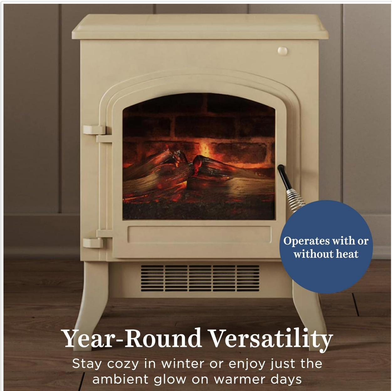
Image 4: The electric fireplace unit, highlighting its ability to operate with or without the heating function for year-round use.