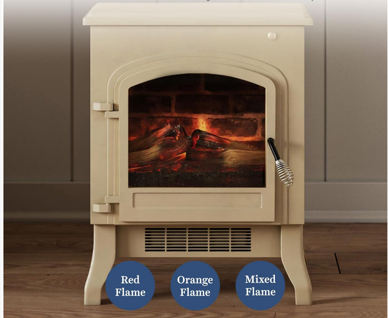
Image 5: The electric fireplace displaying various flame color options: Red Flame, Orange Flame, and Mixed Flame.

Choose from vibrant orange, bold red, or a mixed 3D flame effect in your electric fireplace