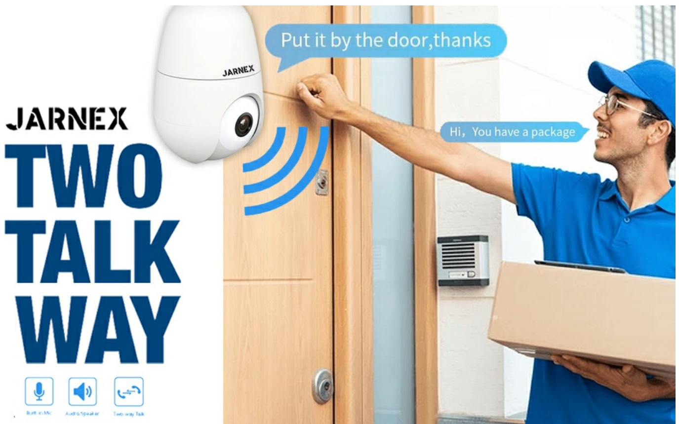
Image: A person at a door interacting with a delivery person using the camera's two-way audio feature, demonstrating its communication capabilities.

Utilize the built-in microphone and speaker for two-way communication. Tap the microphone icon in the app to speak, and listen through the camera's speaker.