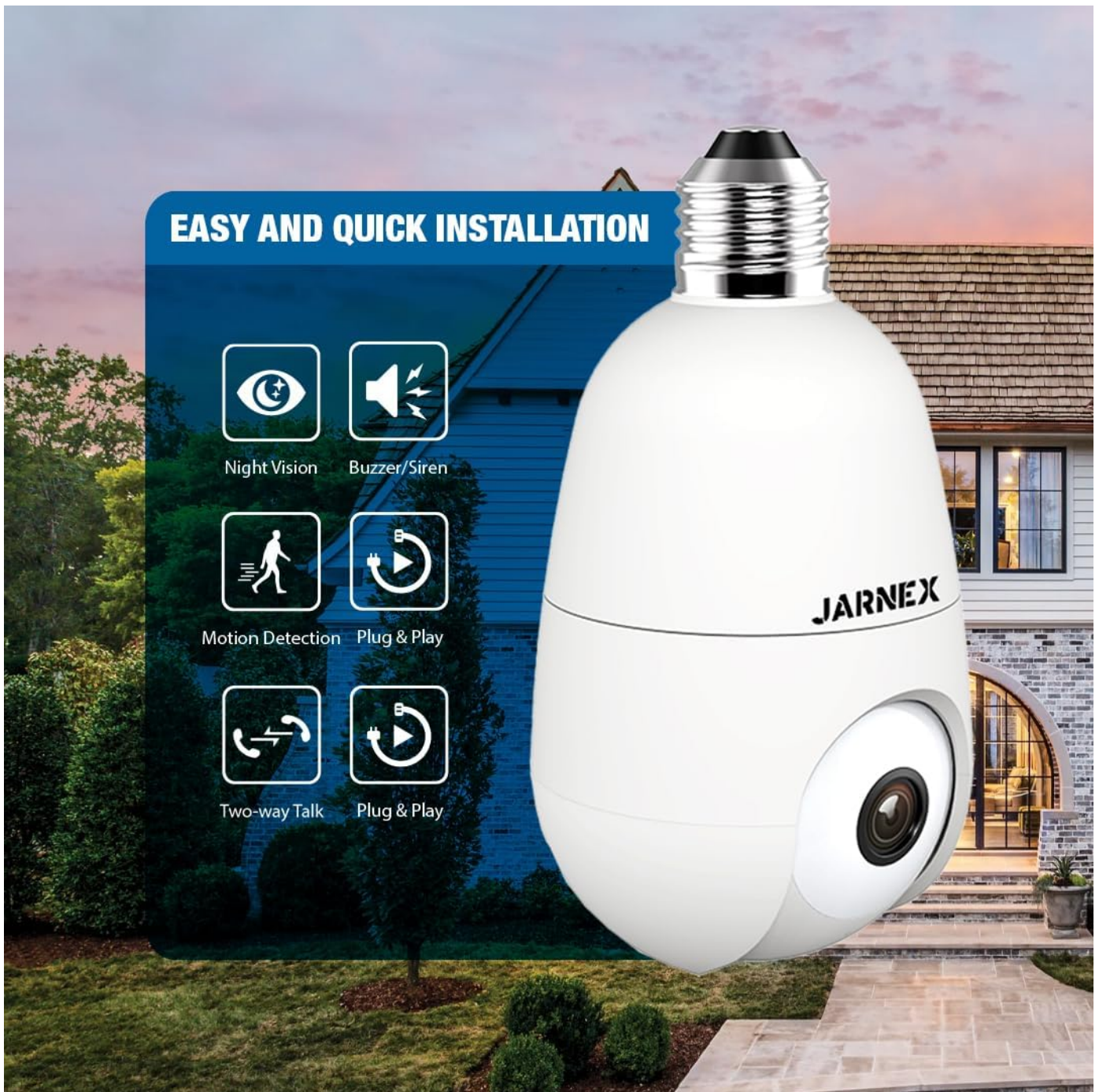
Image: An illustration highlighting the camera's key features including night vision, siren, motion detection, plug & play installation, and two-way audio.

lighting and security in one device, blending seamlessly into your home decor while conserving energy.