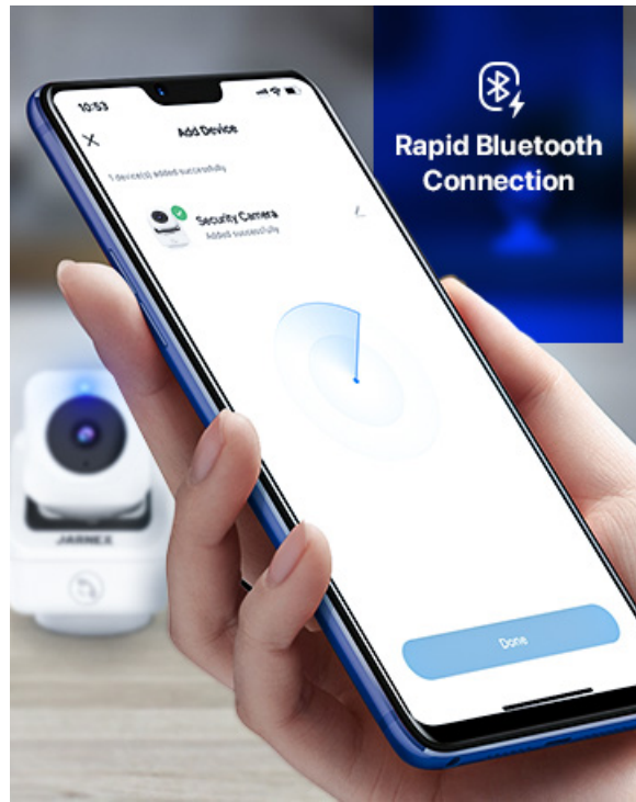
Image: A smartphone screen displaying a "Successfully Connected!" message, indicating a successful Bluetooth pairing with the security camera.