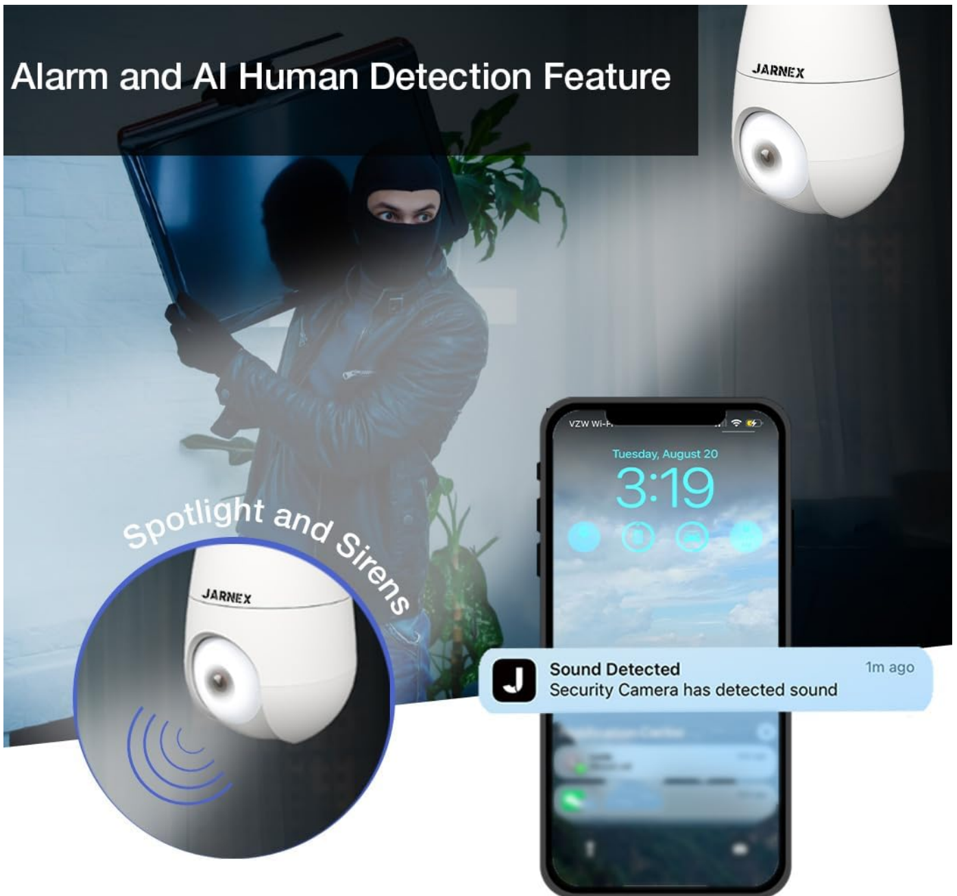
Image: An illustration showing the camera detecting an intruder and a smartphone receiving a "Sound Detected" push notification, demonstrating the alarm and AI human detection feature.