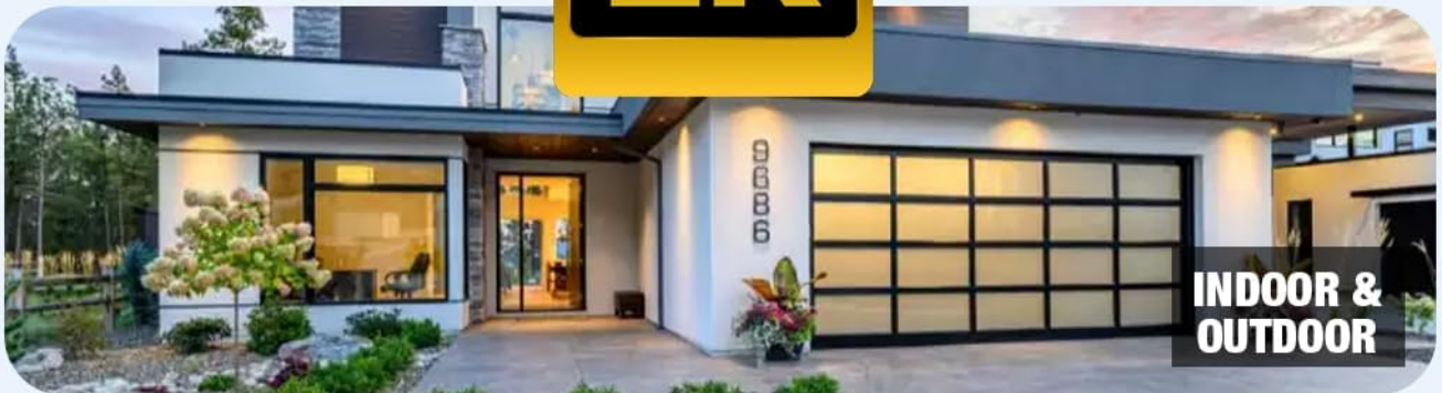
Image: A graphic demonstrating the dual-band 2.4GHz and 5GHz Wi-Fi capabilities, showing how it enhances connection speed and stability throughout a home.