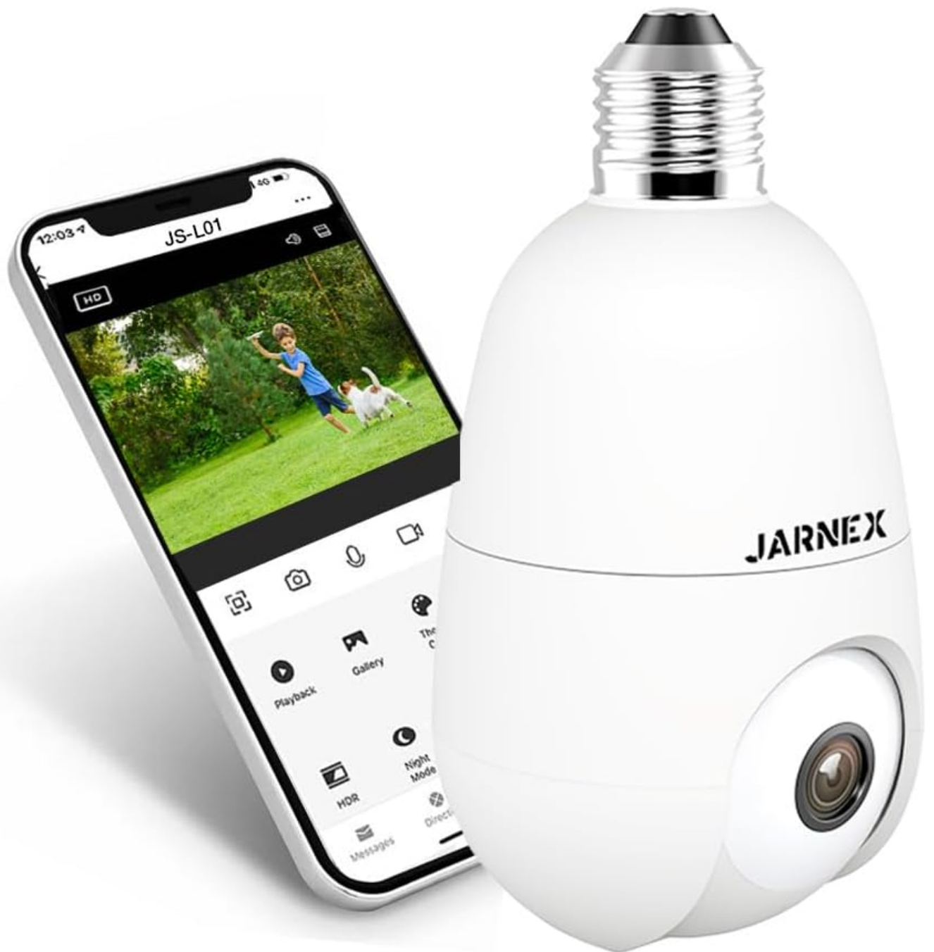
Image: The Jarnex 4MP Bulb Home Security Camera shown alongside a smartphone displaying the live feed and control options within the companion application.