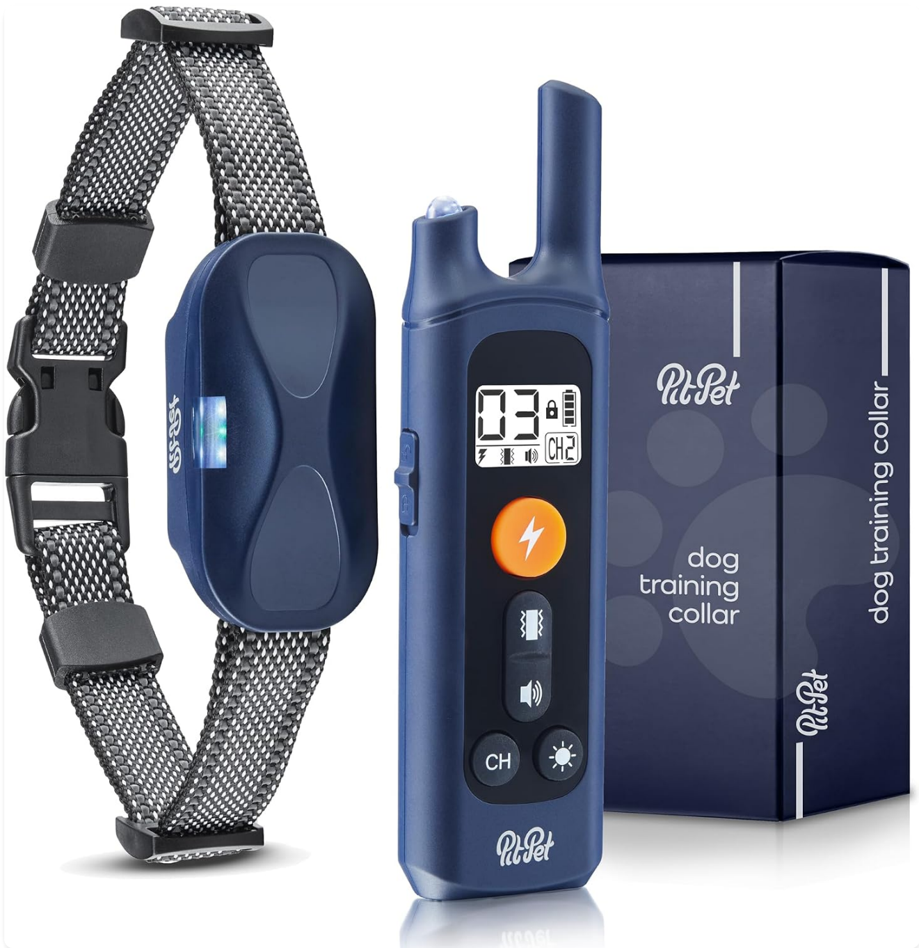
Image: The Pitpet Dog Training Collar system, featuring the remote control, collar receiver, and product packaging.