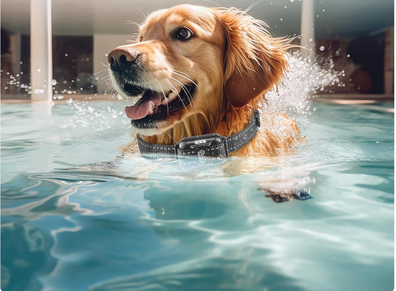
Image: A Golden Retriever swimming in a pool while wearing the Pitpet Dog Training Collar, illustrating its waterproof design.