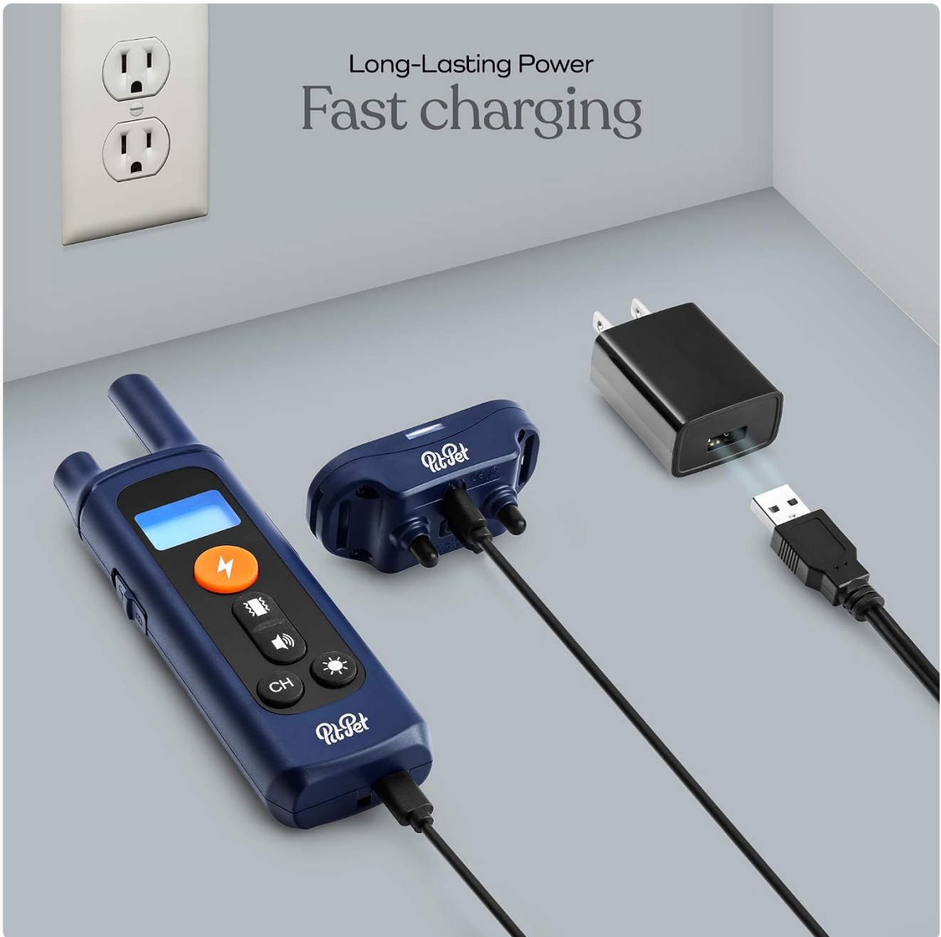
Image: The remote control and collar receiver being charged simultaneously via USB cables, demonstrating the fast-charging capability.