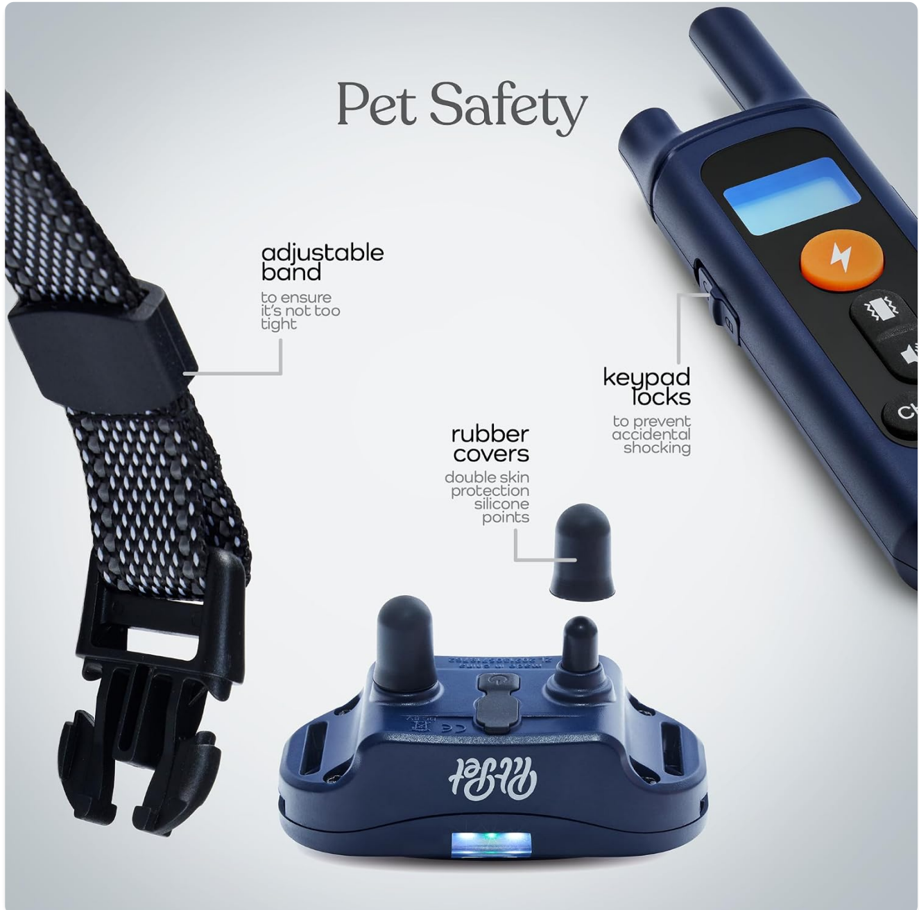
Image: Detailed view of the collar receiver, remote, and collar strap, illustrating the adjustable band, protective rubber covers for contact points, and the keypad lock feature on the remote.