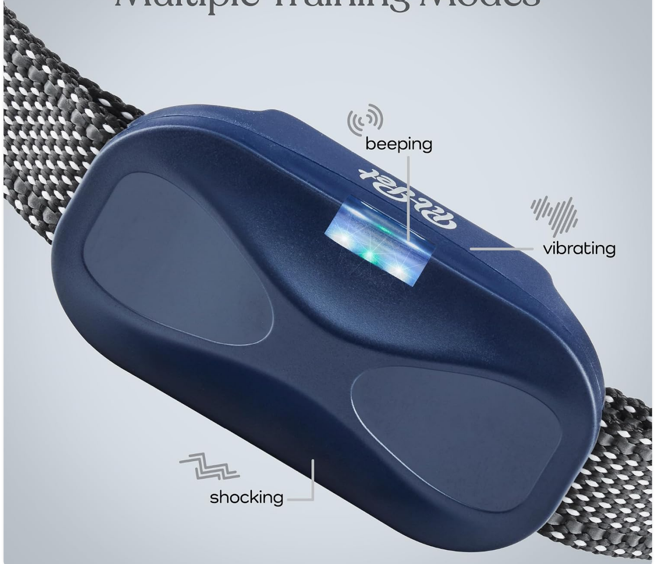
Image: A close-up view of the collar receiver, with visual cues indicating the beeping, vibrating, and shocking functions.