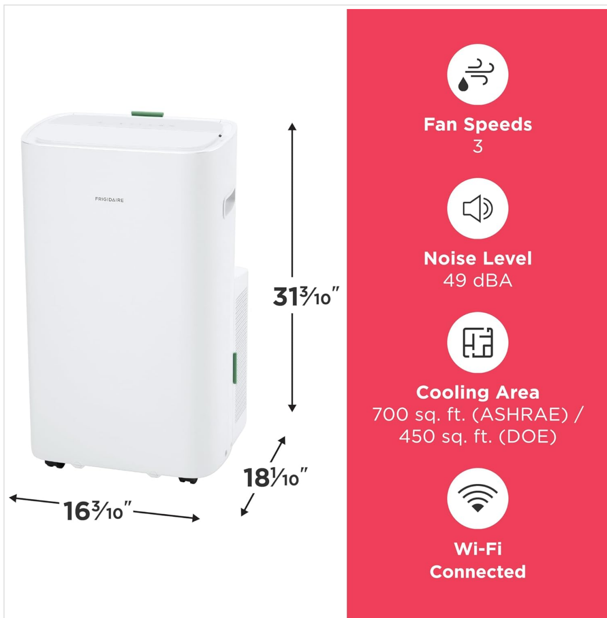
Image: A visual representation of the unit's dimensions, indicating its compact size for various room layouts.