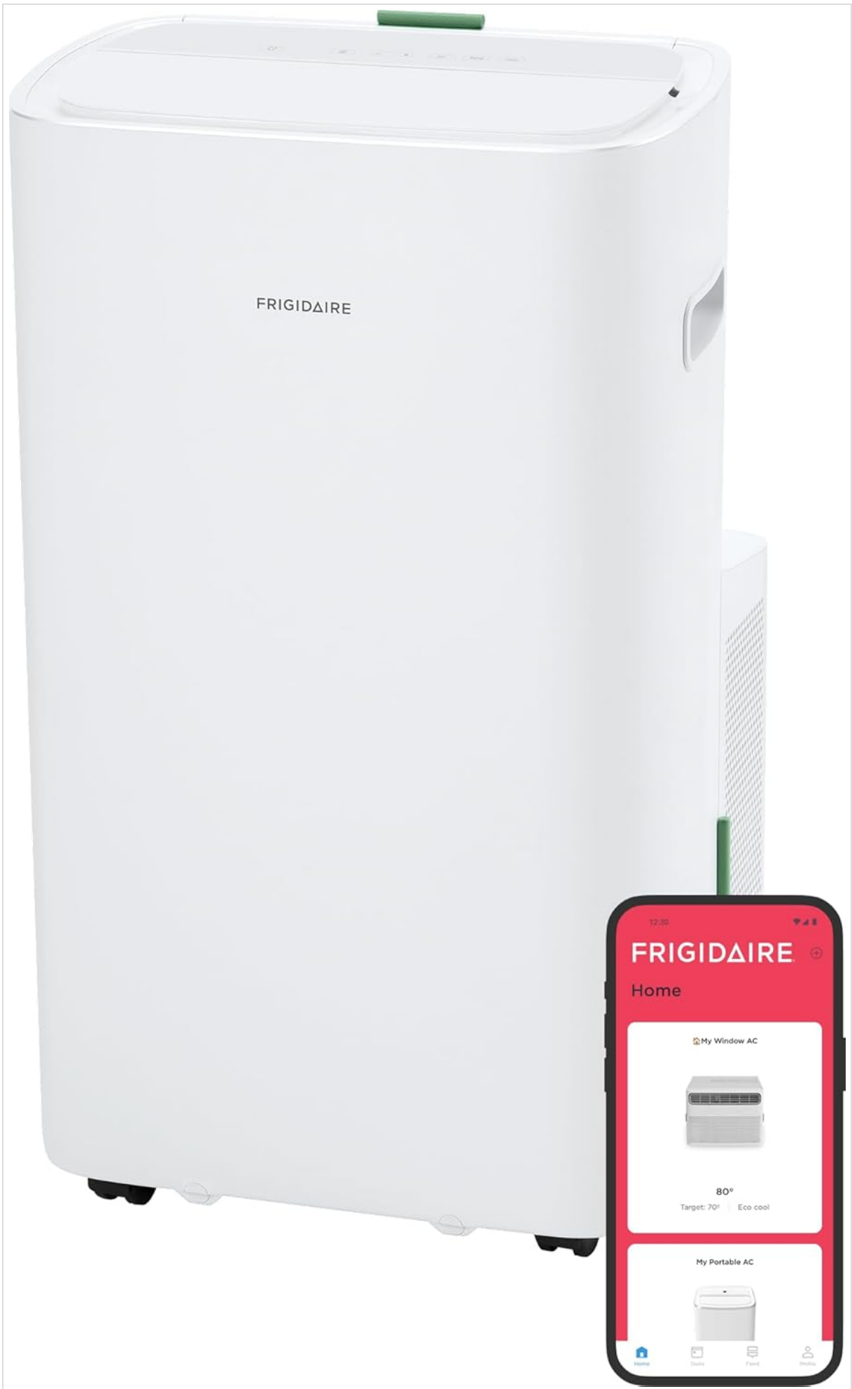
Image: The portable air conditioner alongside a smartphone, illustrating its Wi-Fi connectivity and control via the Frigidaire app.