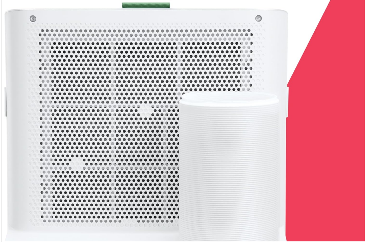
Image: A detailed view of the washable filter, illustrating its design for capturing dust and ease of maintenance.