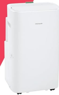
Image: The portable air conditioner positioned in a room, demonstrating typical placement near a window for exhaust.

Easily manage your home's temperature levels with this portable air conditioner