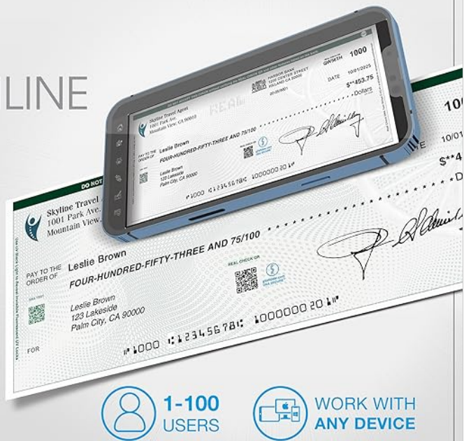
Figure 5.1: Illustration of the DNA Secure Check Printing Process, highlighting various security elements on a printed check.